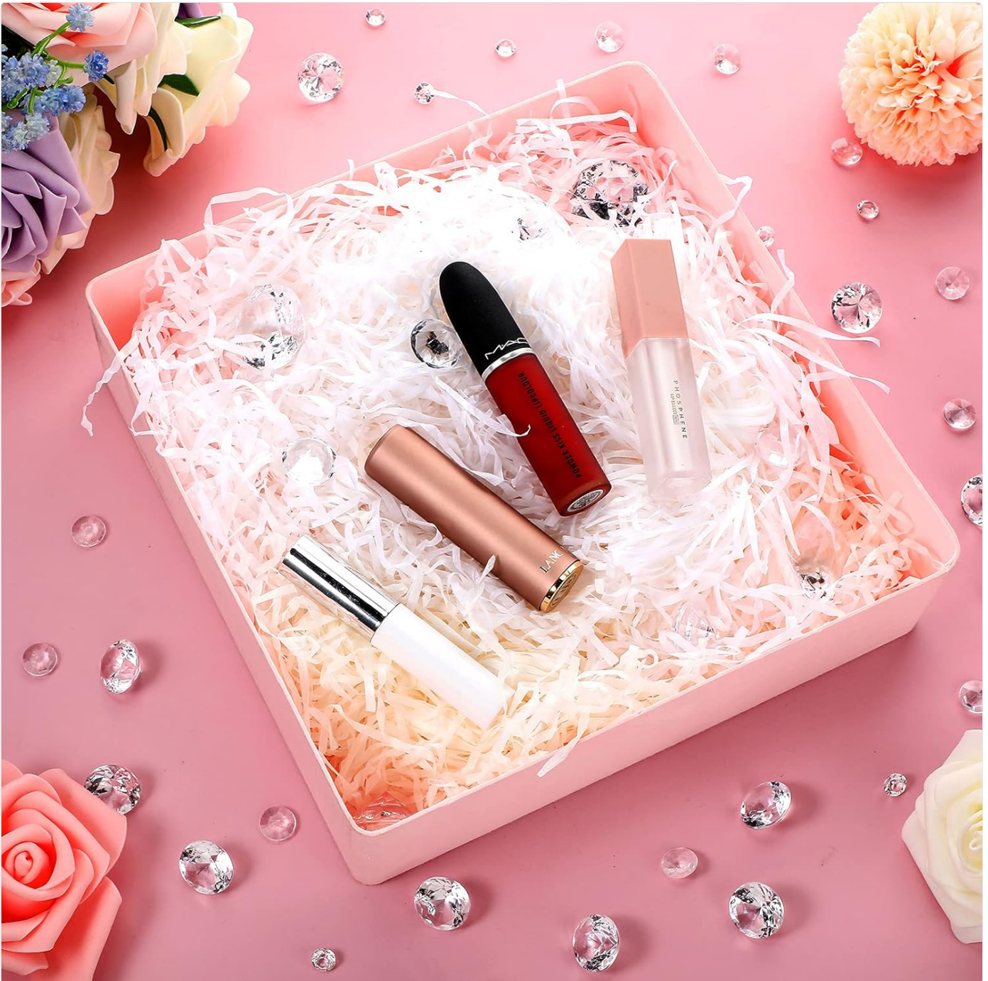
Image: This image shows the acrylic diamonds used as decorative filler within a pink gift box alongside cosmetic products, illustrating their use in presentation and packaging.