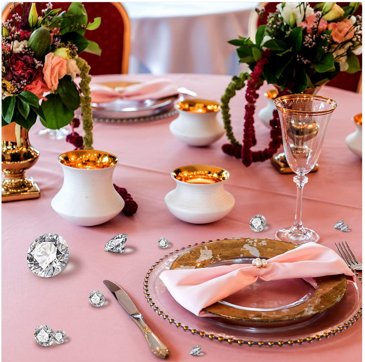
Image: This image displays the acrylic diamonds used as table scatter on a formal pink table setting, highlighting their effectiveness in enhancing event decor.