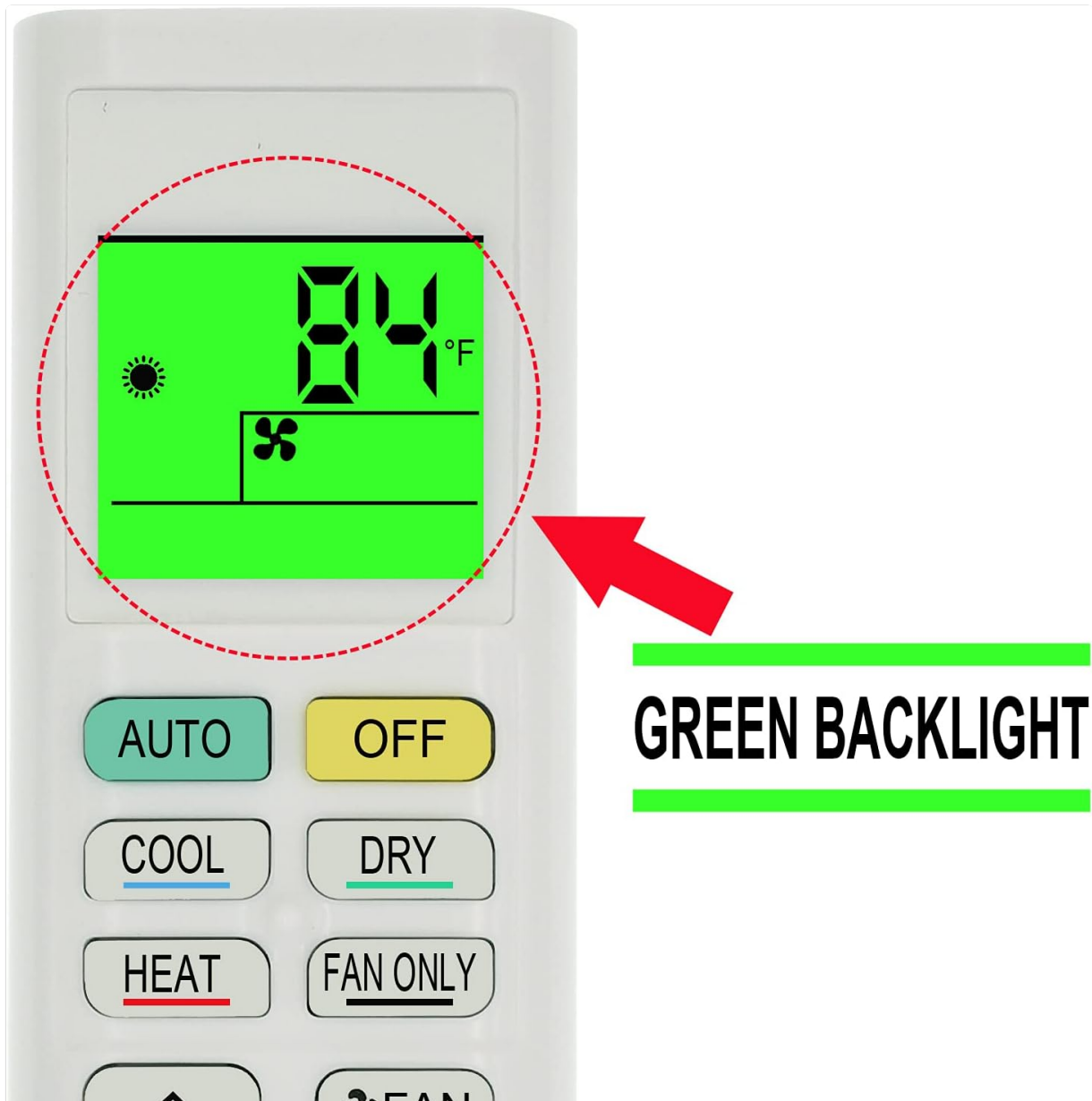
Figure 4: Remote control display with green backlight activated.