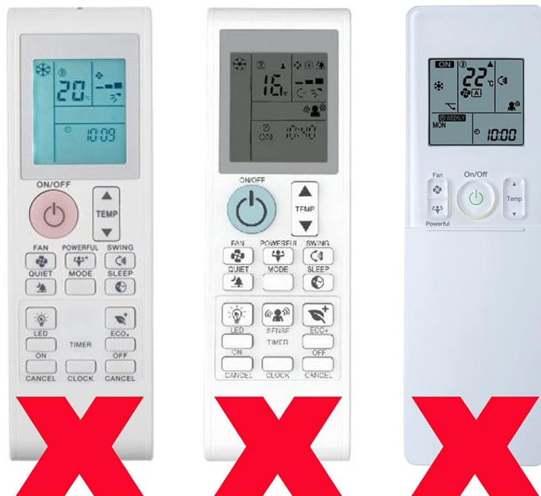
Figure 1: Examples of incompatible remote control models. This remote will not function with these types.

This item is NOT compatible with following picture remote control models: