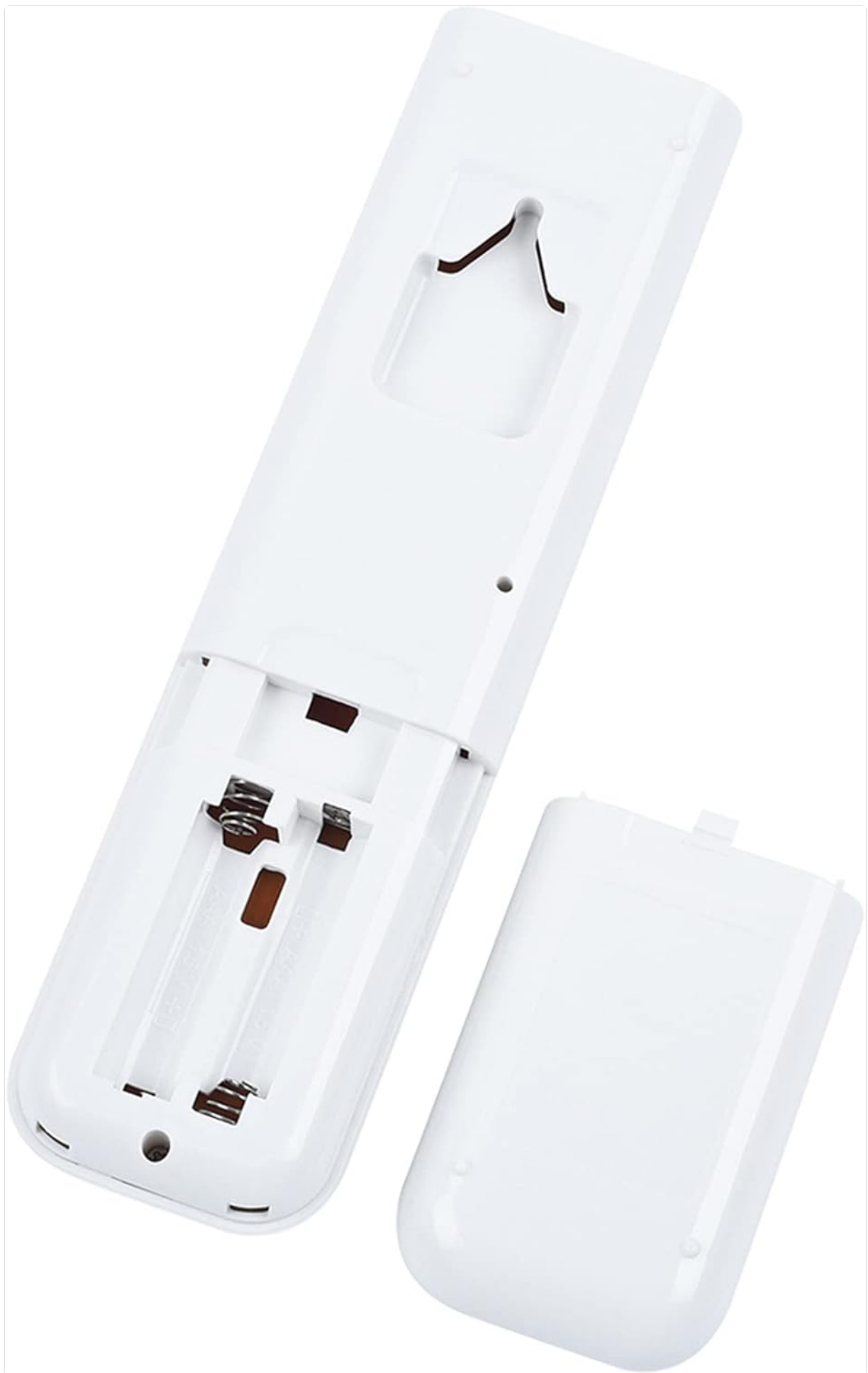
Figure 2: Battery compartment on the back of the remote control.