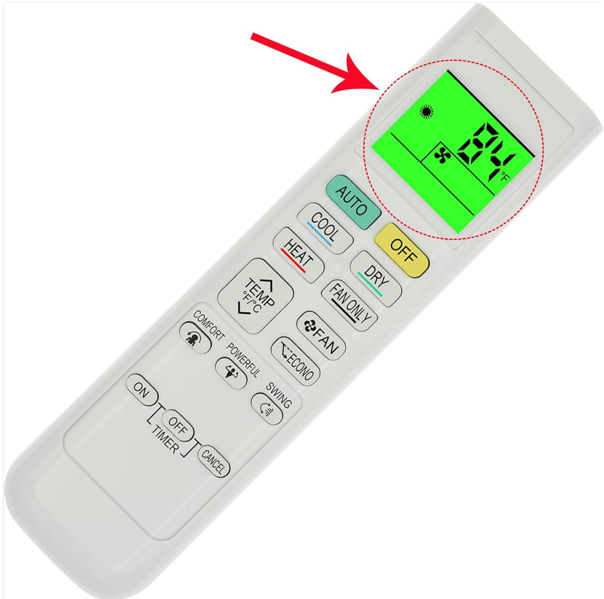
Figure 3: Overview of the remote control and its display.

Familiarize yourself with the buttons and their functions: