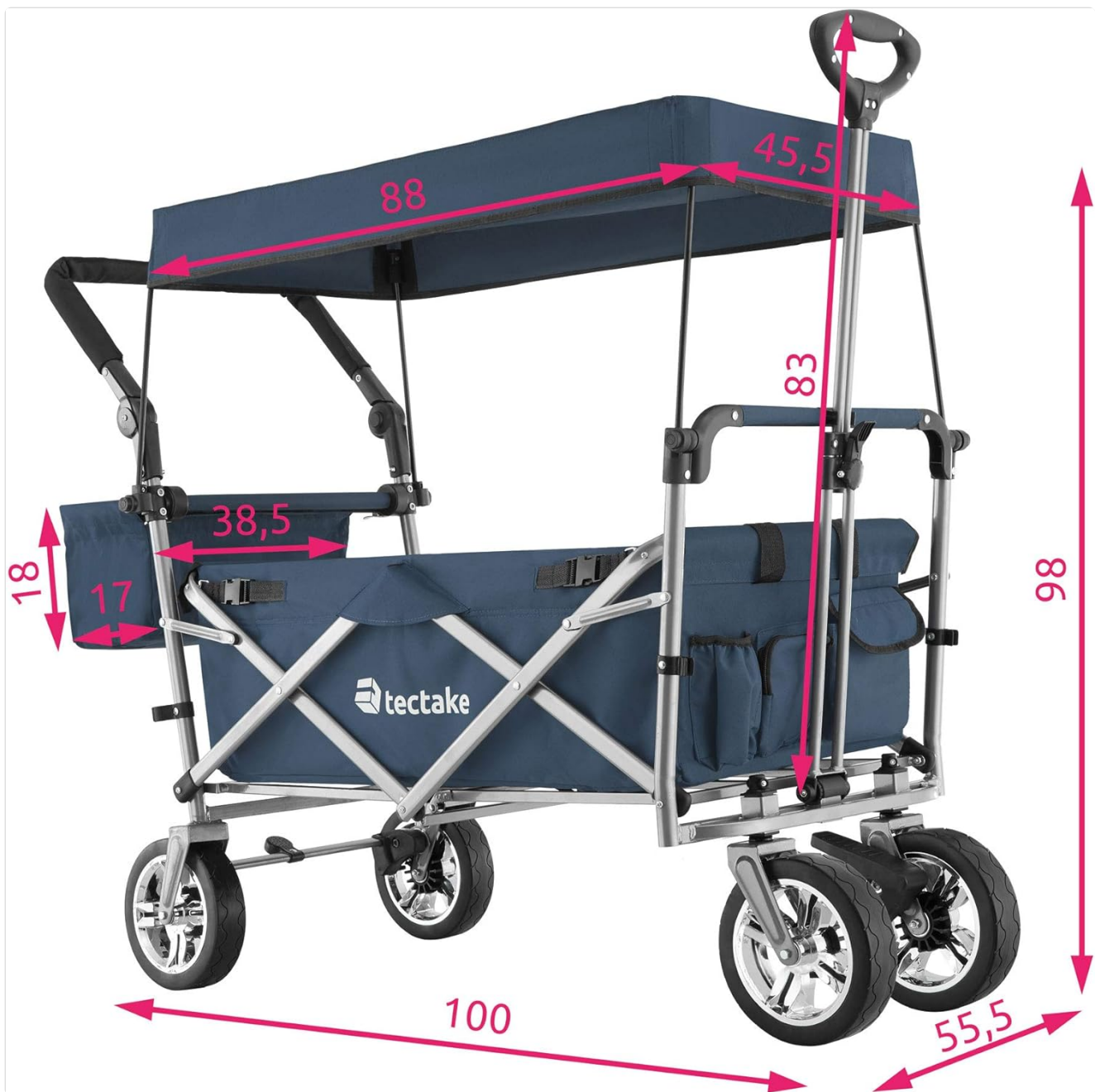
Figure 8.1: Overall dimensions of the handcart.