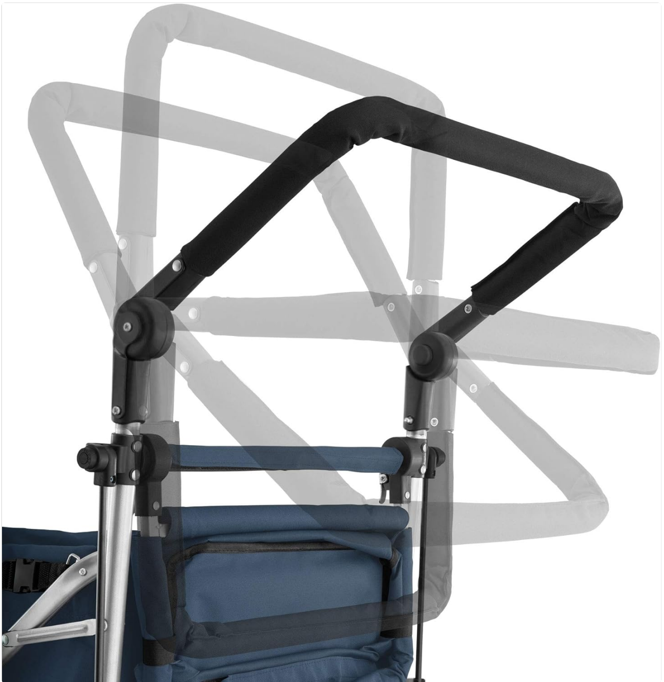
Figure 4.3: Range of motion for the push bar.