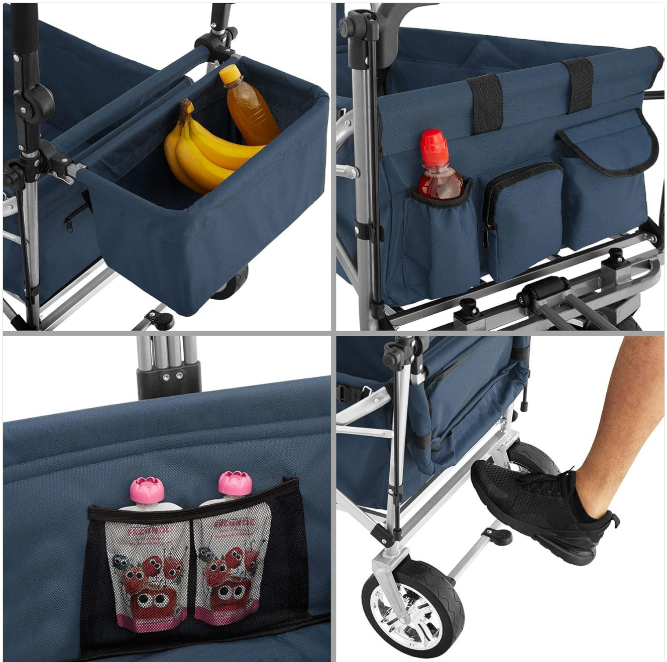
Figure 5.1: Various storage pockets for convenience.