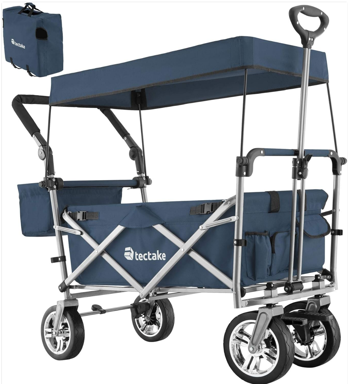
Figure 3.1: The tectake Foldable Handcart with Roof and its included carry bag.