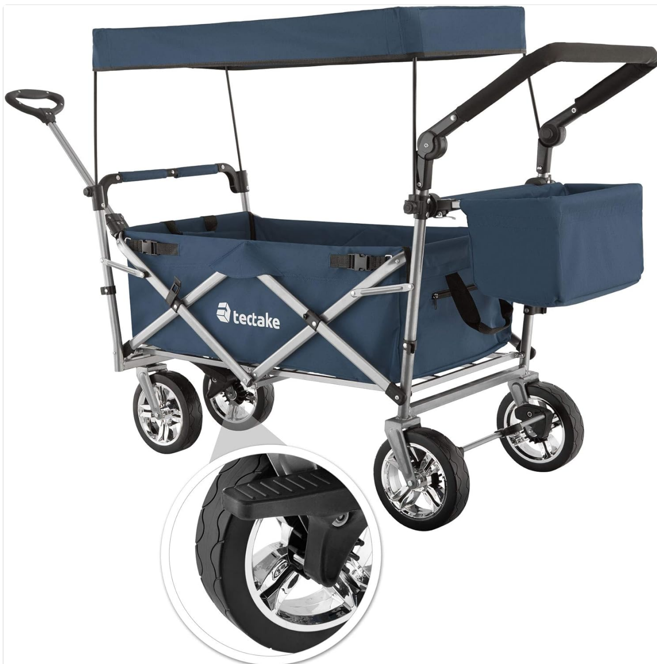
Figure 5.2: Front wheel brake and rear foot brake detail.