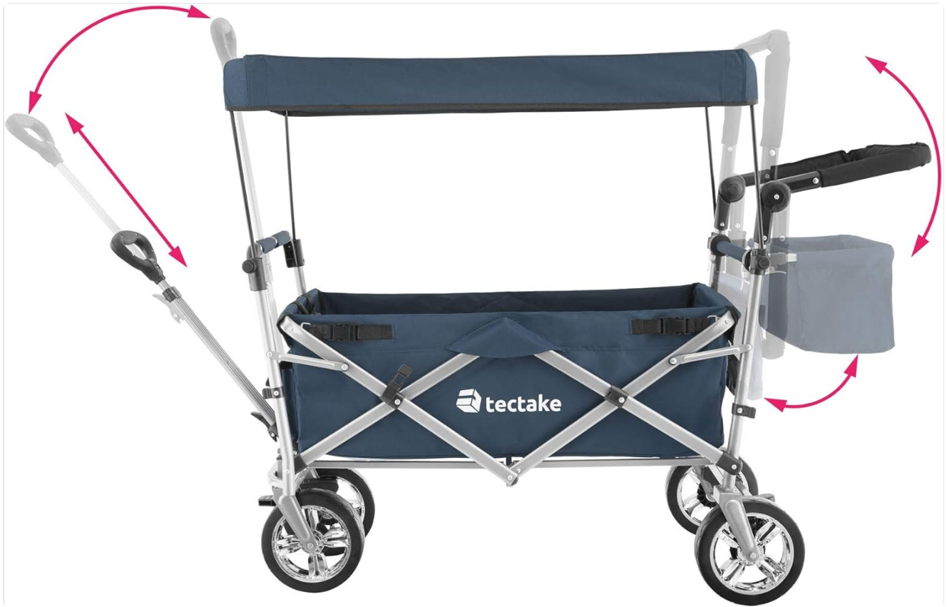
Figure 4.2: Adjustable drawbar and push handle.