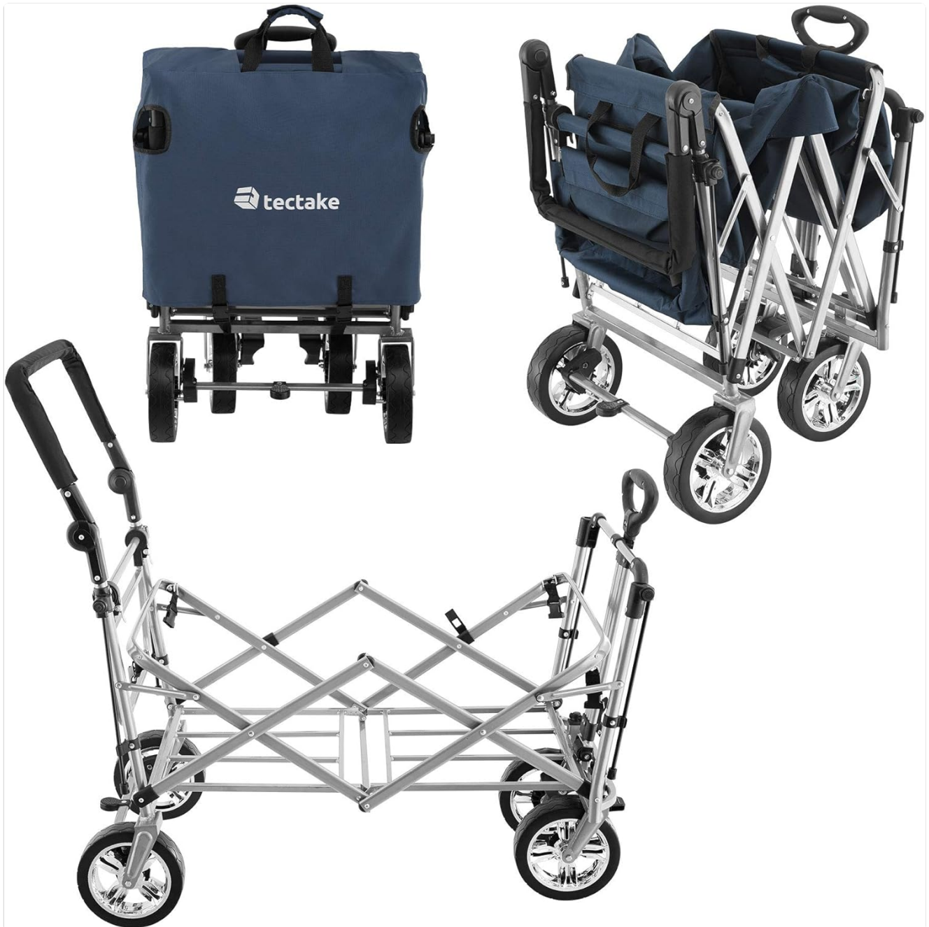
Figure 4.1: Visual guide for unfolding the handcart frame.