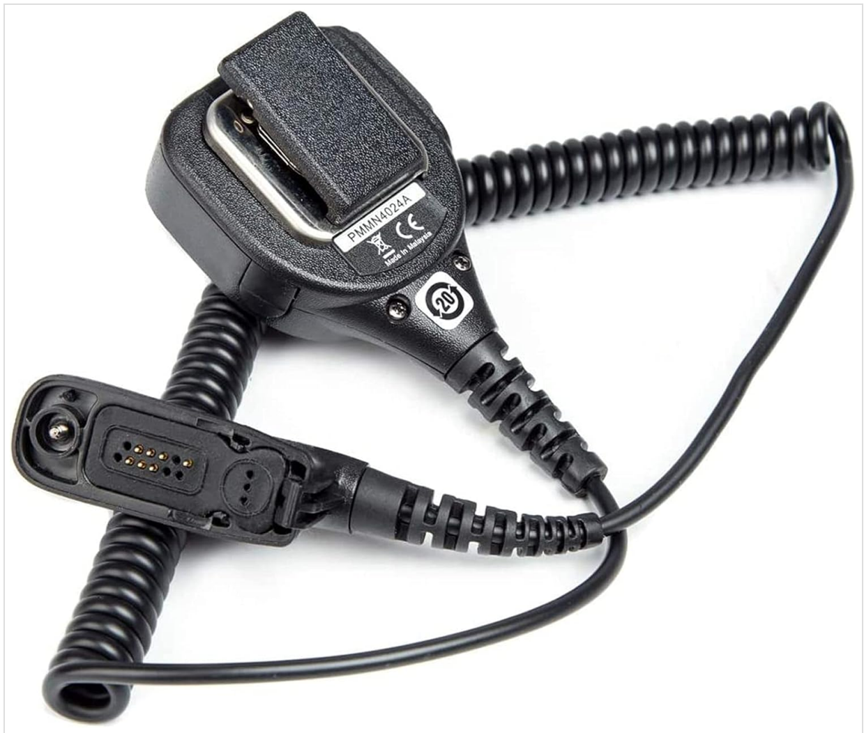
Image 4: The LUITON Speaker Microphone with its coiled cable and multi-pin connector, ready for attachment to a radio.