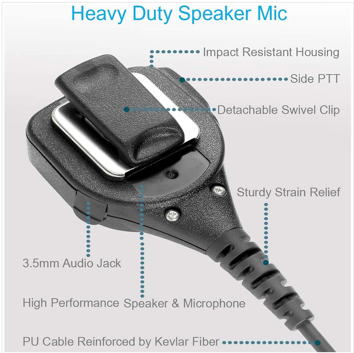
Image 1: LUITON Speaker Microphone with key features labeled, including impact-resistant housing, side PTT, detachable swivel clip, 3.5mm audio jack, high-performance speaker and microphone, sturdy strain relief, and PU cable reinforced by Kevlar fiber.