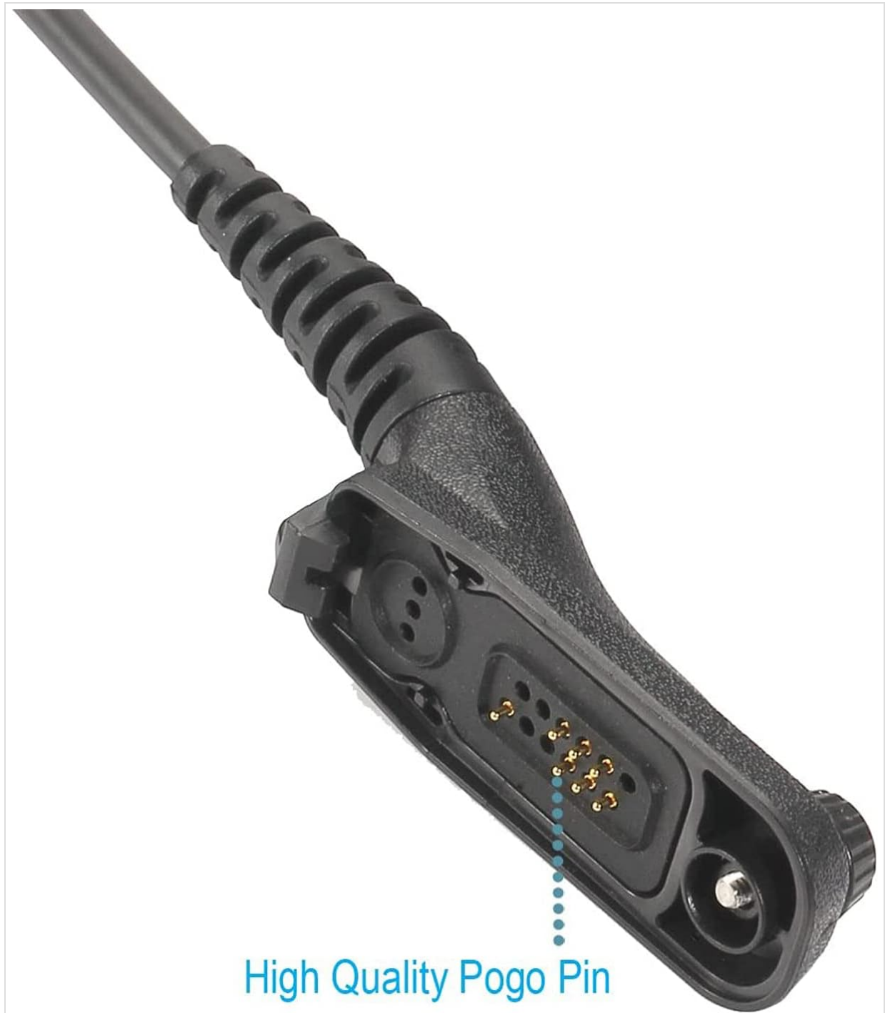
Image 3: Close-up view of the speaker microphone's high-quality multi-pin connector (Pogo Pin) designed for secure connection to compatible radios.