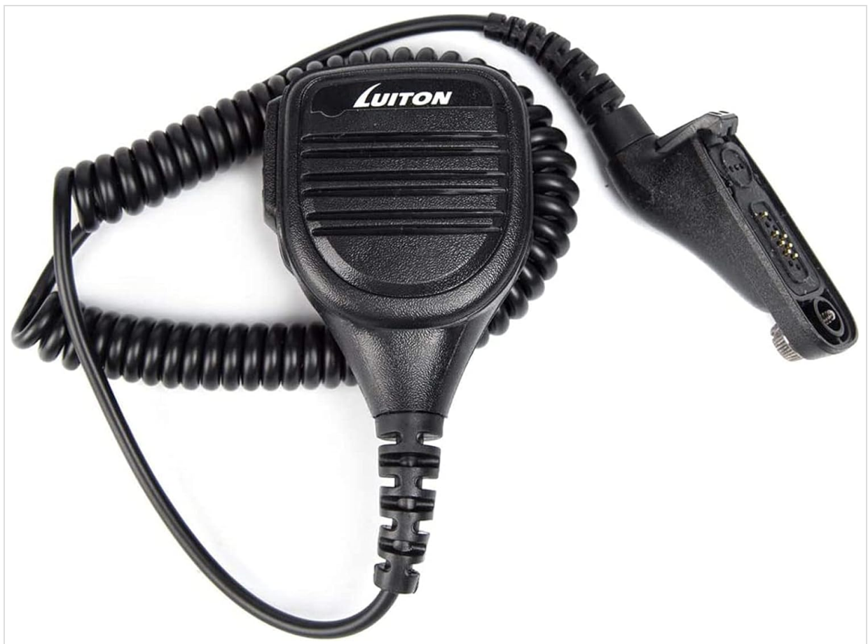
Image 5: Front view of the LUITON Speaker Microphone, showing the speaker grille and the LUITON brand logo.