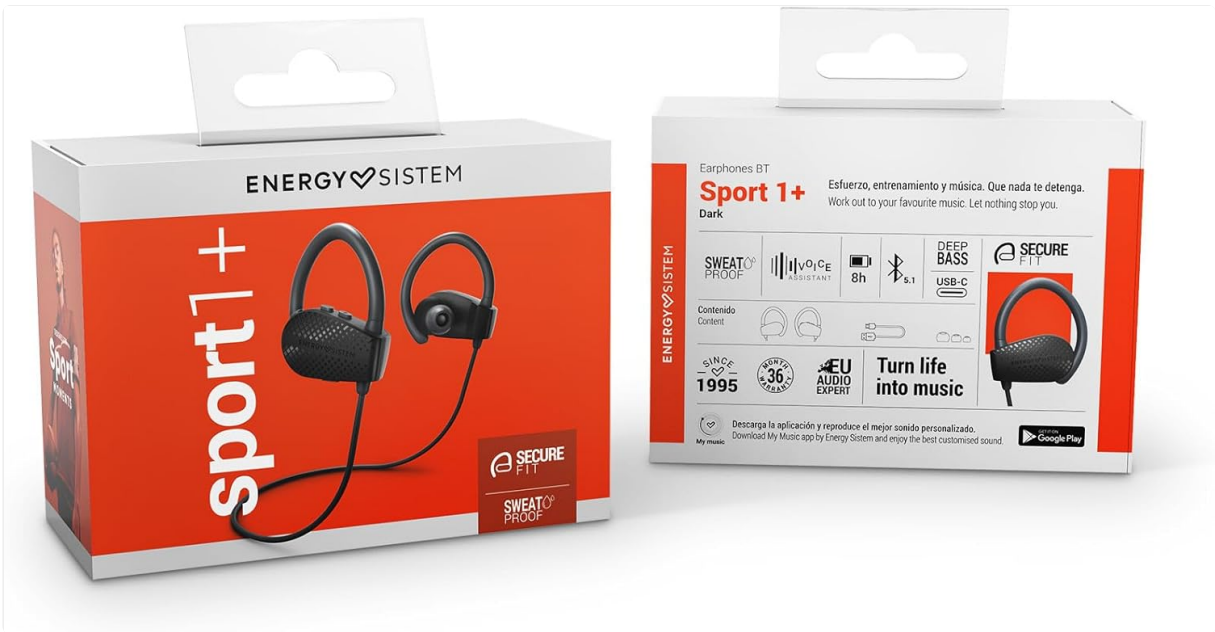
Image: Retail packaging of the Energy Sistem Sport 1+ Dark Bluetooth Earphones, showing the earphones and included accessories.