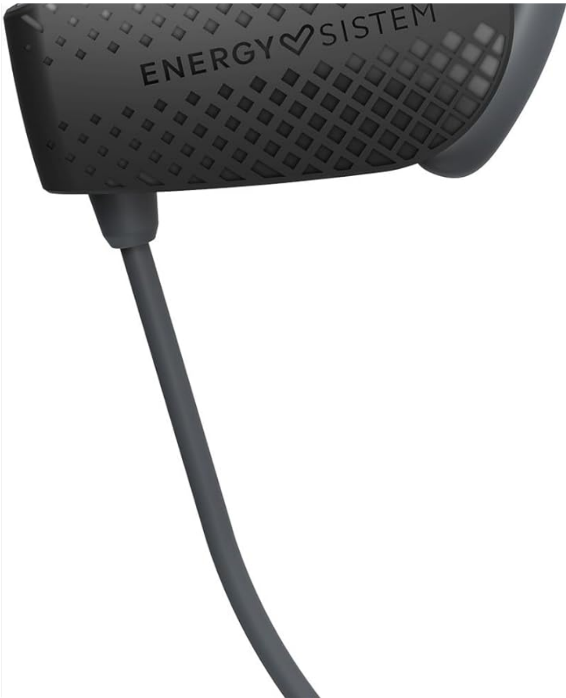
Image: Close-up of a single earbud, showing the ear tip and the secure-fit hook.