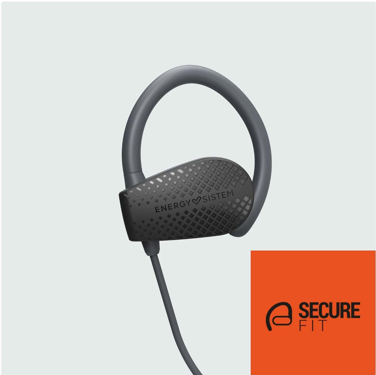
Image: Illustration of the Secure-Fit design, showing how the ear hook provides stability.