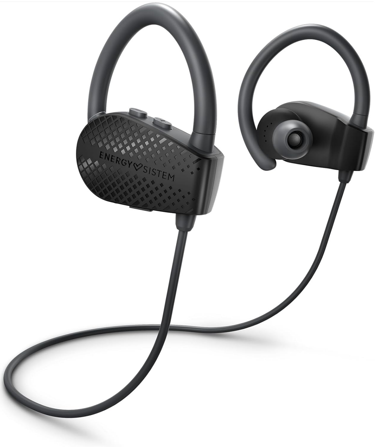
Image: Front view of the Energy Sistem Sport 1+ Dark Bluetooth Earphones, highlighting the ear hooks and control panel on the right earbud.