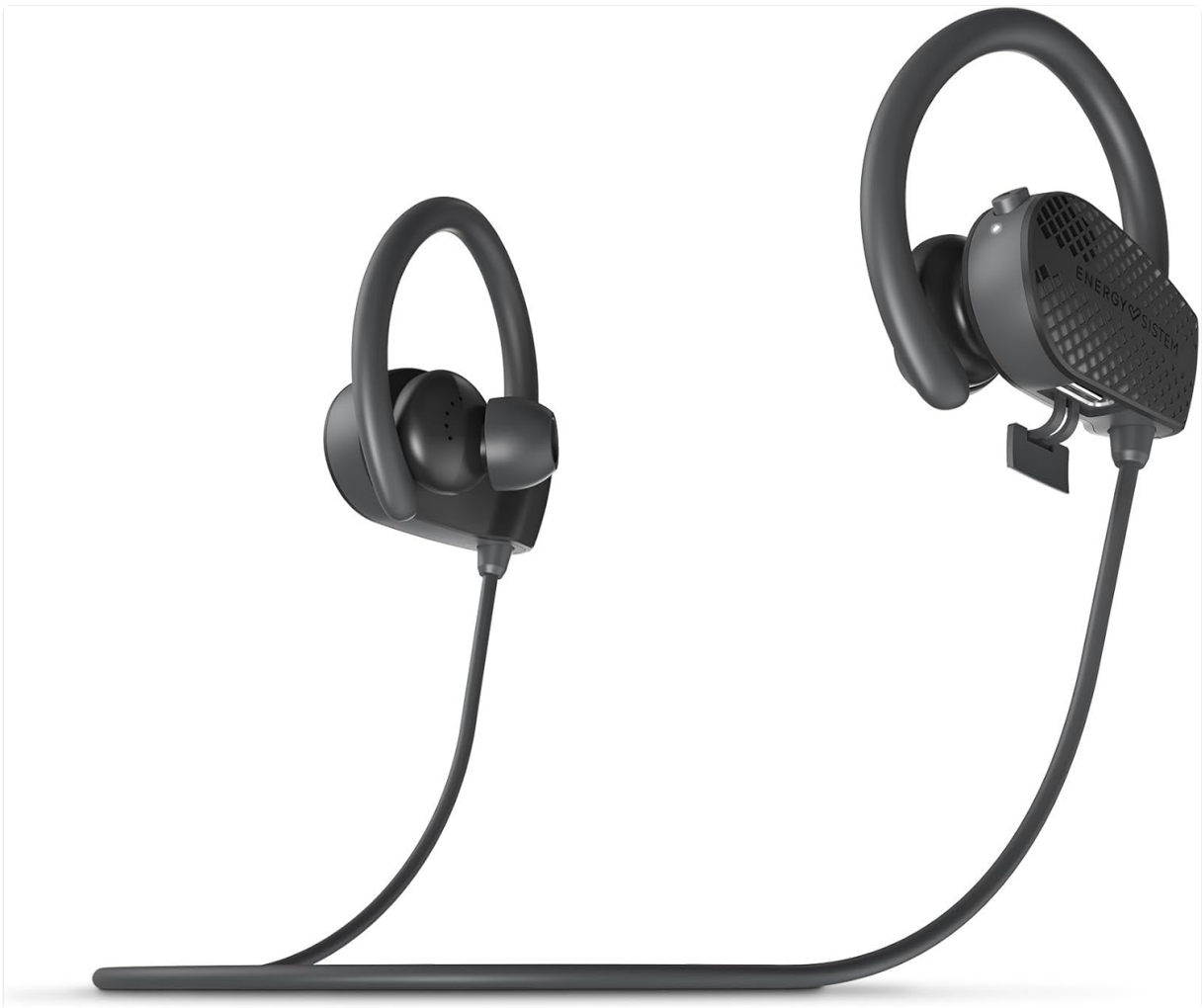
Image: Side view of the earphones, showing the ergonomic design and the cable connecting the two earbuds.