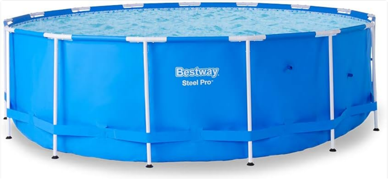
Image: The Bestway Steel Pro 15 Foot x 48 Inch Round Frame Above Ground Swimming Pool, ready for assembly.

Note: A filter pump and ladder are not included with this pool set and must be purchased separately if desired.