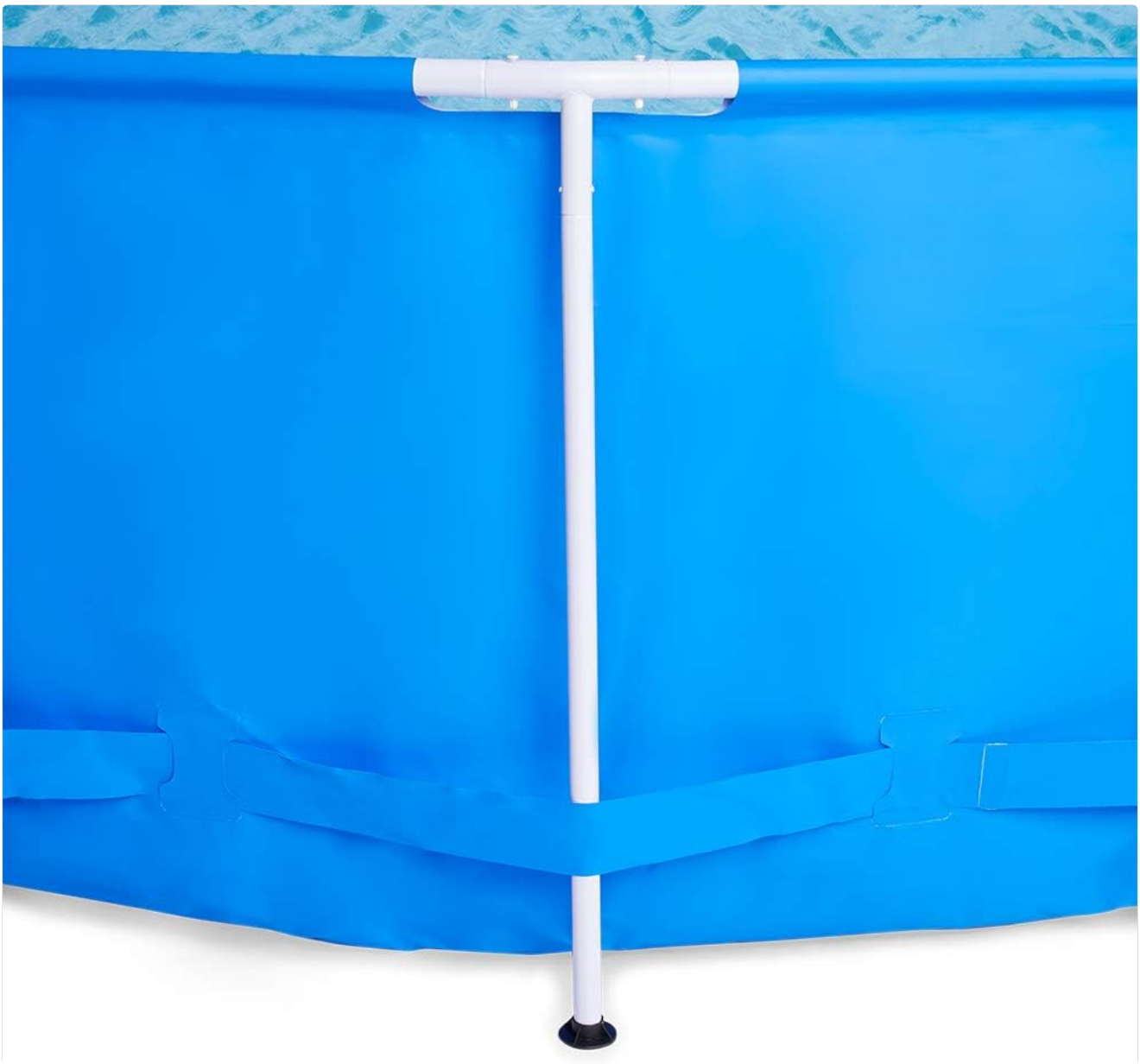
Image: A close-up view of the Bestway Steel Pro pool frame, highlighting the sturdy leg and horizontal beam connection.