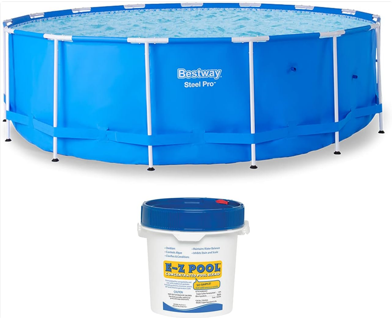
Image: The Bestway Steel Pro 15 Foot x 48 Inch Round Frame Above Ground Swimming Pool shown with the E-Z Pool All-in-1 Solution Blend container.