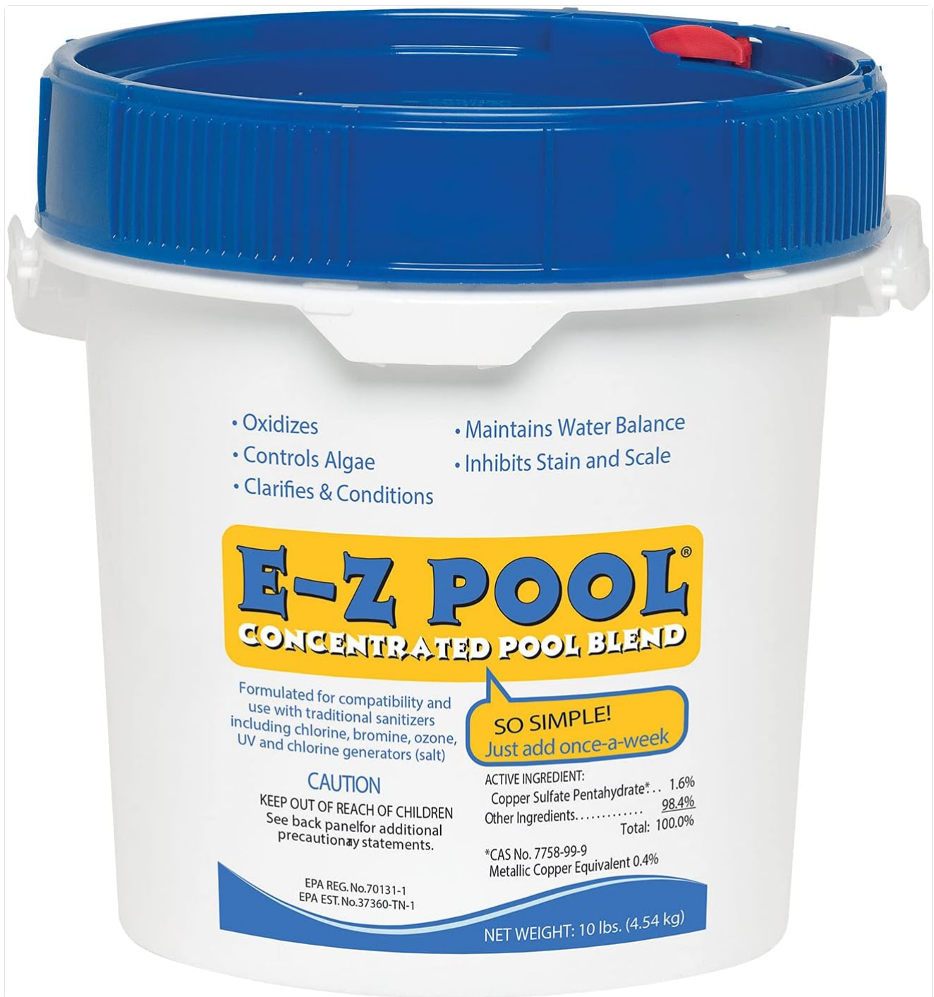
Image: The E-Z Pool All-in-1 Concentrated Pool Care Solution Blend shown with a measuring scoop, demonstrating ease of use.