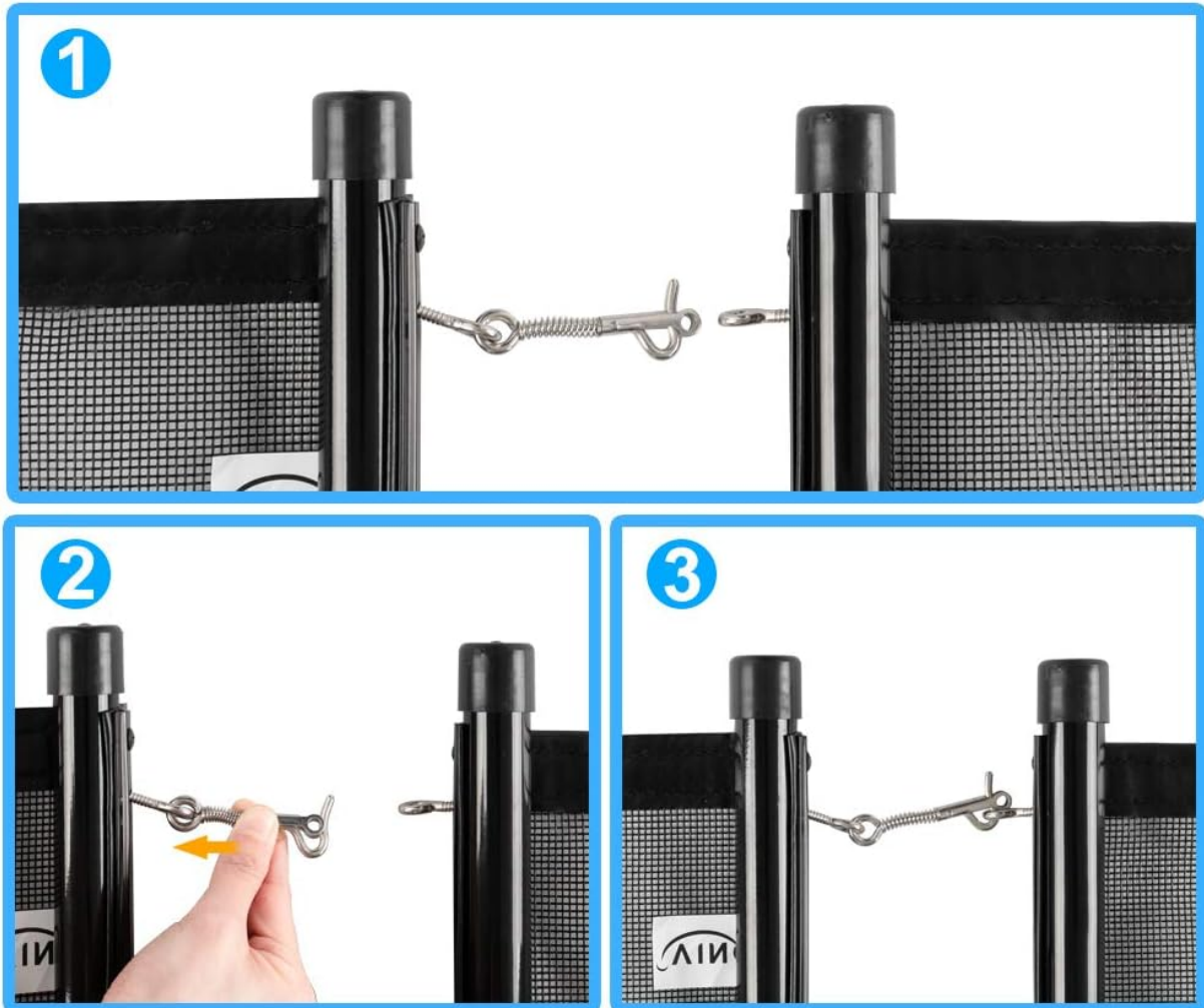
Image: Close-up view of the hook and eye latch system, illustrating how to securely connect and disconnect pool fence sections for access.