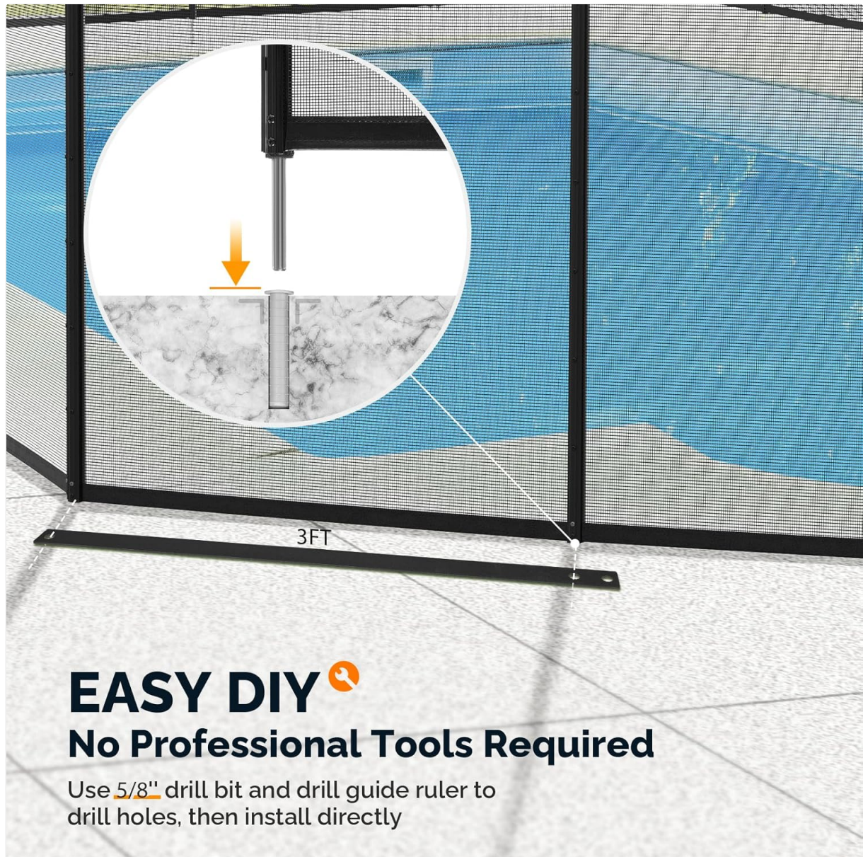
Image: A drill bit and ruler are used to mark precise positions for pool fence installation, ensuring proper alignment and stability.

Video: Official VINGLI Pool Fence Installation Guide. This video demonstrates the step-by-step process for installing the pool fence, including marking, drilling, inserting sleeves, and connecting sections.