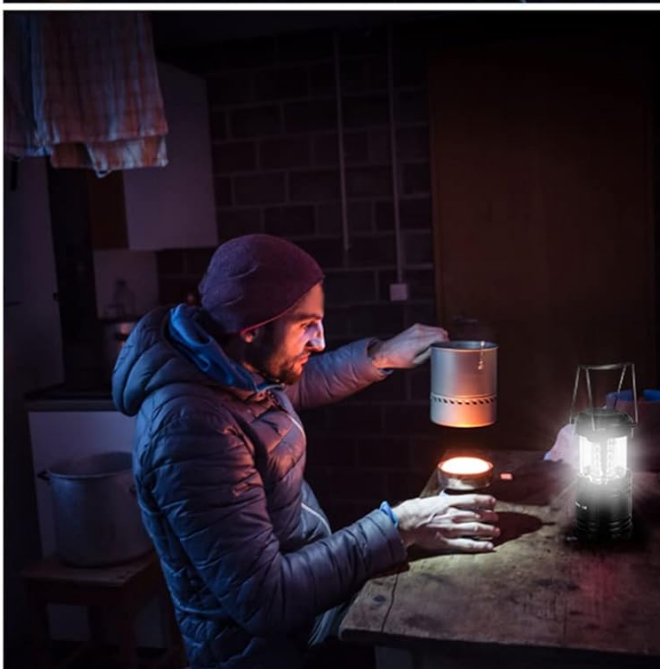
The lantern in various settings: camping, fishing, illuminating a car engine, and providing light indoors during a power outage.