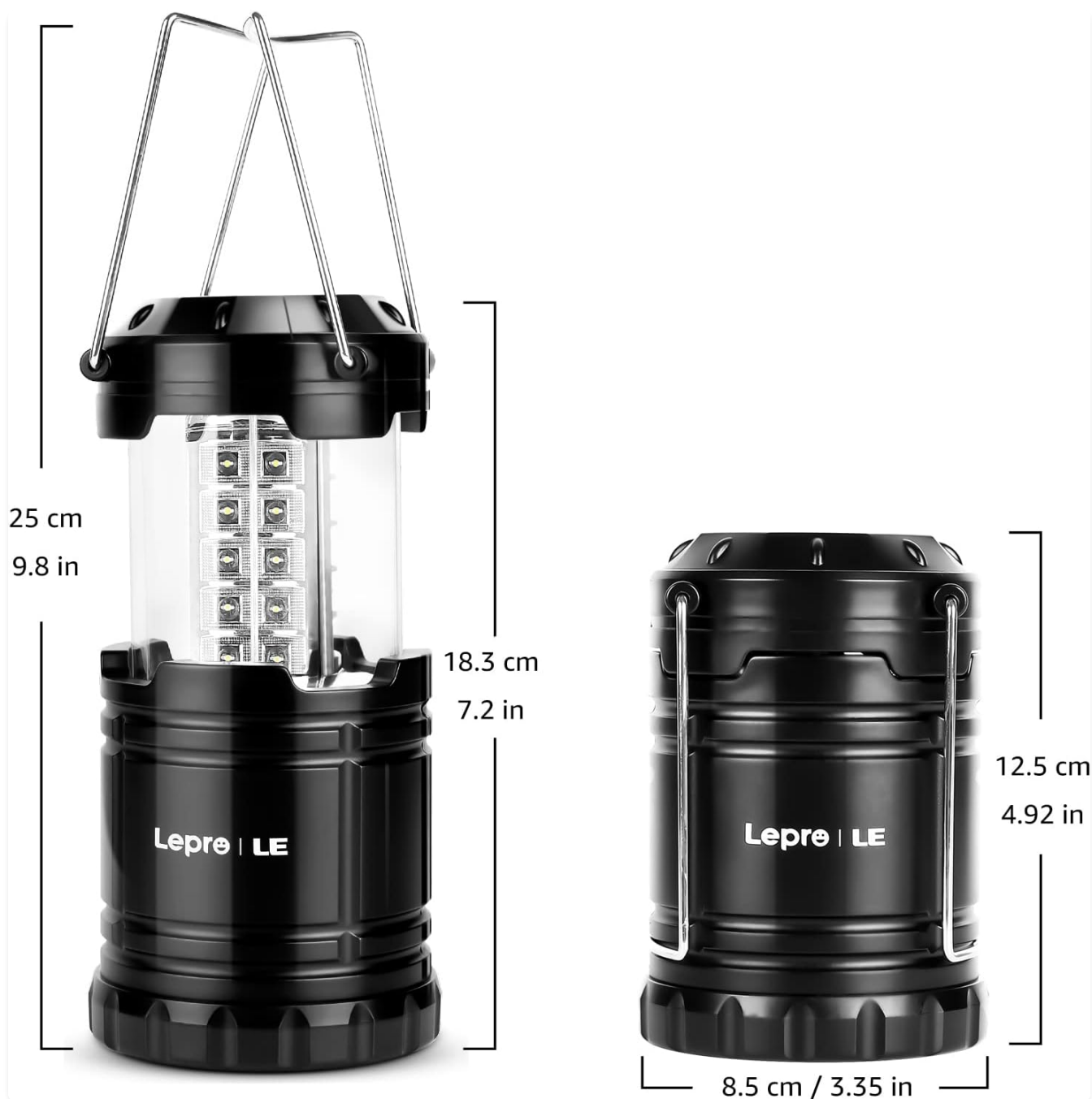
Detailed dimensions of the Lepre LED Camping Lantern in both collapsed and extended states.