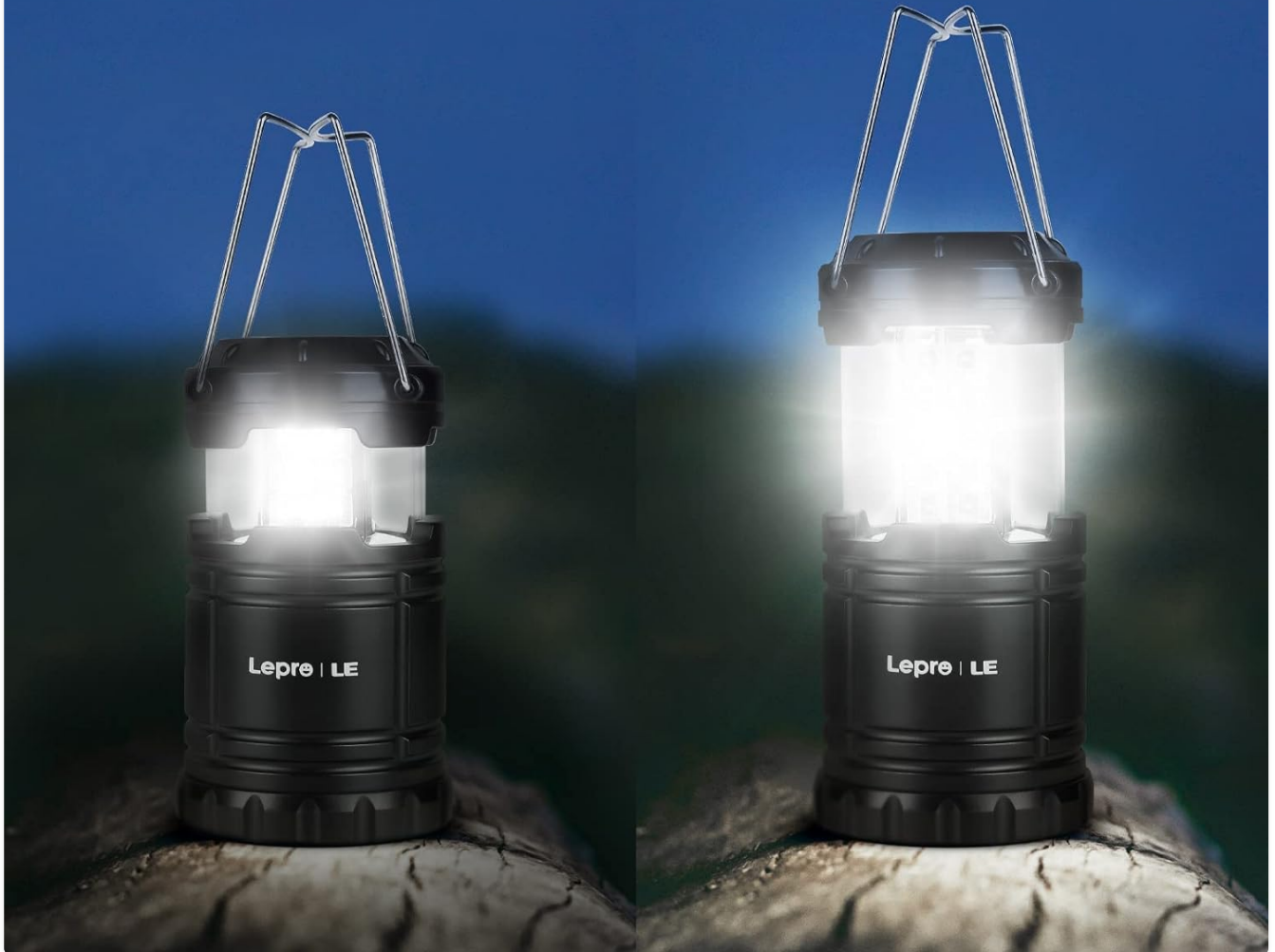
Two lanterns demonstrating the collapsible brightness control, showing a dim setting when partially extended and a bright setting when fully extended.