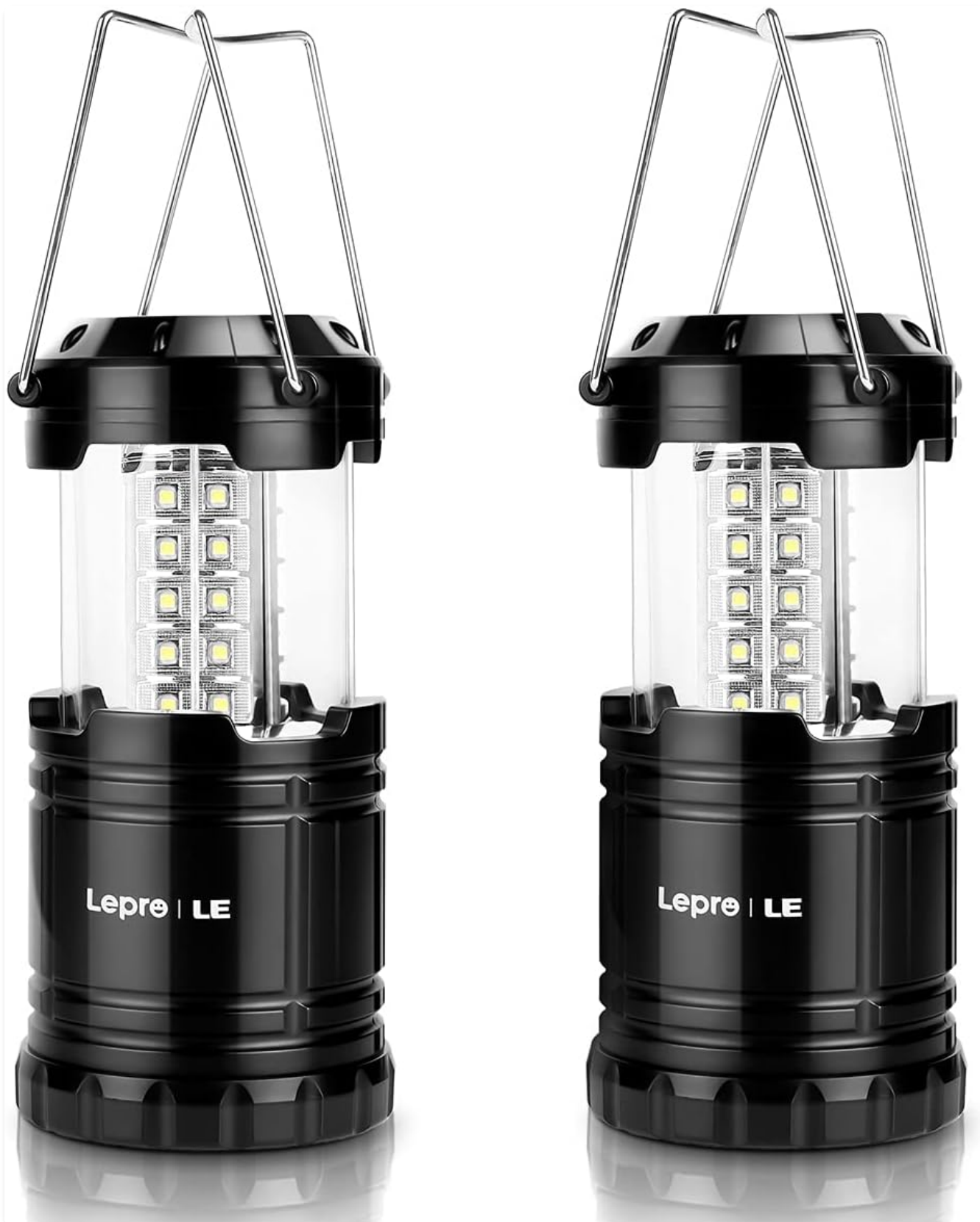
Two Lepre LED Camping Lanterns, showcasing their compact and ready-to-use form.