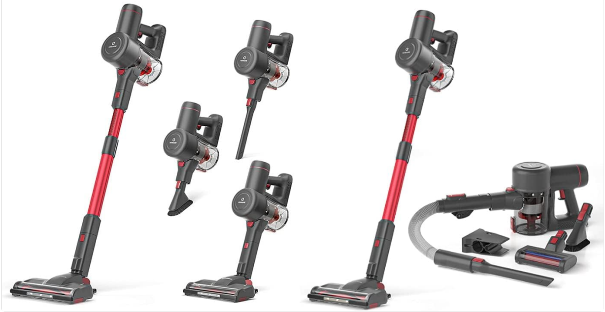
Image 2.1: Various models of NEQUARE S12 series vacuum cleaners compatible with this adapter.