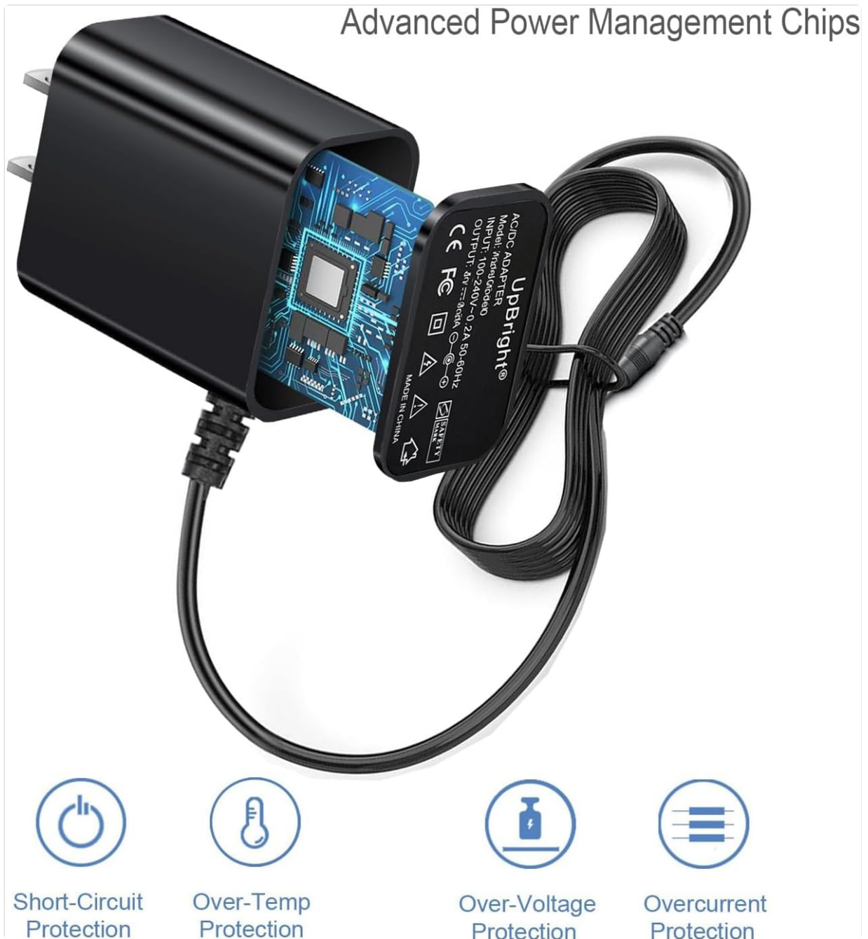
Image 4.1: The UpBright adapter highlighting its built-in safety protection features.