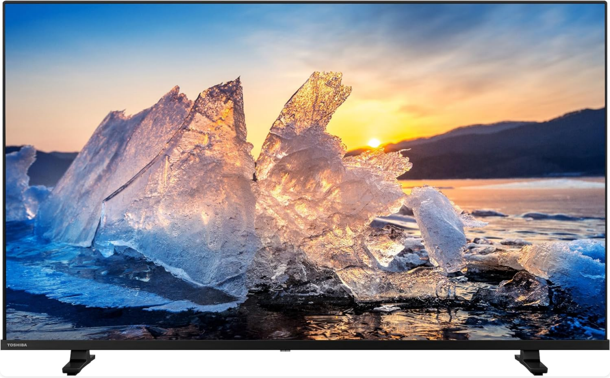
The Toshiba 32-inch Class V35 Series LED HD Smart Fire TV.