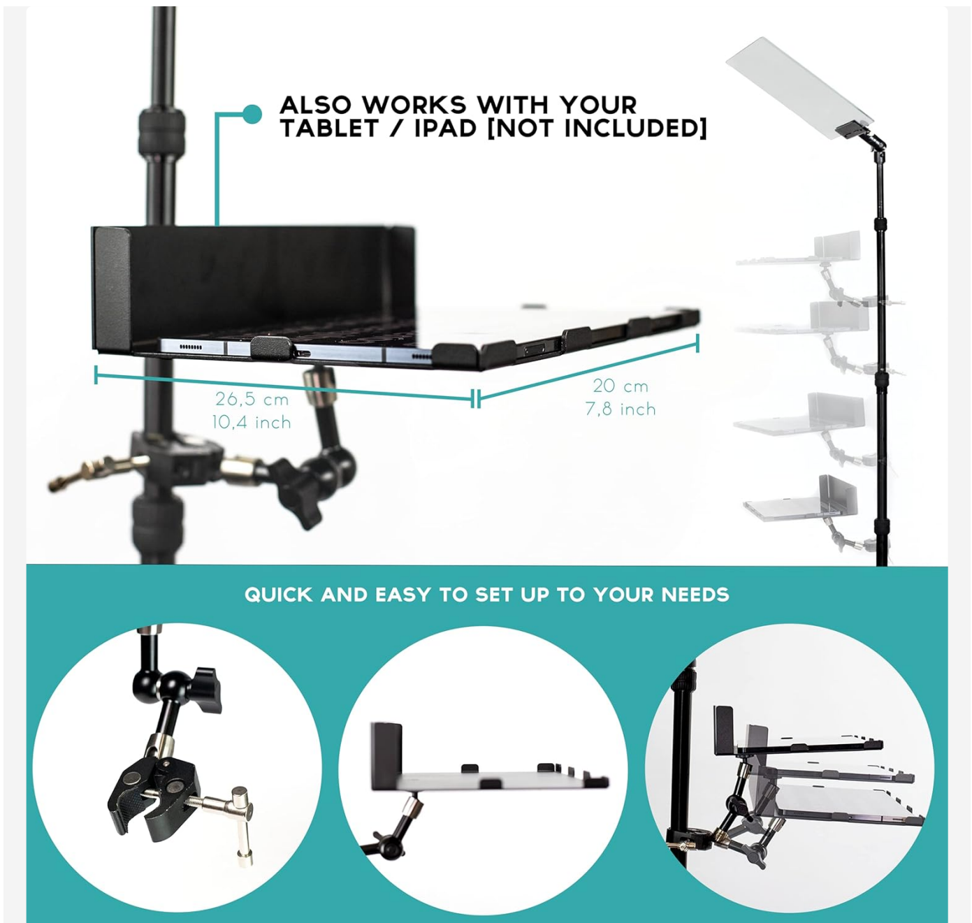
Figure 4: The teleprompter configured for tablet/iPad use, demonstrating the adjustable tray and ease of setup.