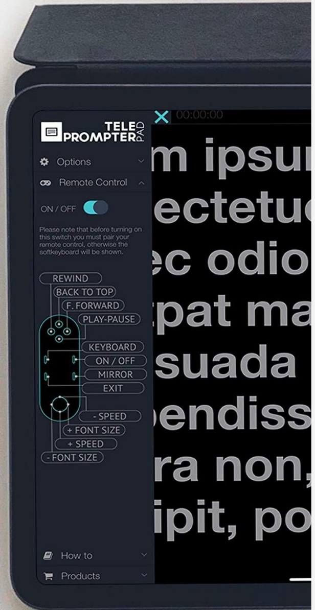
Figure 6: The TeleprompterPAD APP interface, showing options for remote control, text size, speed, and mirror mode.