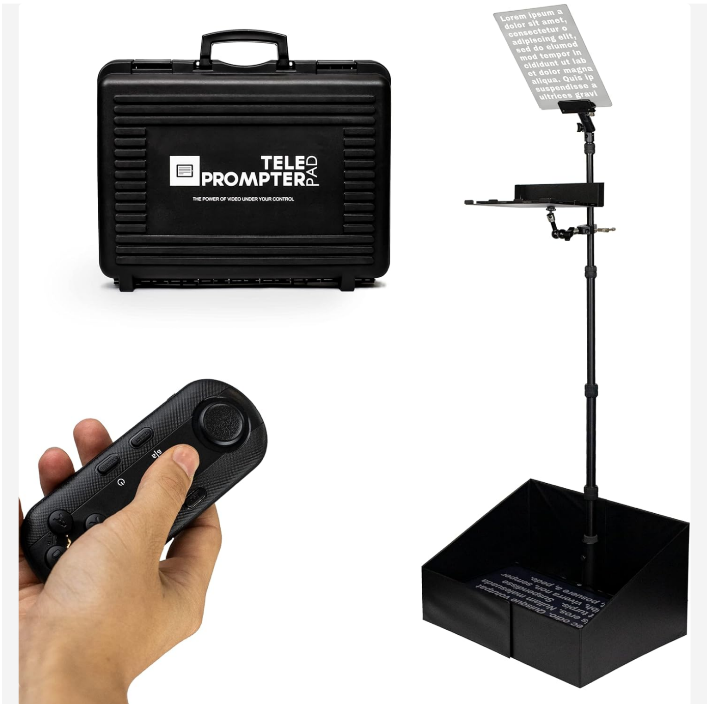
Figure 1: iPresent PRO Teleprompter with included hardcase and remote control.