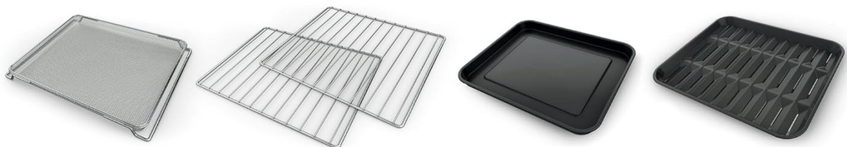
Figure 2: The Ninja Foodi 8-in-1 XL Pro Air Fry Oven DT200 and its five included accessories: air fry basket, two wire racks, roast tray, and crumb tray.