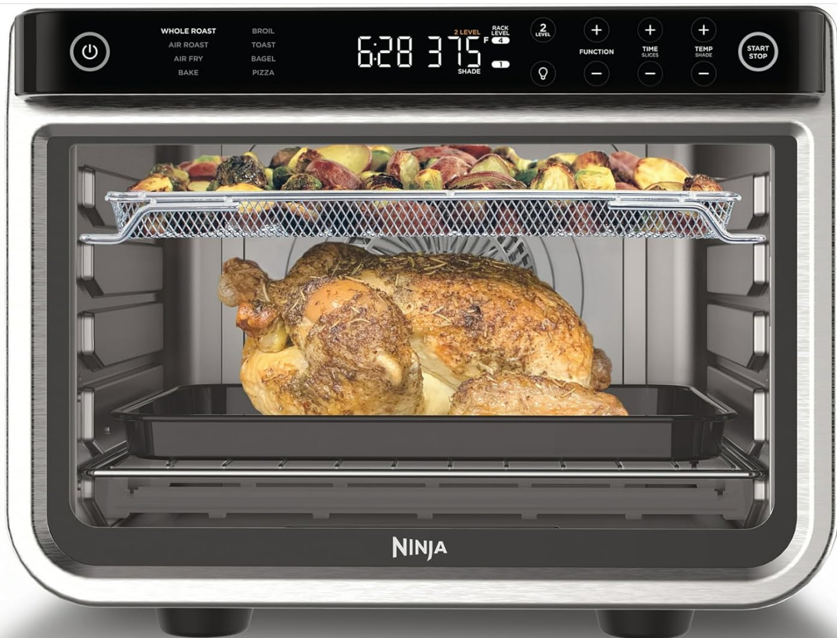
Figure 1: Ninja Foodi 8-in-1 XL Pro Air Fry Oven DT200, showing a whole roasted chicken and air-fried vegetables inside.