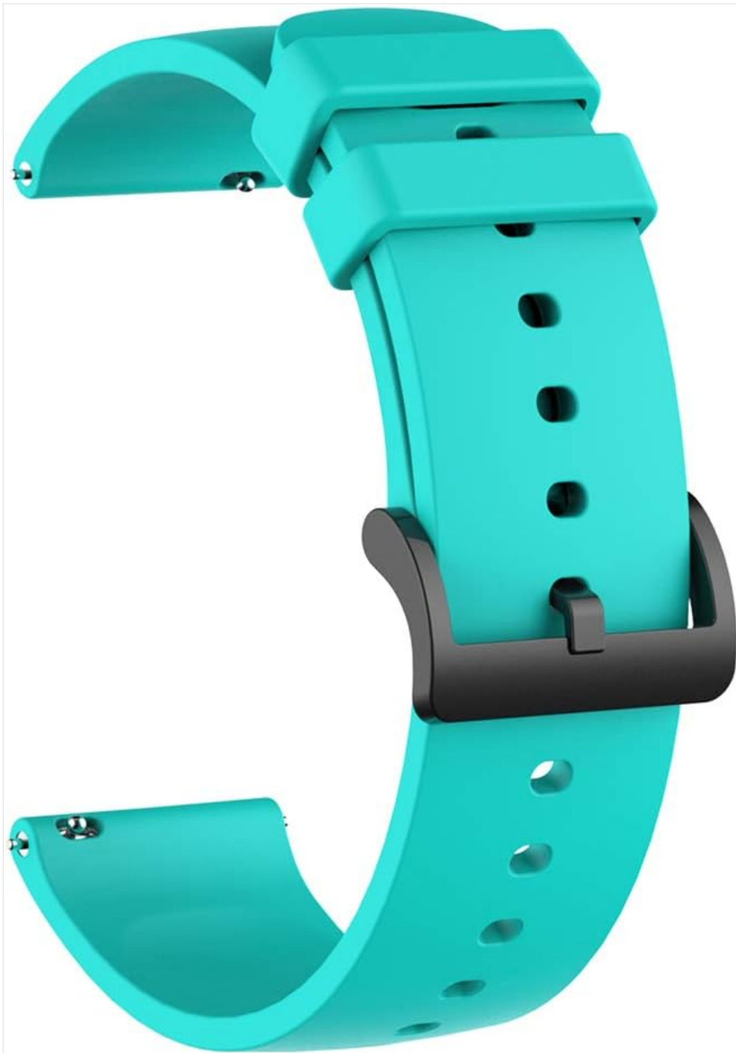
Image 2: A teal E ECSEM 20MM smartwatch band, showing the buckle and strap holes.