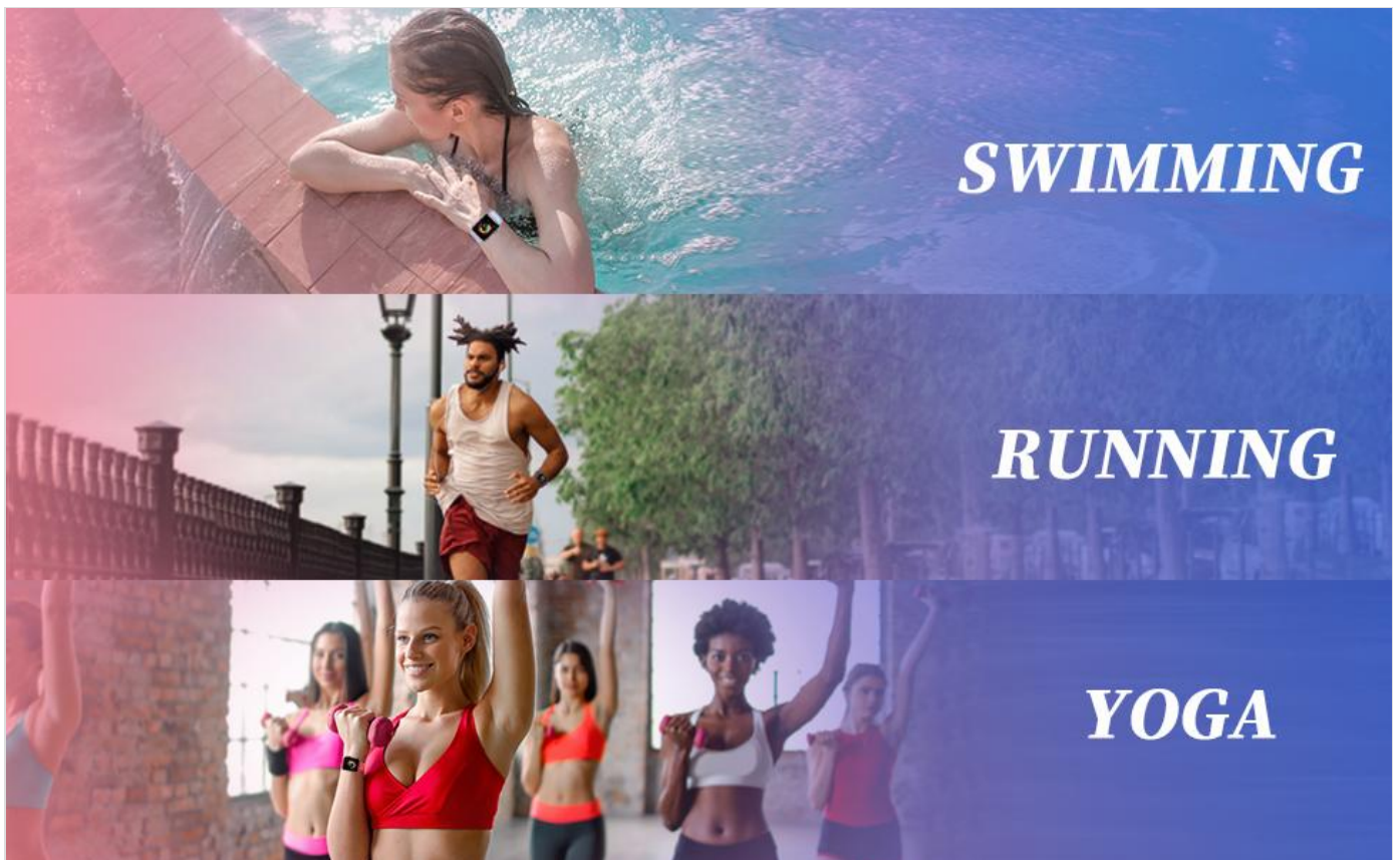
Image 4: Illustrative image showing individuals participating in swimming, running, and yoga, highlighting the suitability of the bands for active lifestyles.