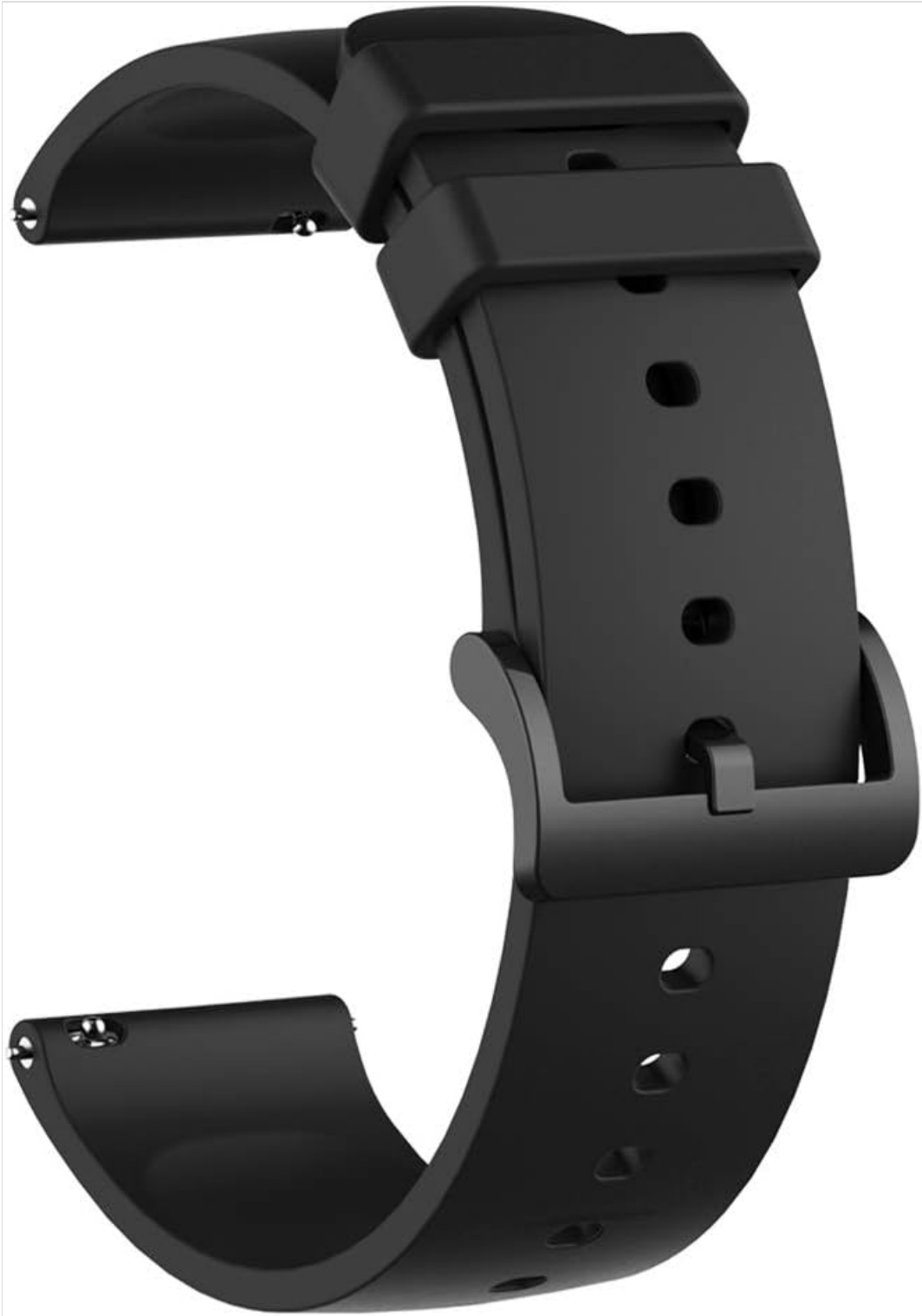
Image 1: A black E ECSEM 20MM smartwatch band, illustrating the quick-release pin mechanism at the ends.

4. Repeat: Follow the same steps for the second half of the band.