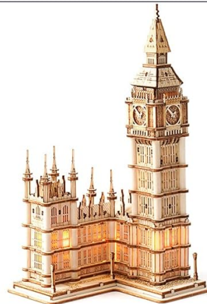
Build your own craft kit