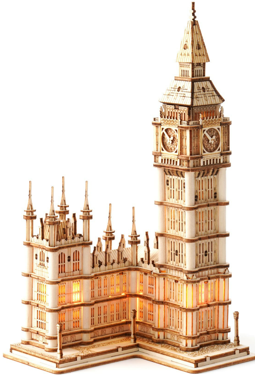
Figure 1: The completed Rowood Big Ben 3D Wooden Puzzle Model Kit.