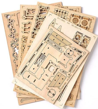
Pop out puzzle piece