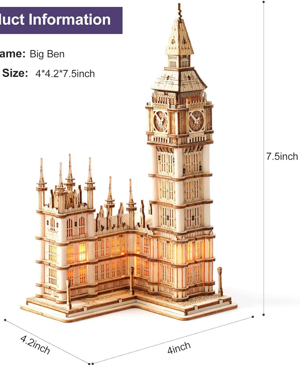
Figure 5: Visual representation of the assembled model's dimensions.