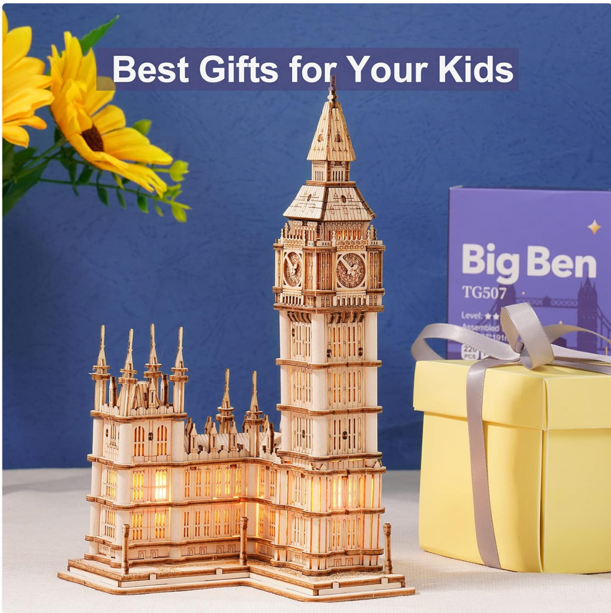
Figure 4: The Big Ben model illuminated by its integrated LED lights.