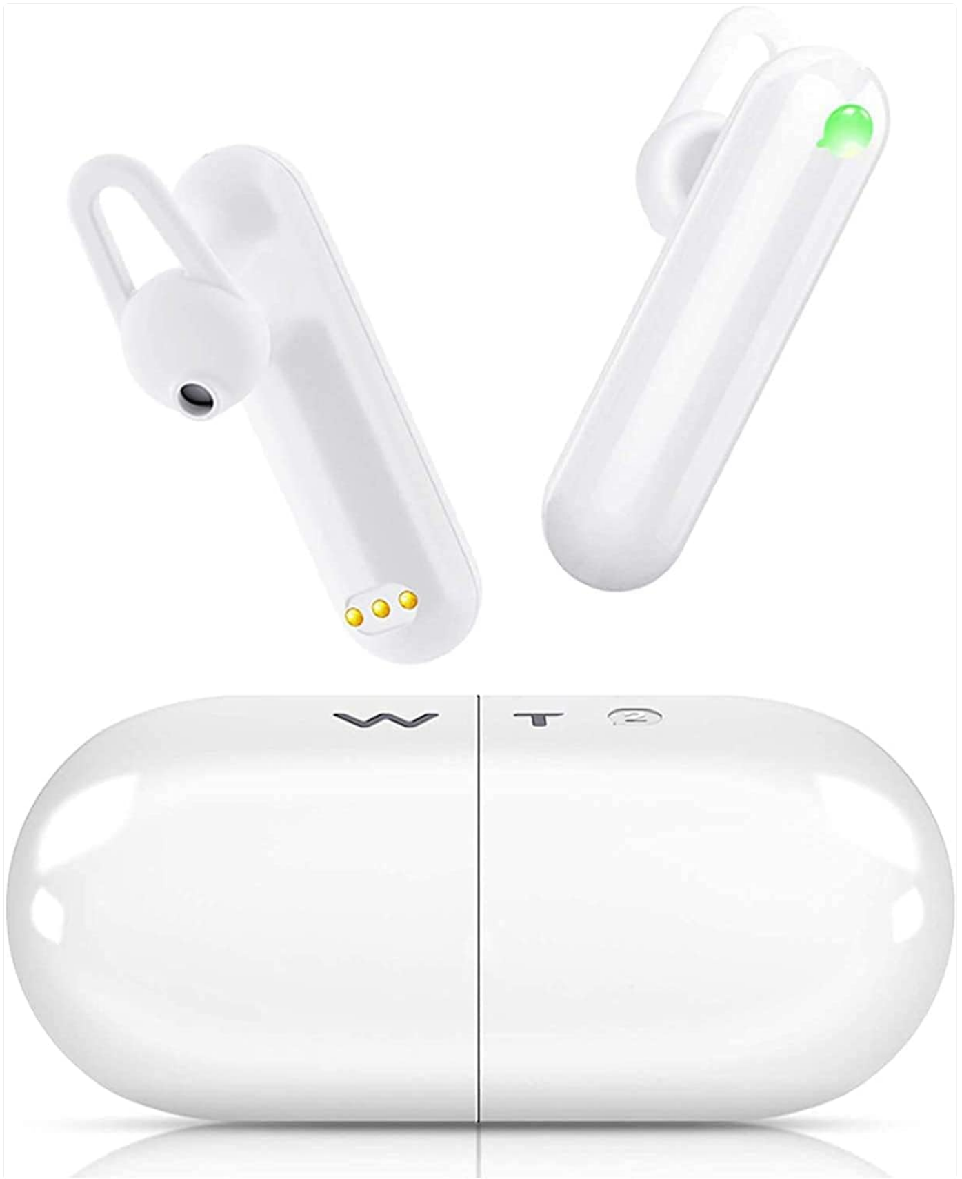
Figure 2.1: Timekettle WT2 Plus Translator Earbuds and Charging Case.