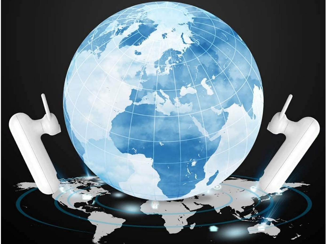
Figure 2.2: Global Language and Accent Coverage.

covering 85% of the entire population in the world