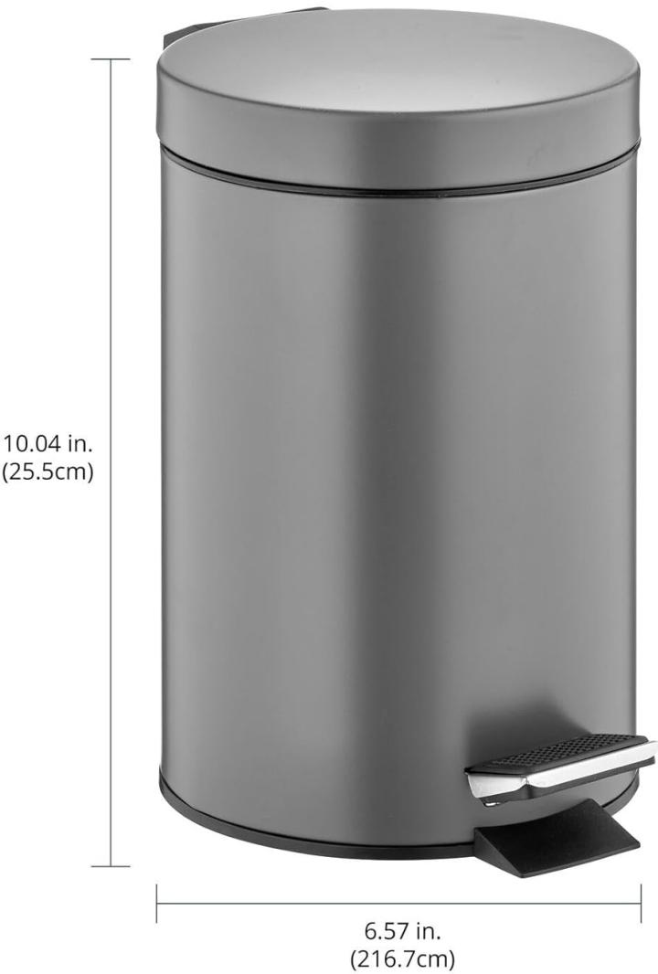
Image: The mDesign Pedal Bin with its dimensions clearly indicated for reference.