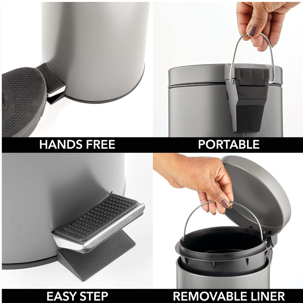
Image: A detailed view highlighting the hands-free pedal, portable handle, easy step mechanism, and removable liner of the mDesign Pedal Bin.

Your browser does not support the video tag.