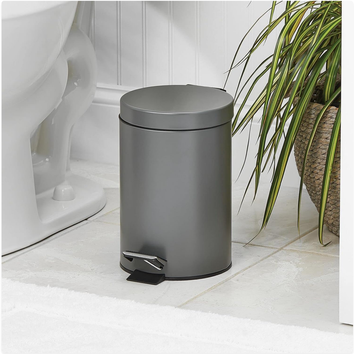
Image: The mDesign Pedal Bin positioned in a bathroom, illustrating its compact fit in small spaces.