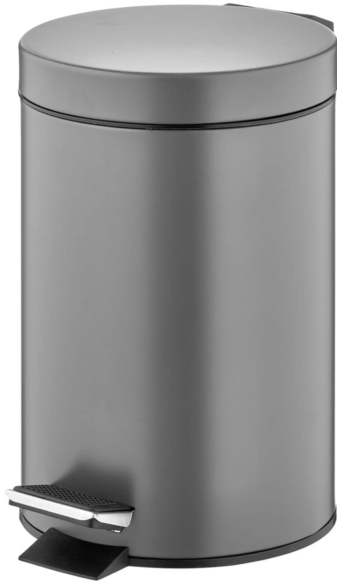
Image: The mDesign 3 Liter Graphite Gray Metal Pedal Bin, showcasing its sleek design and foot pedal mechanism.