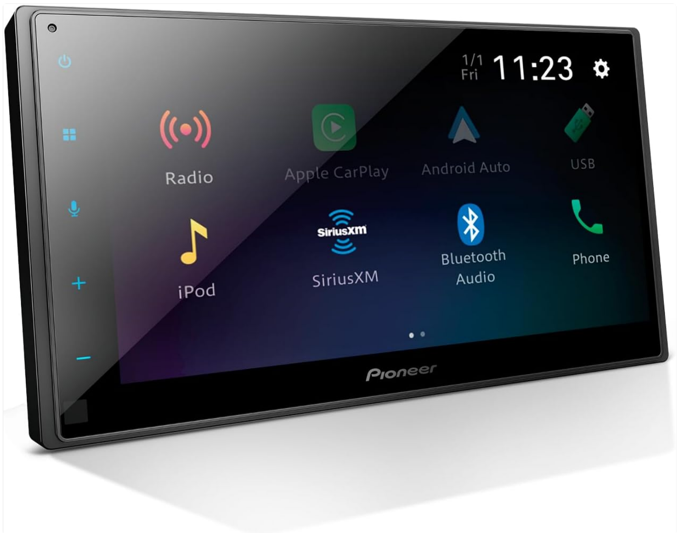
Figure 1: Pioneer DMH-1770NEX Digital Multimedia Receiver with its main interface showing various app icons.