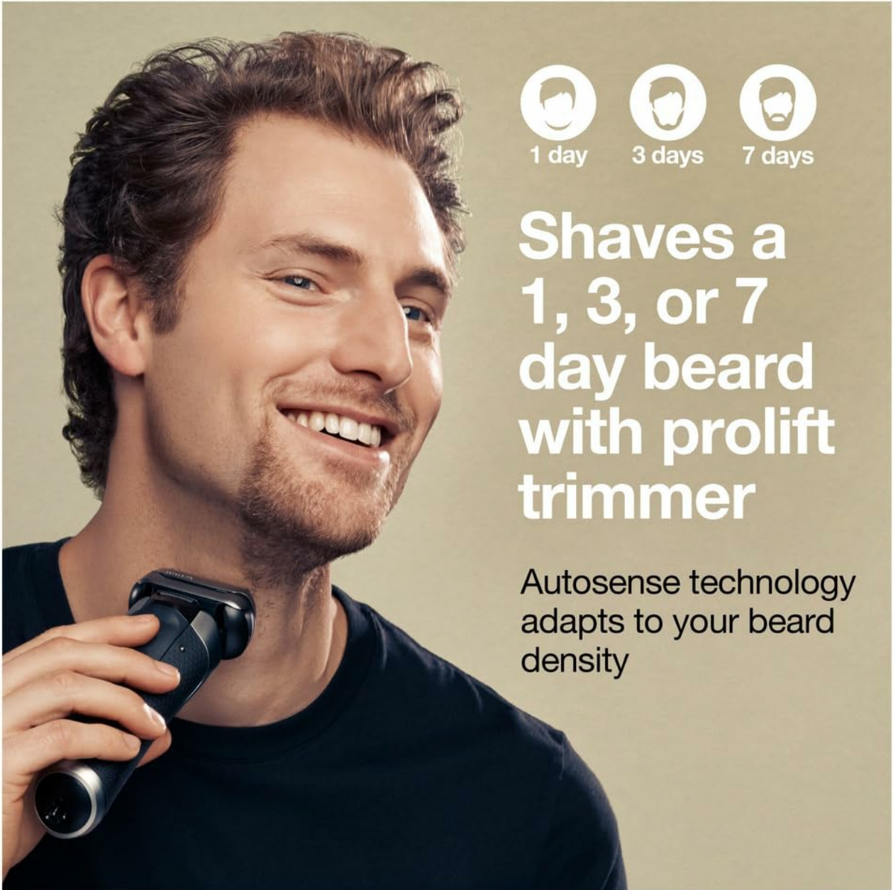
Figure 7: The shaver effectively handles 1, 3, or 7-day beards with AutoSense technology.