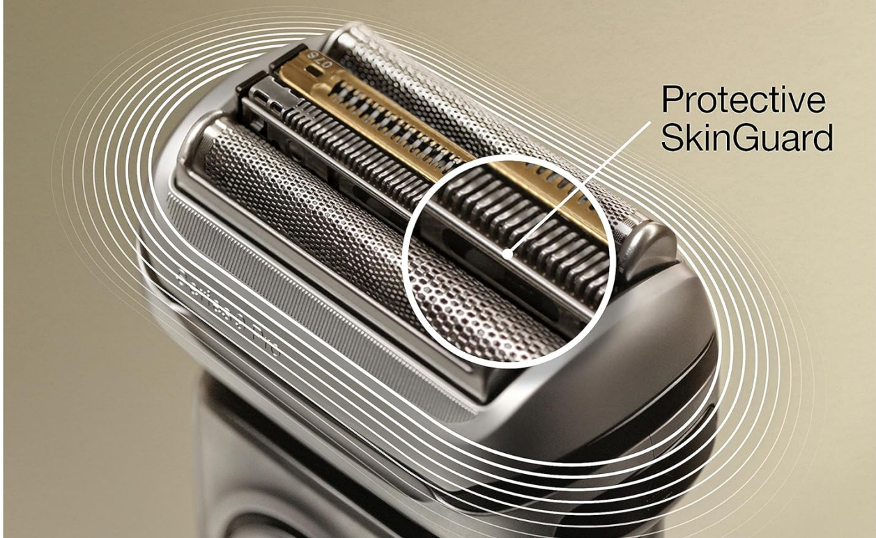
Figure 6: Sonic technology with 10,000 microvibrations per minute and Protective SkinGuard for gentle shaving.

Sonic technology with 10,000 microvibrations/minute