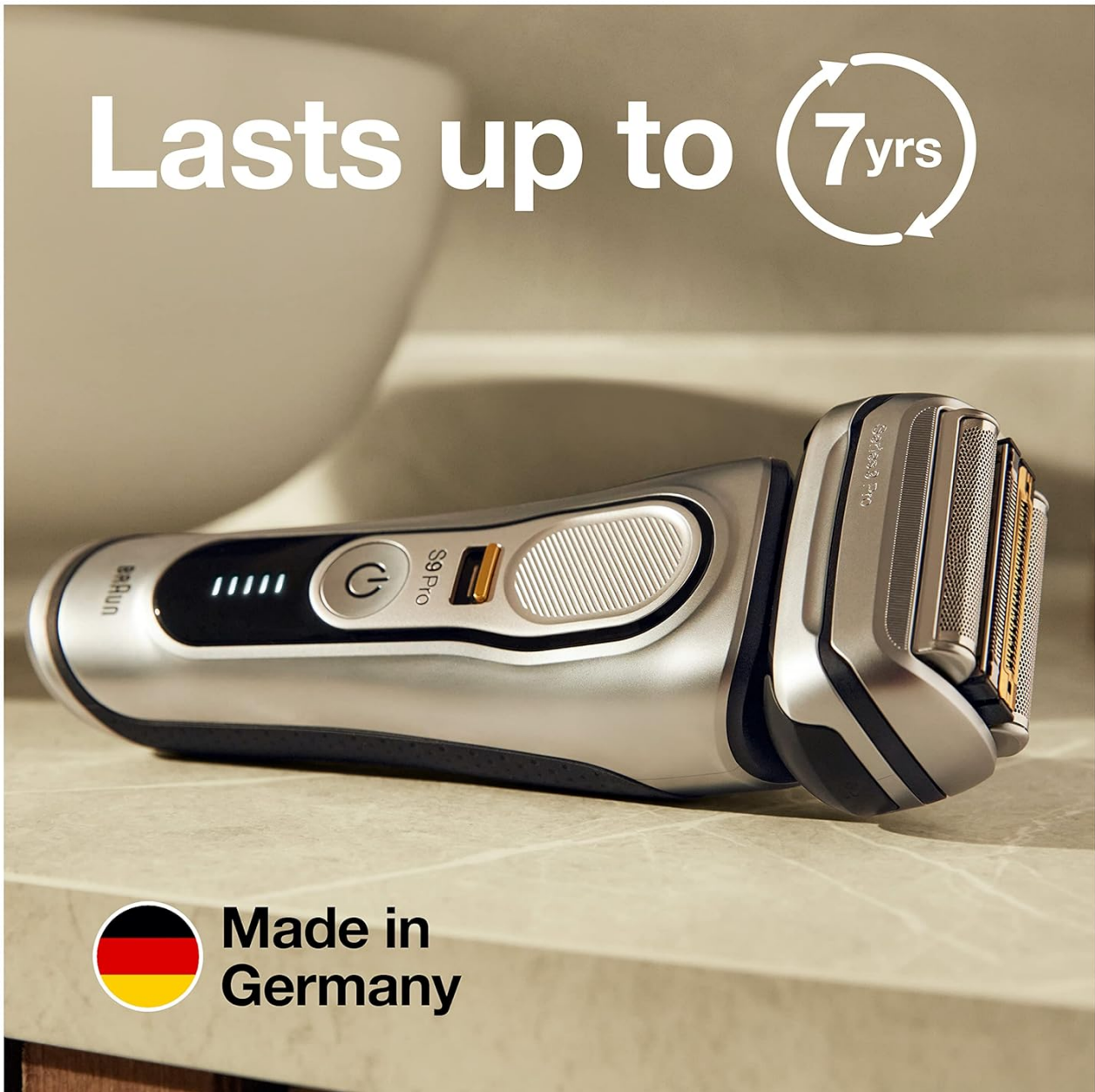
Figure 8: The shaver is designed to last up to 7 years and is Made in Germany.