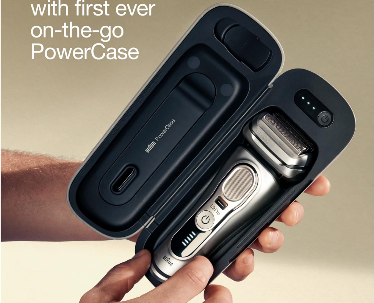
Figure 5: The PowerCase provides up to 6 weeks of shaving on a single charge.