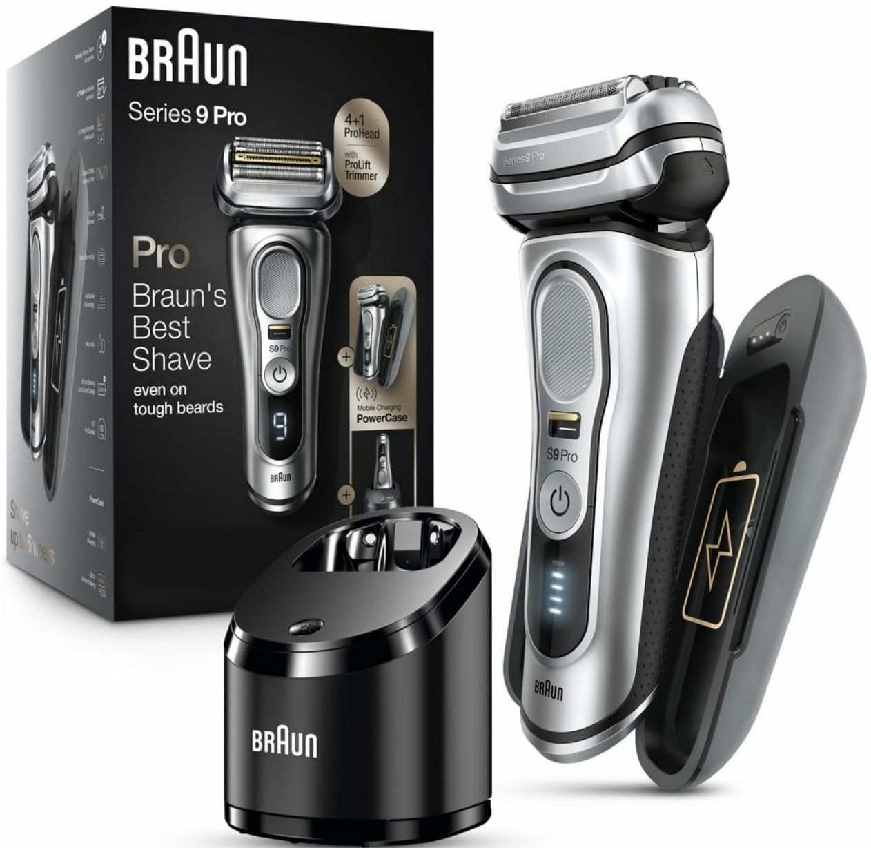
Figure 1: Braun Series 9 Pro 9477cc Electric Shaver, SmartCare Center, and PowerCase.