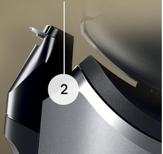
Figure 4: The shaver head for closeness and the pop-up ProTrimmer for precision.