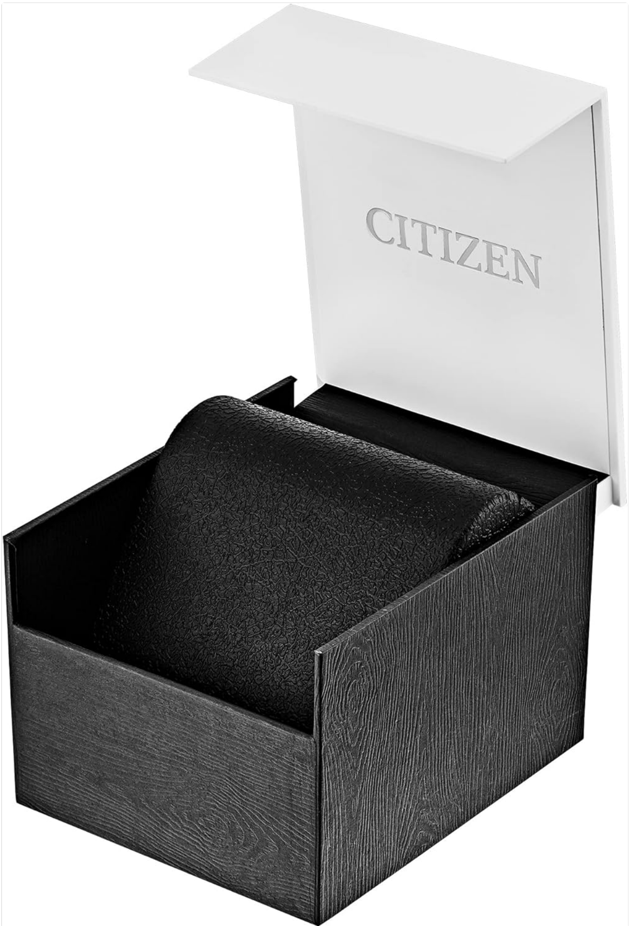
The Citizen Eco-Drive Weekender Chronograph Watch, Model AT2387-52E, presented in its open black and white box.