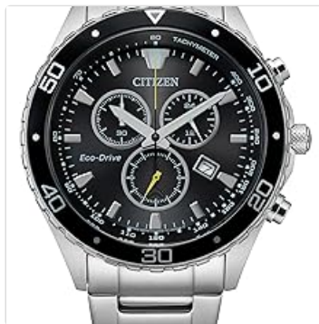
Close-up view of the chronograph sub-dials and date window on the Citizen Eco-Drive Weekender Chronograph Watch.