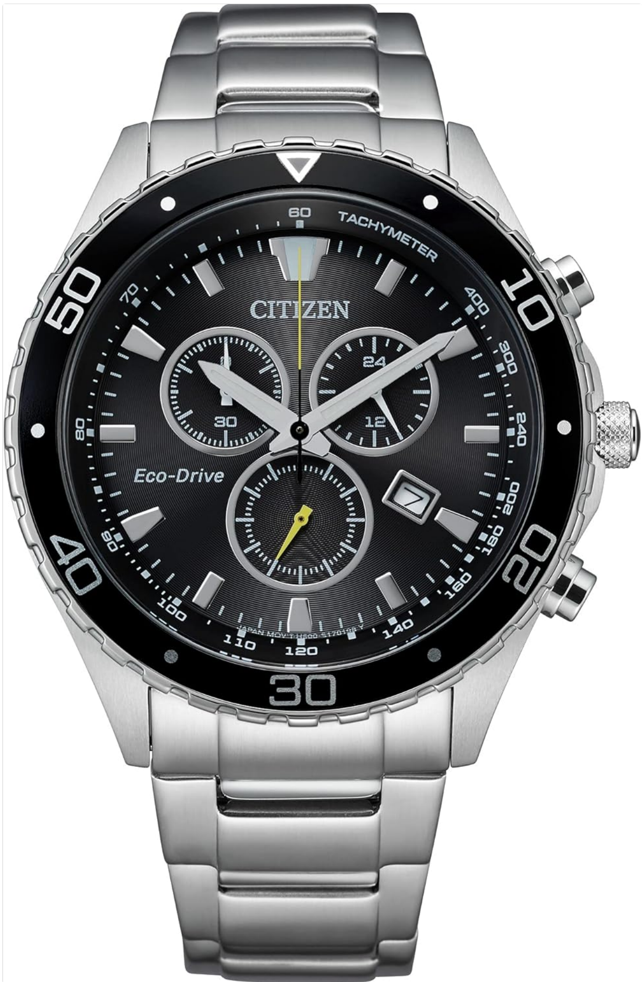
Front view of the Citizen Eco-Drive Weekender Chronograph Watch, Model AT2387-52E, showcasing the black dial, silver-tone stainless steel case and bracelet, and chronograph sub-dials.