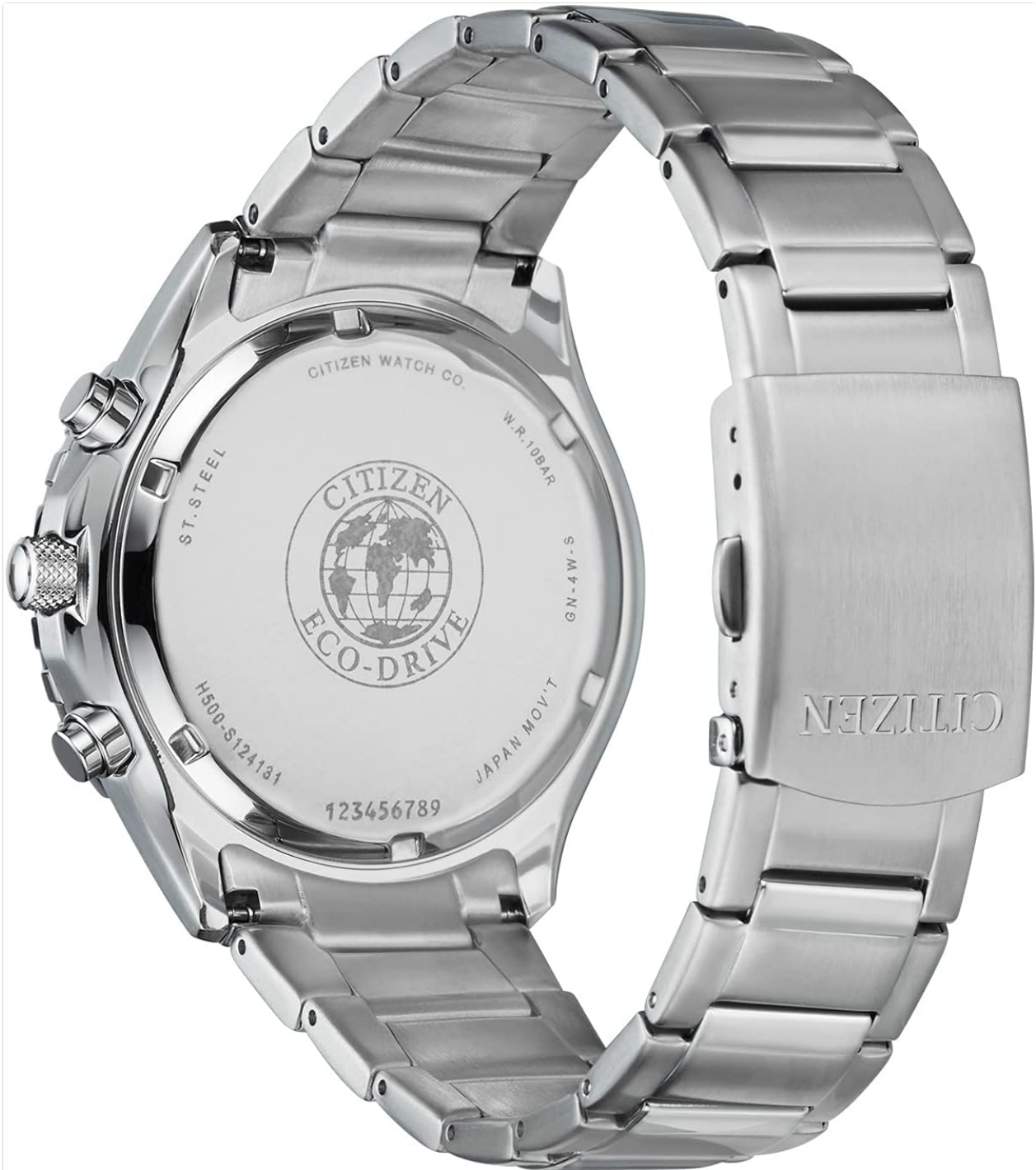
Rear view of the Citizen Eco-Drive Weekender Chronograph Watch, Model AT2387-52E, showing the case back with Citizen Eco-Drive branding and water resistance rating.

This watch is water resistant to 100 meters (10 BAR). This rating means it is suitable for showering, swimming, and snorkeling. It is not suitable for scuba diving or high-impact water sports. Always ensure the crown is pushed in completely before exposing the watch to water.