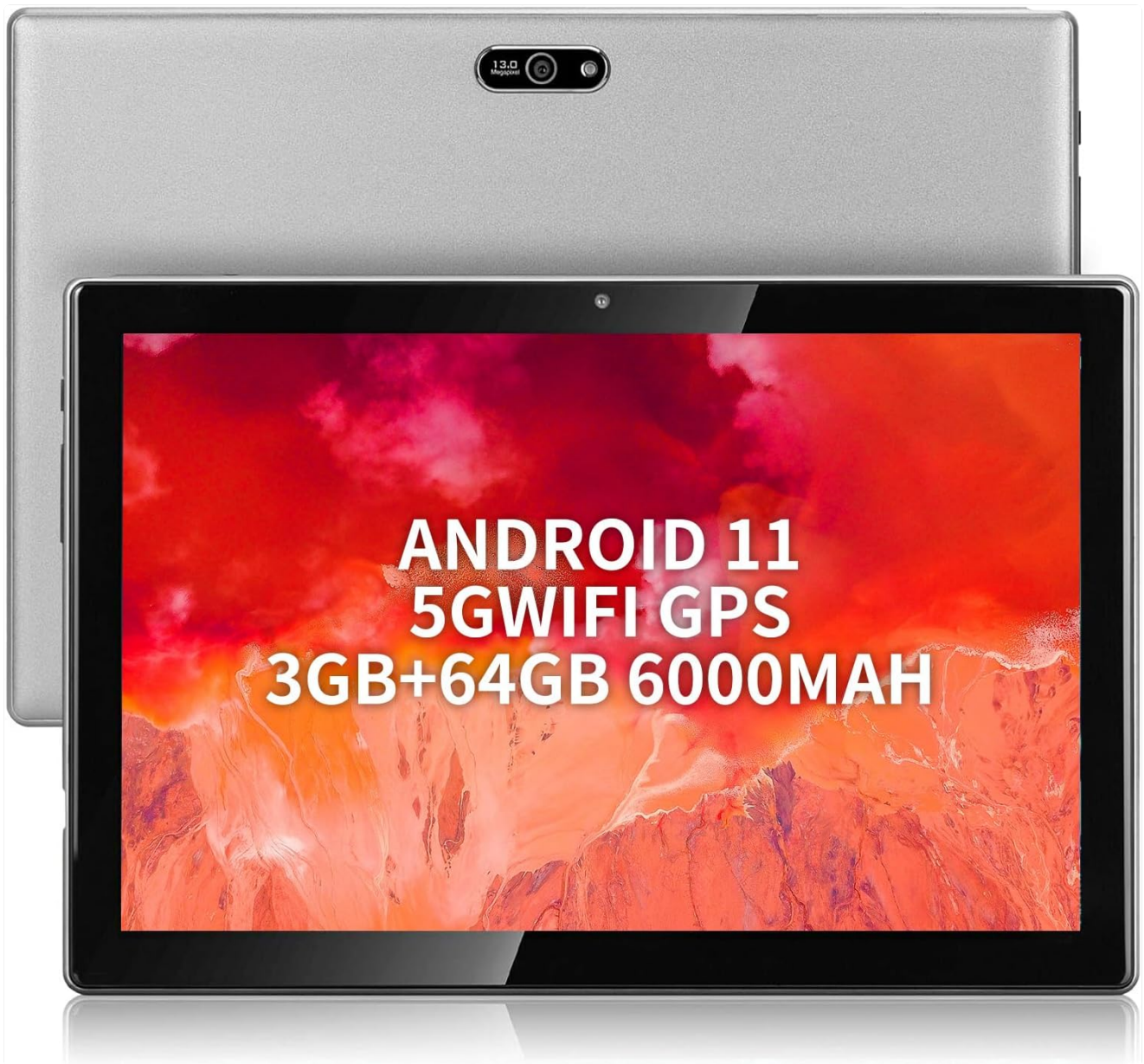
Image: The HAOVM 10-inch Android 11 Tablet, showcasing its sleek design and display.