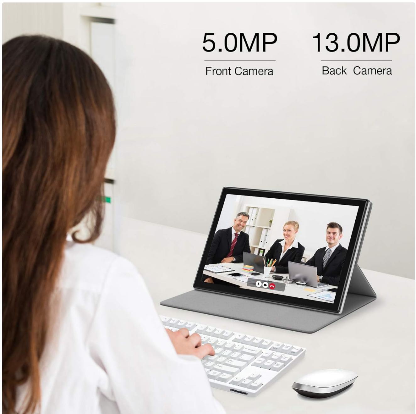
Image: Illustration showing the tablet's 5.0MP front camera and 13.0MP back camera capabilities.