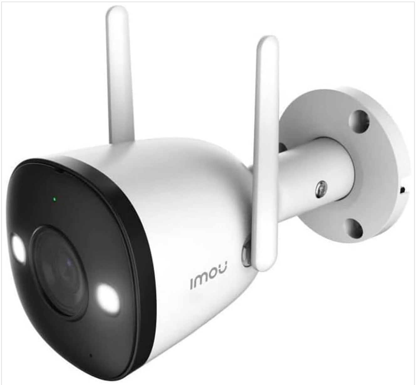
Figure 4.1: Front view of the Imou Bullet 2E camera, showing the lens, IR LEDs, status indicator, and Wi-Fi antennas.

Familiarize yourself with the components of your Imou Bullet 2E camera.