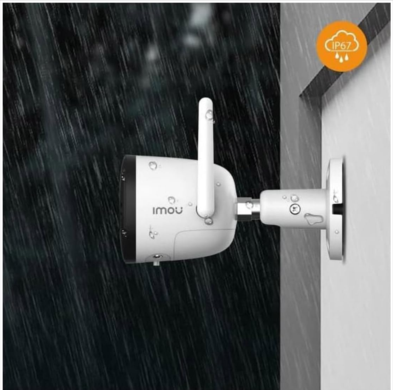
Figure 5.2: Imou Bullet 2E camera mounted on a wall, demonstrating its IP67 water resistance in rainy conditions.