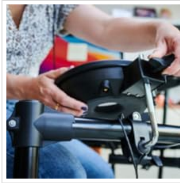
Figure 4.6: A smartphone displaying music playback, wirelessly connected to the TD-07 module via Bluetooth.