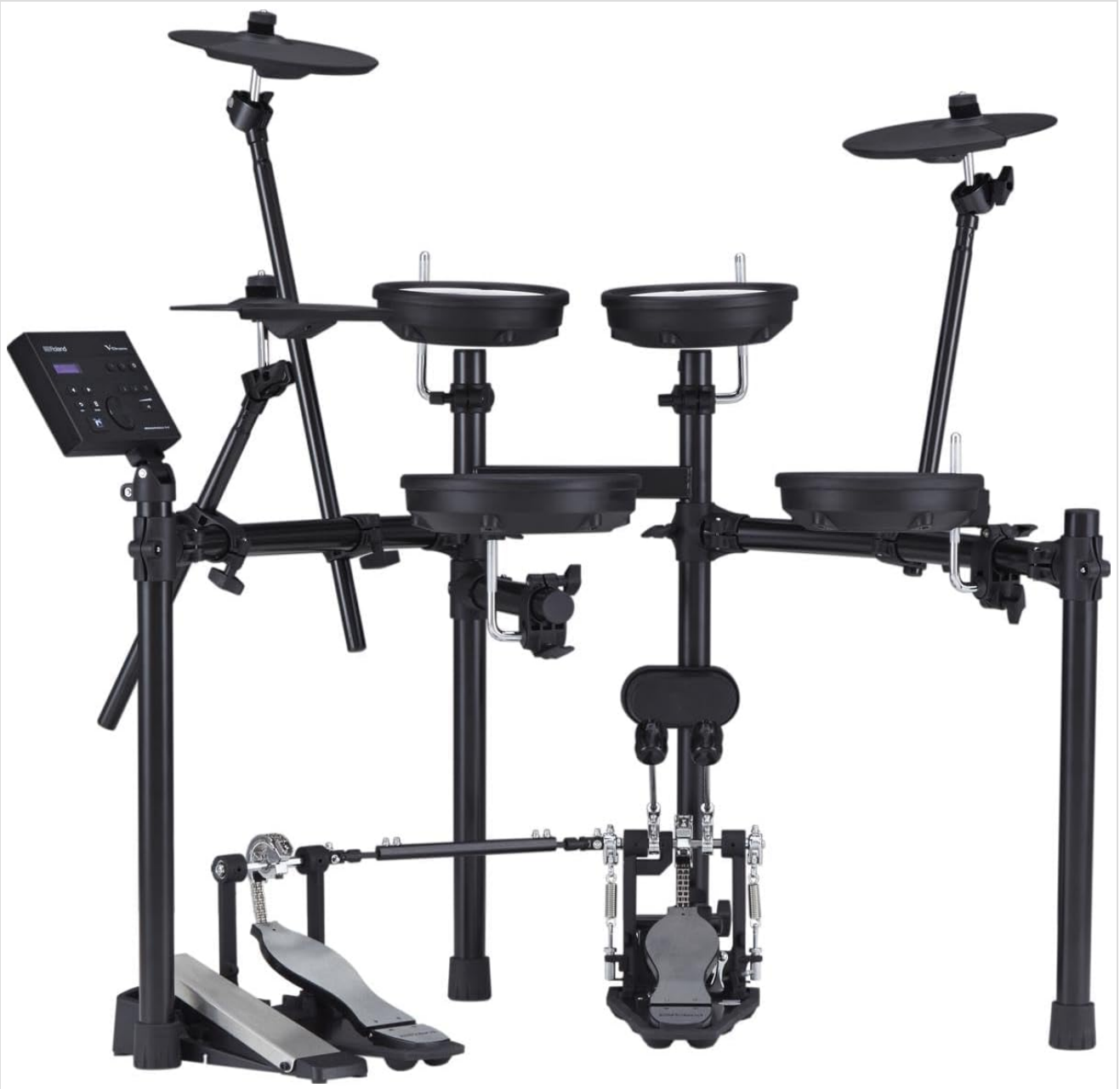
Figure 1.1: The Roland TD-07DMK Electronic V-Drums Kit, fully assembled. This image shows the compact design suitable for home environments.