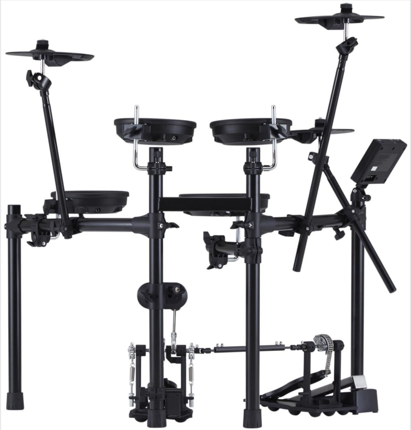
Figure 4.1: The TD-07 sound module, showing its controls and display.

The TD-07 module is the central control unit for your V-Drums kit. It features 25 preset kits, 25 user kits, and 143 instruments. You can customize sounds using V-Edit, EQ, ambience, and 30 multi-effects.