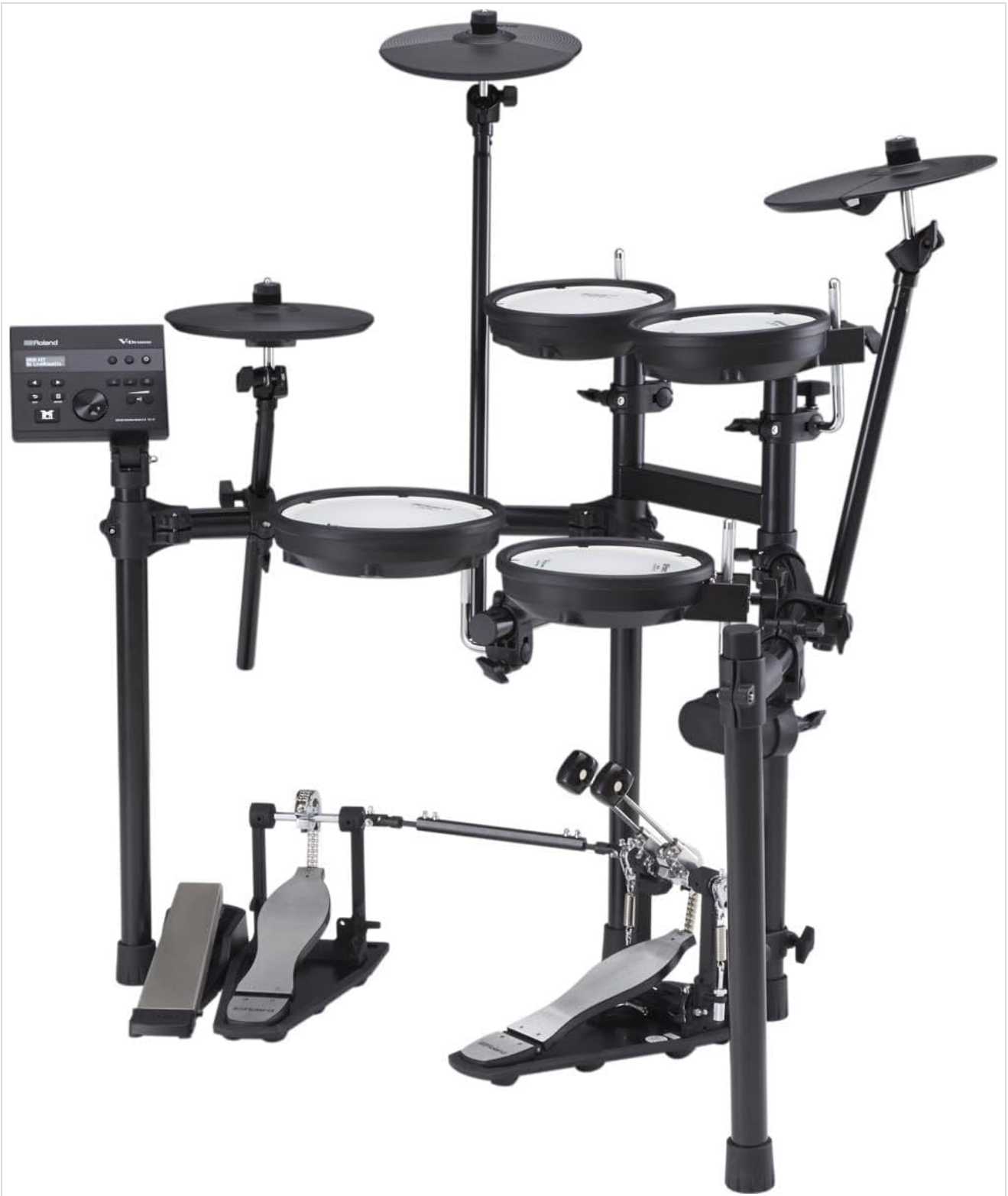
Figure 4.3: A close-up view of a V-Drums mesh head pad, highlighting its durable and quiet surface.

The TD-07DMK features Roland's renowned double-ply mesh heads for a realistic and quiet playing experience. The PDX-8 snare pad has independent head and rim zones, allowing for different sounds. The three PDX-6A tom pads are single-zone.