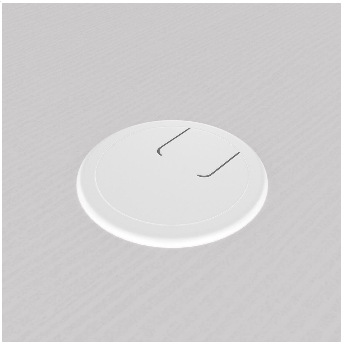
Image: A close-up view of the white wire management grommet integrated into the desktop, designed to help organize cables.