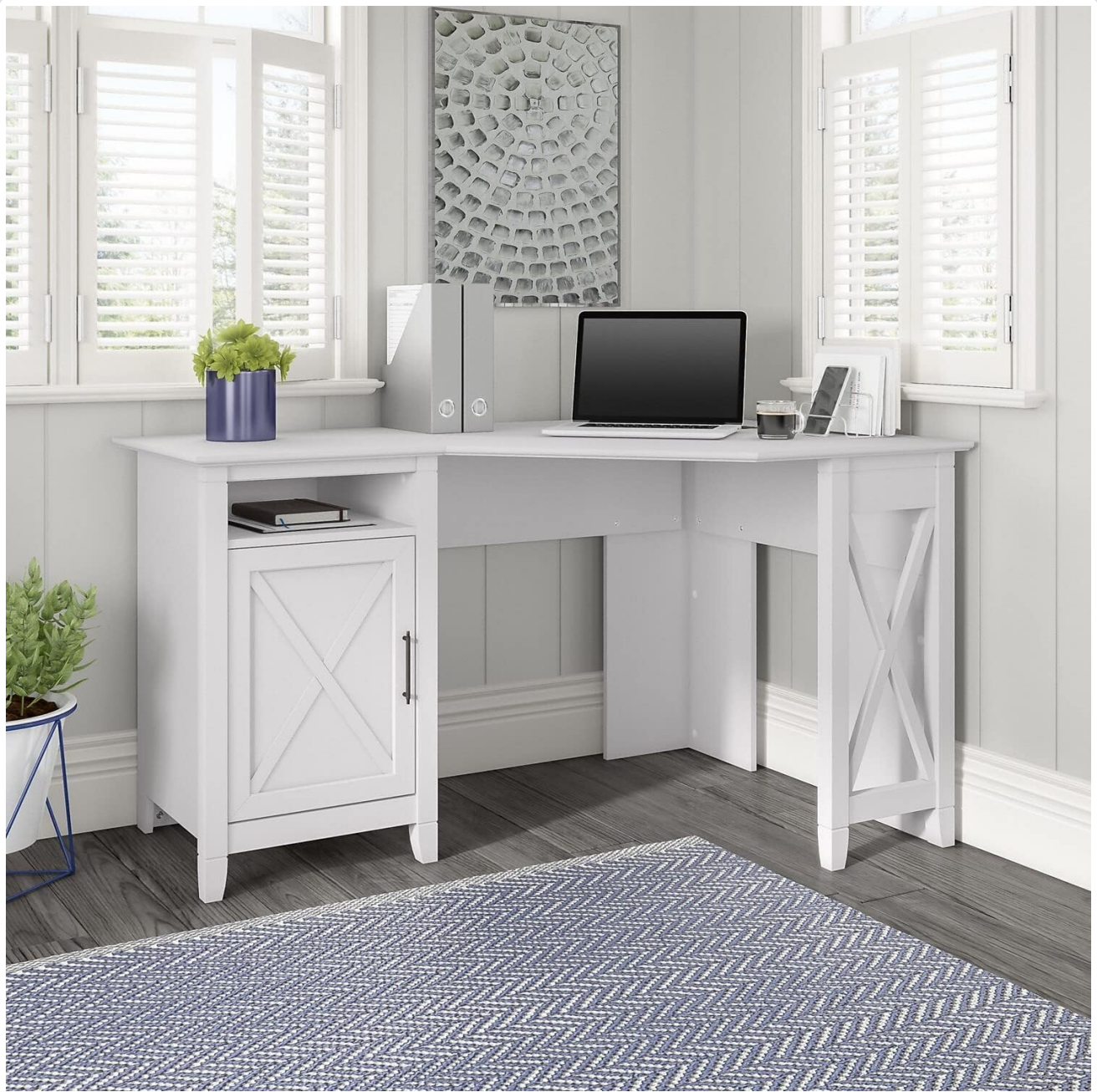
Image: The Bush Furniture Key West Corner Desk placed in a bright room, demonstrating its compact footprint and how it fits into a corner space, with a laptop and office supplies on top.