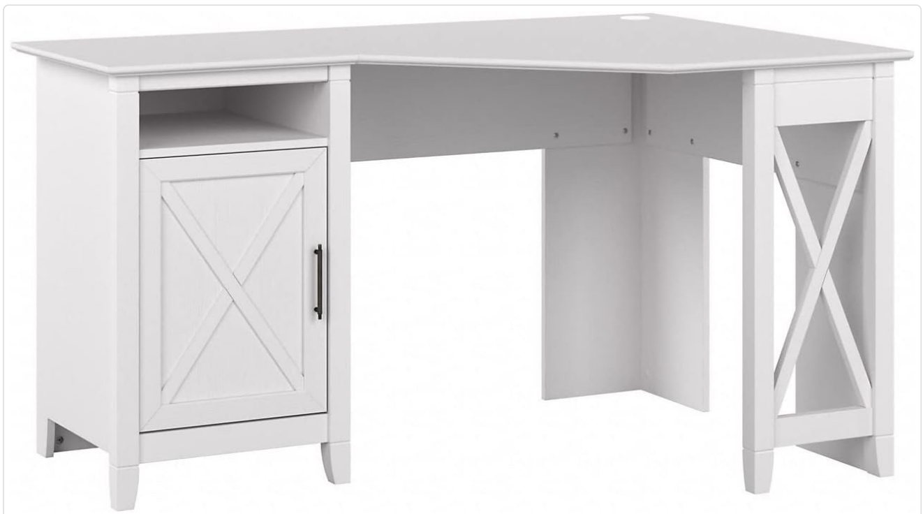
Image: Front view of the Bush Furniture Key West Corner Desk in Pure White Oak, showcasing its L-shape and integrated storage cabinet.

The Bush Furniture Key West Collection Corner Desk is designed for small spaces, offering a functional workstation with integrated storage. This L-shaped desk features a Pure White Oak finish, aged bronze hardware, and a sturdy construction suitable for home office, bedroom, or study environments.