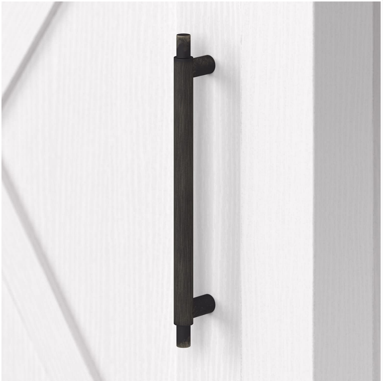
Image: A close-up view of the aged bronze hardware handle on the storage cabinet door, featuring an X-pattern accent.