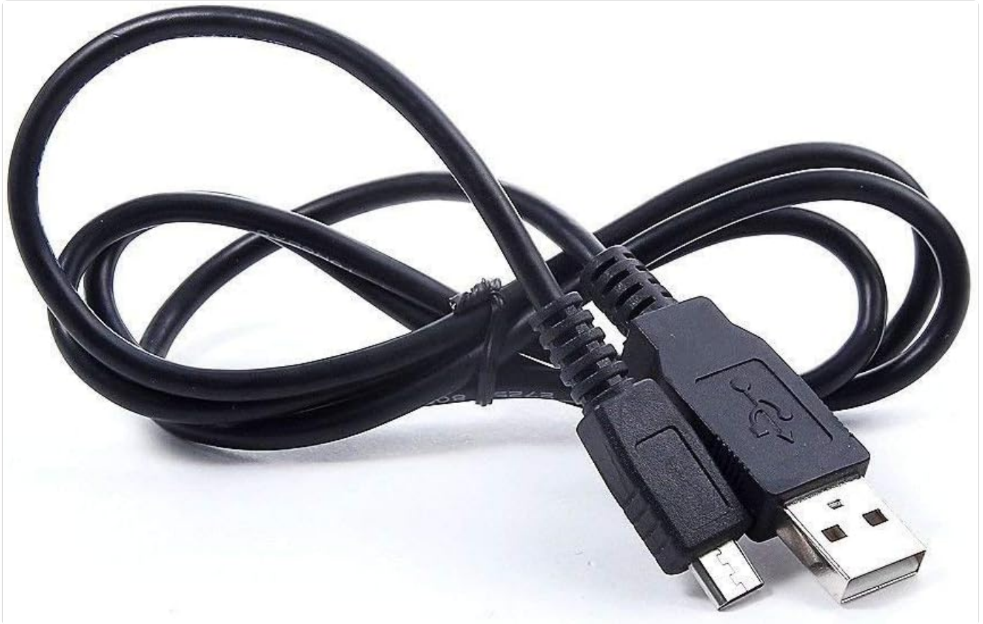
Image 2: Yustda Micro USB Charge Cable. This image shows the black Micro USB charge cable, featuring a standard USB-A connector on one end and a Micro USB connector on the other, coiled for storage.

The cable features a 2-in-1 function, allowing both data synchronization and device charging through a standard USB port, depending on your device's specifications. It is built with high-quality copper wire and a durable PVC insulation jacket for enhanced safety and longevity.