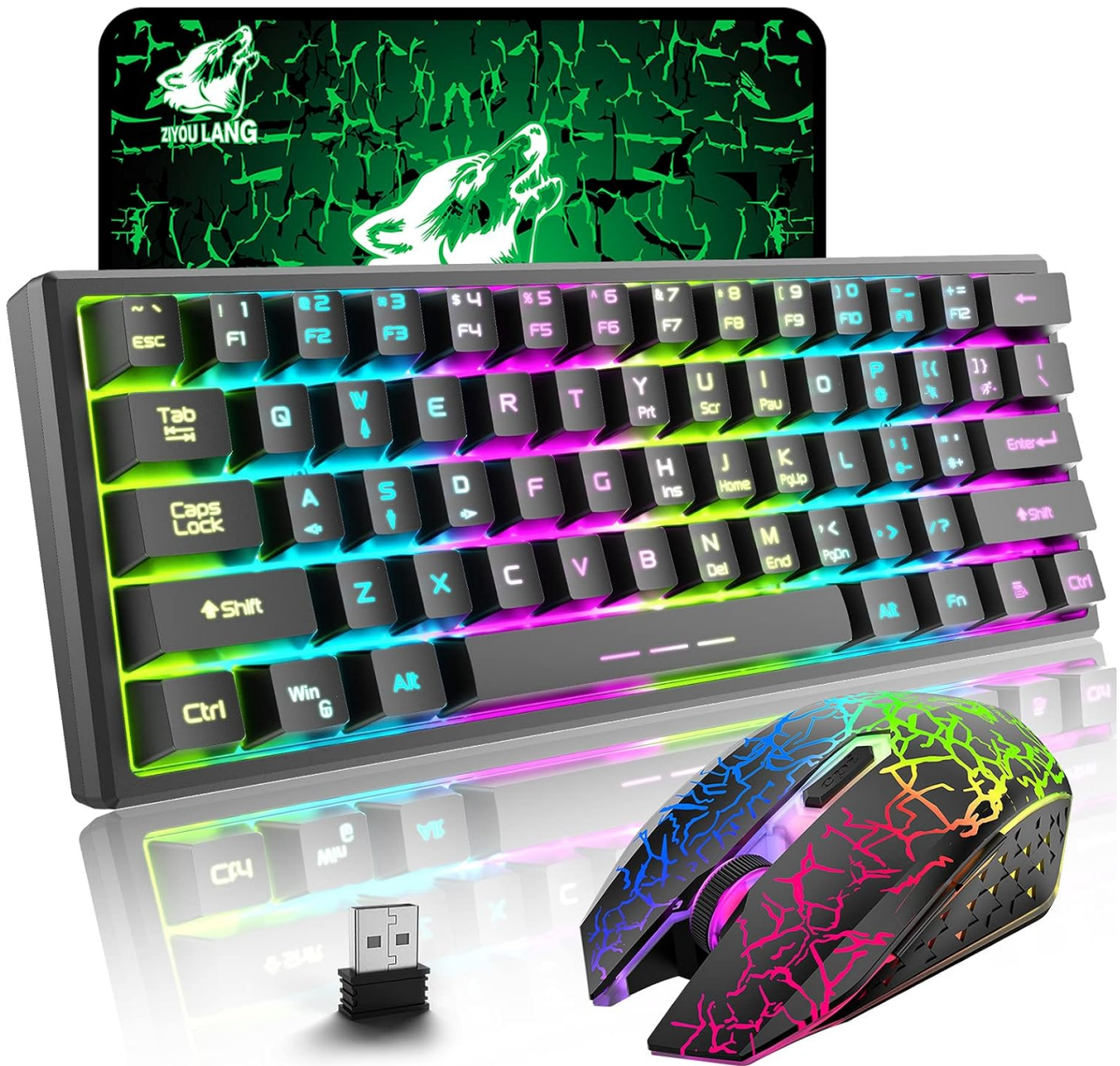
Image: The ZIYOU LANG T61 wireless gaming keyboard, mouse, and mouse pad, as packaged in the box.