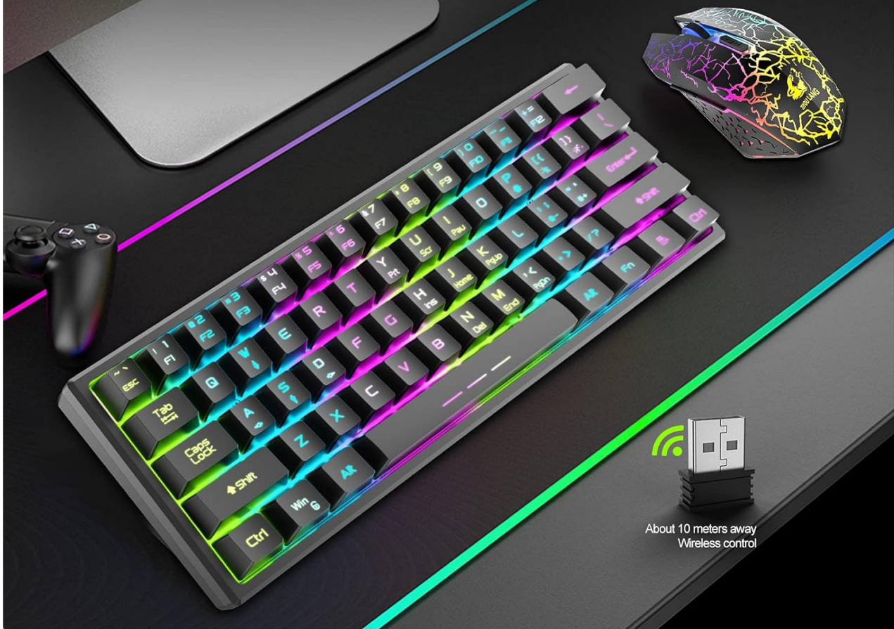
Image: Diagram showing the wireless connection setup with the USB receiver.

Plug&Play-USB receiver is placed in the bottom slot of the mouse