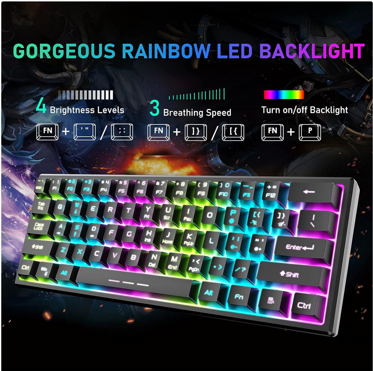
Image: The keyboard displaying its rainbow LED backlight and key combinations for controlling lighting and functions.