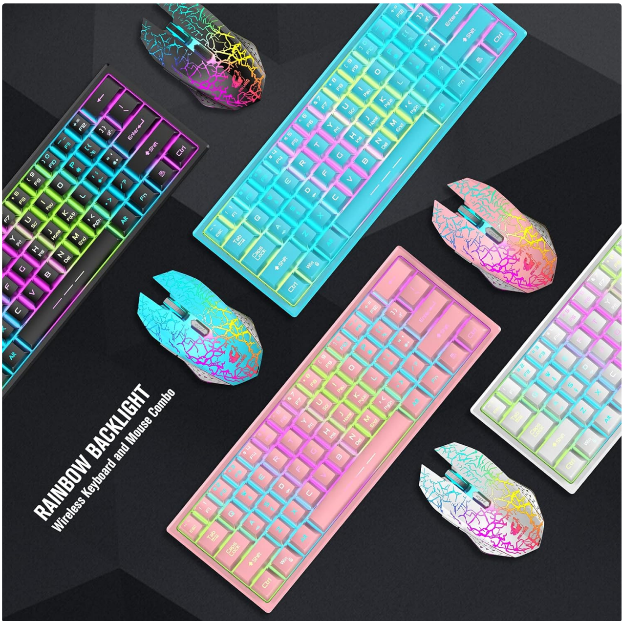
Image: The gaming mouse with its cracked pattern design, showing its 6 buttons and DPI adjustment.

Your browser does not support the video tag.