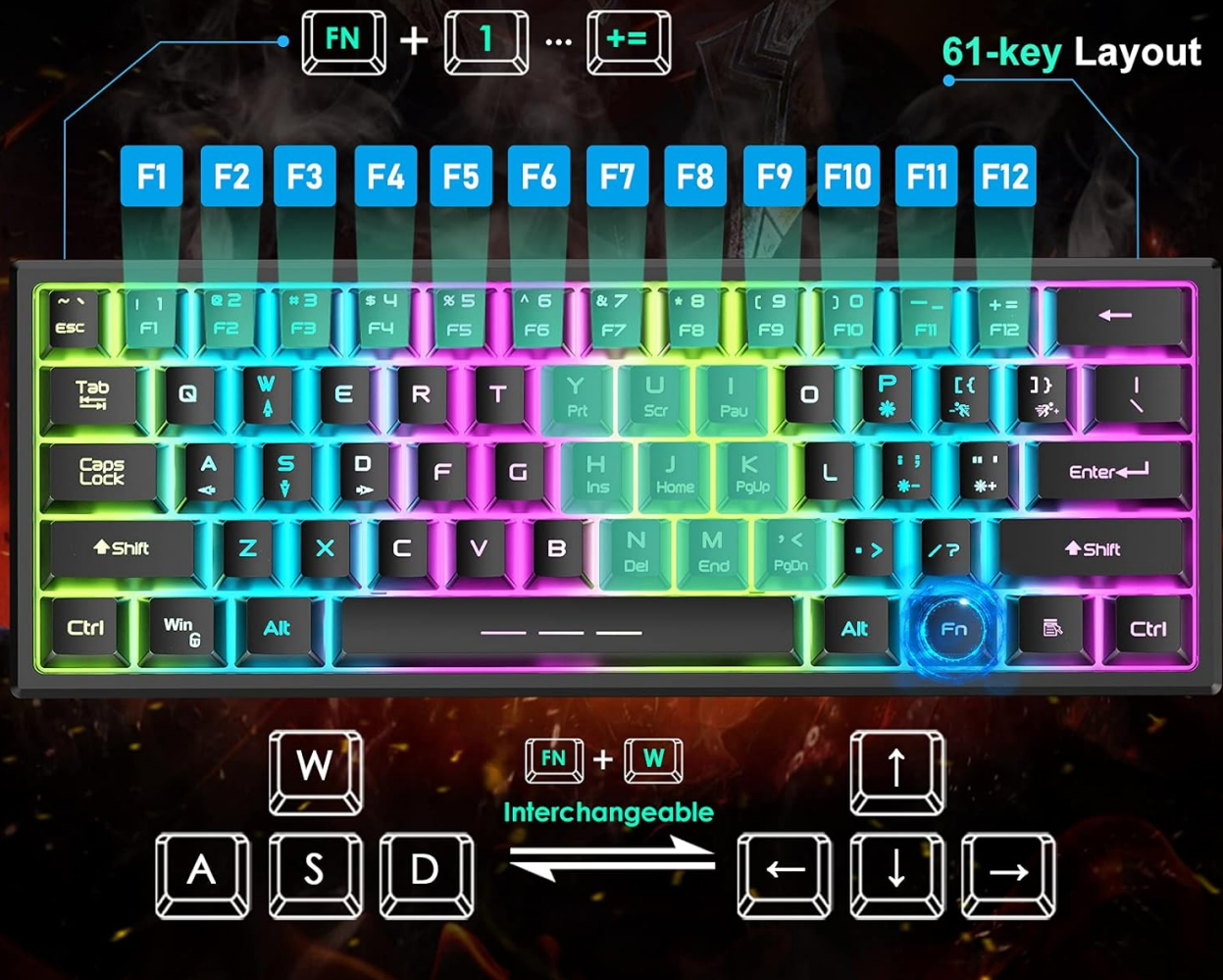
Image: A detailed view of the keyboard highlighting the FN key combinations for various shortcuts.