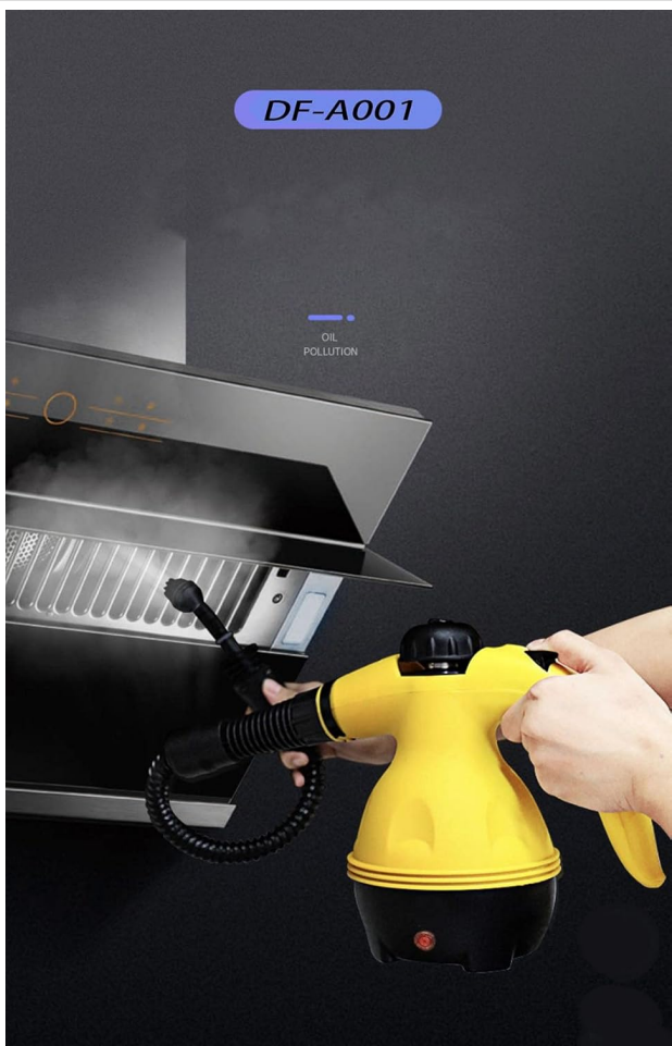
A user is shown operating the steam cleaner to clean a greasy range hood filter, demonstrating the direct application of steam for tough kitchen stains.