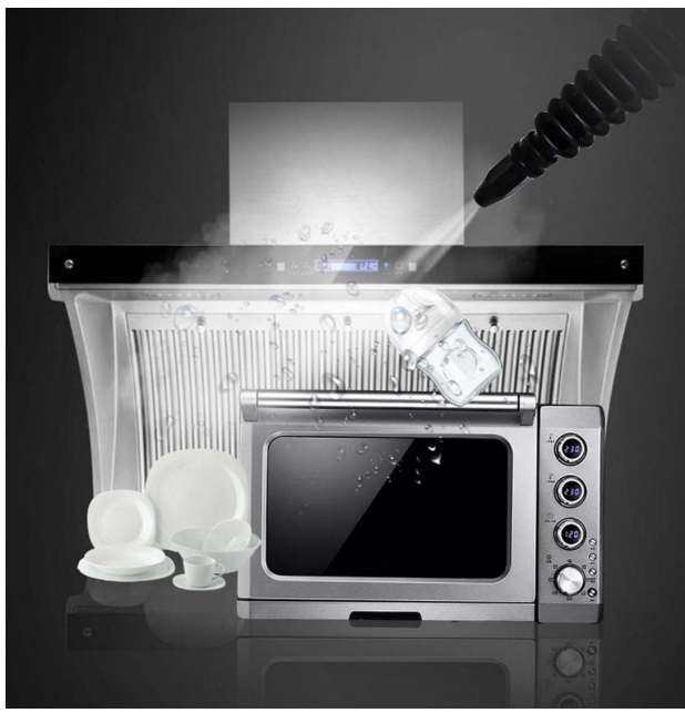
This image illustrates the steam cleaner being used to clean a microwave oven and the interior of a range hood, showing steam effectively removing grime.