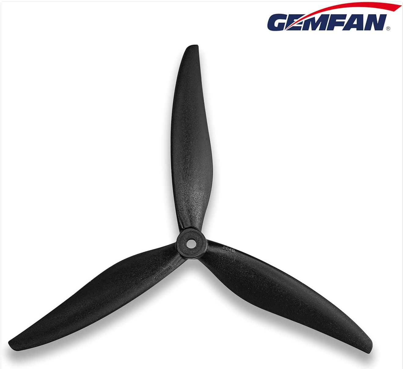
Image: A single Gemfan 8040 3-blade propeller, showcasing its design and central mounting hole. This image illustrates the typical appearance of one propeller from the set.