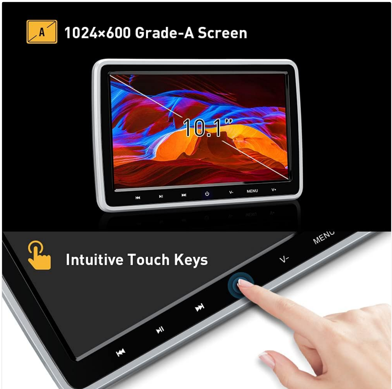
Figure 3: 10.1-inch TFT screen with intuitive touch keys.