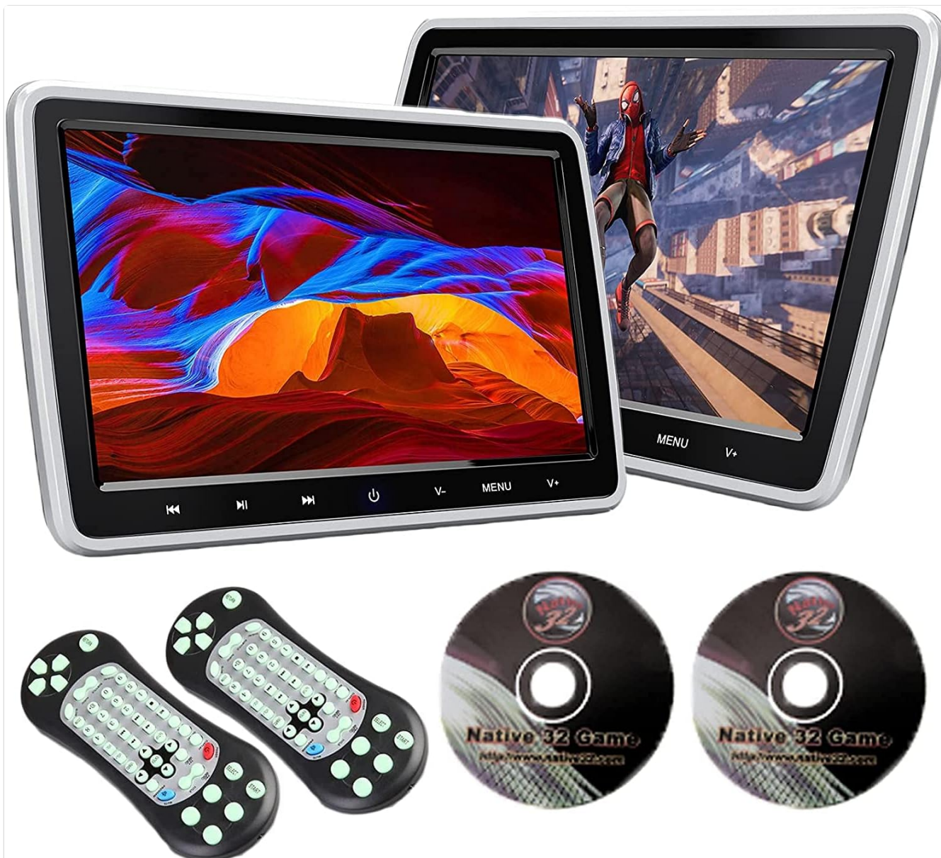
Figure 1: XTRONS HD111D Dual Car Headrest DVD Player with accessories.