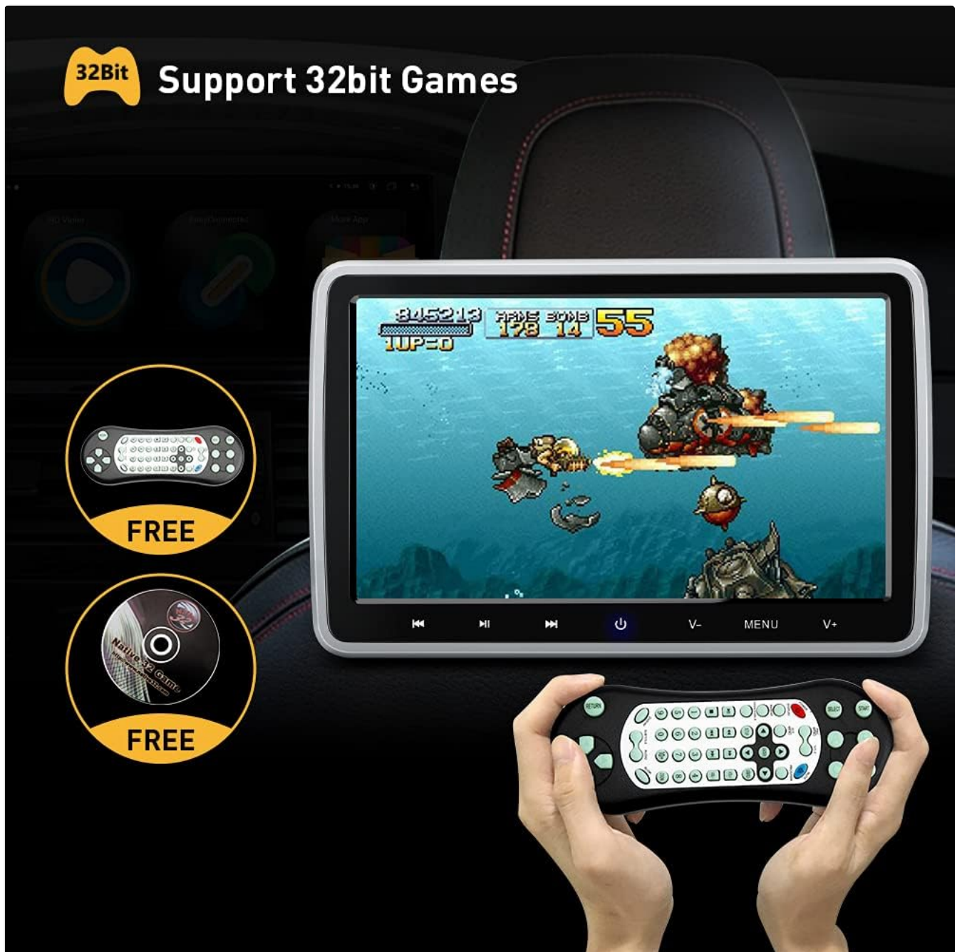
Figure 8: Enjoying 32-bit games.

Insert a game disc into the DVD slot. Use the provided remote controls to navigate the game menu and play the included 32-bit games.