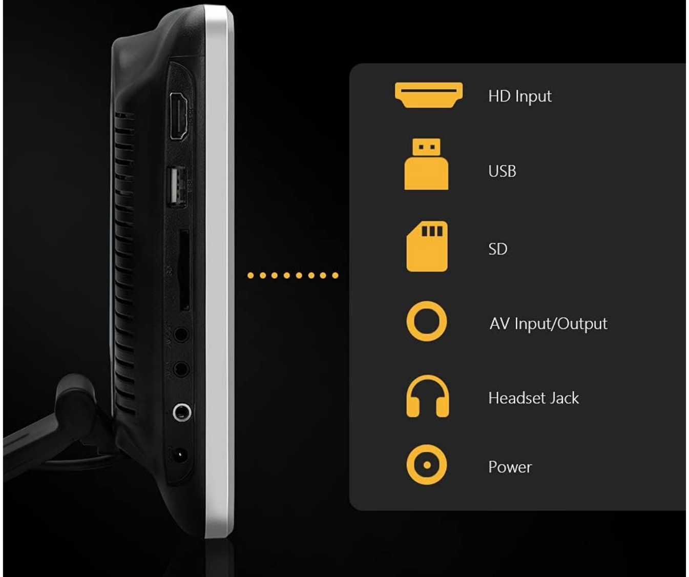
Figure 4: Side view showing connectivity ports.