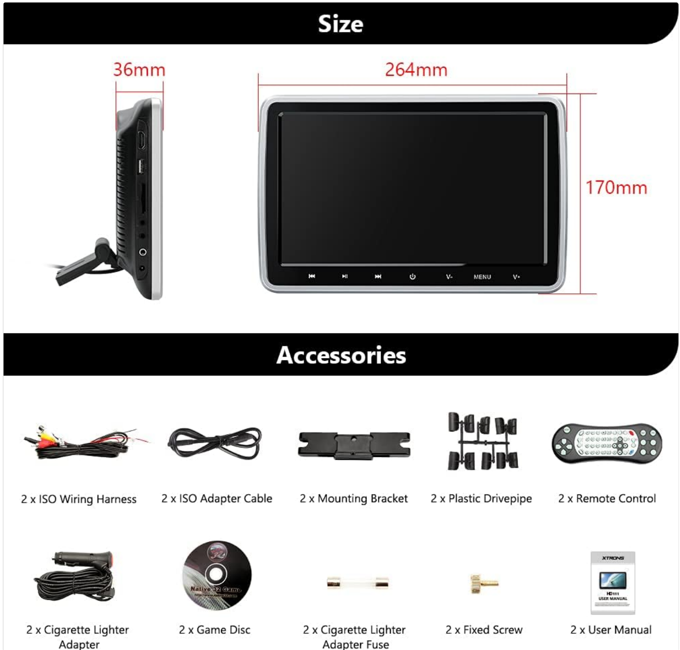
Figure 2: Product dimensions and included accessories.