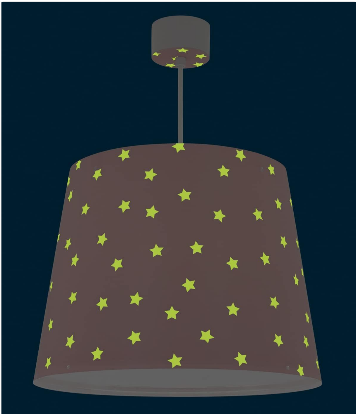
Figure 4: The lampshade displaying its glow-in-the-dark star effect in a darkened environment.