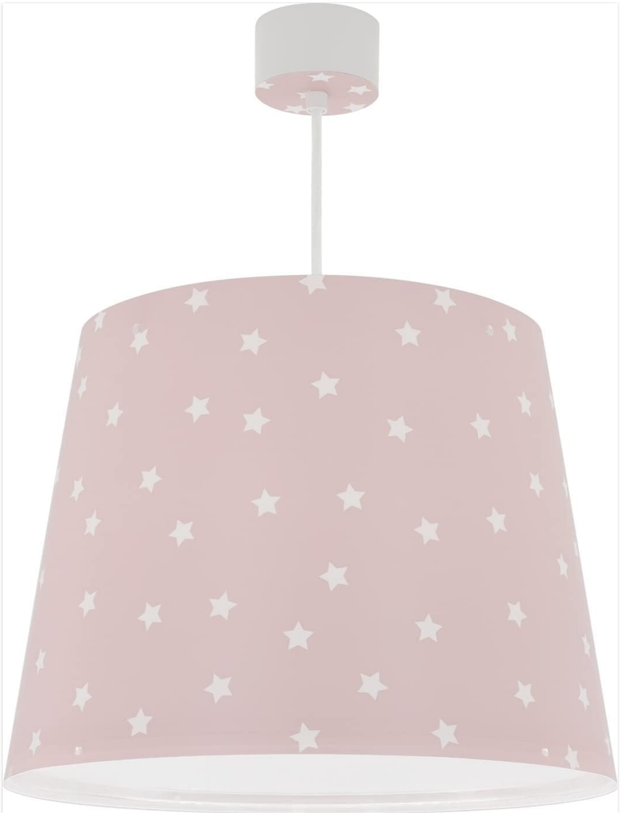
Figure 1: The Dalber Children's Room Pendant Lamp (Model 82212S) in its assembled state, showcasing its pink shade with white stars and ceiling mount.