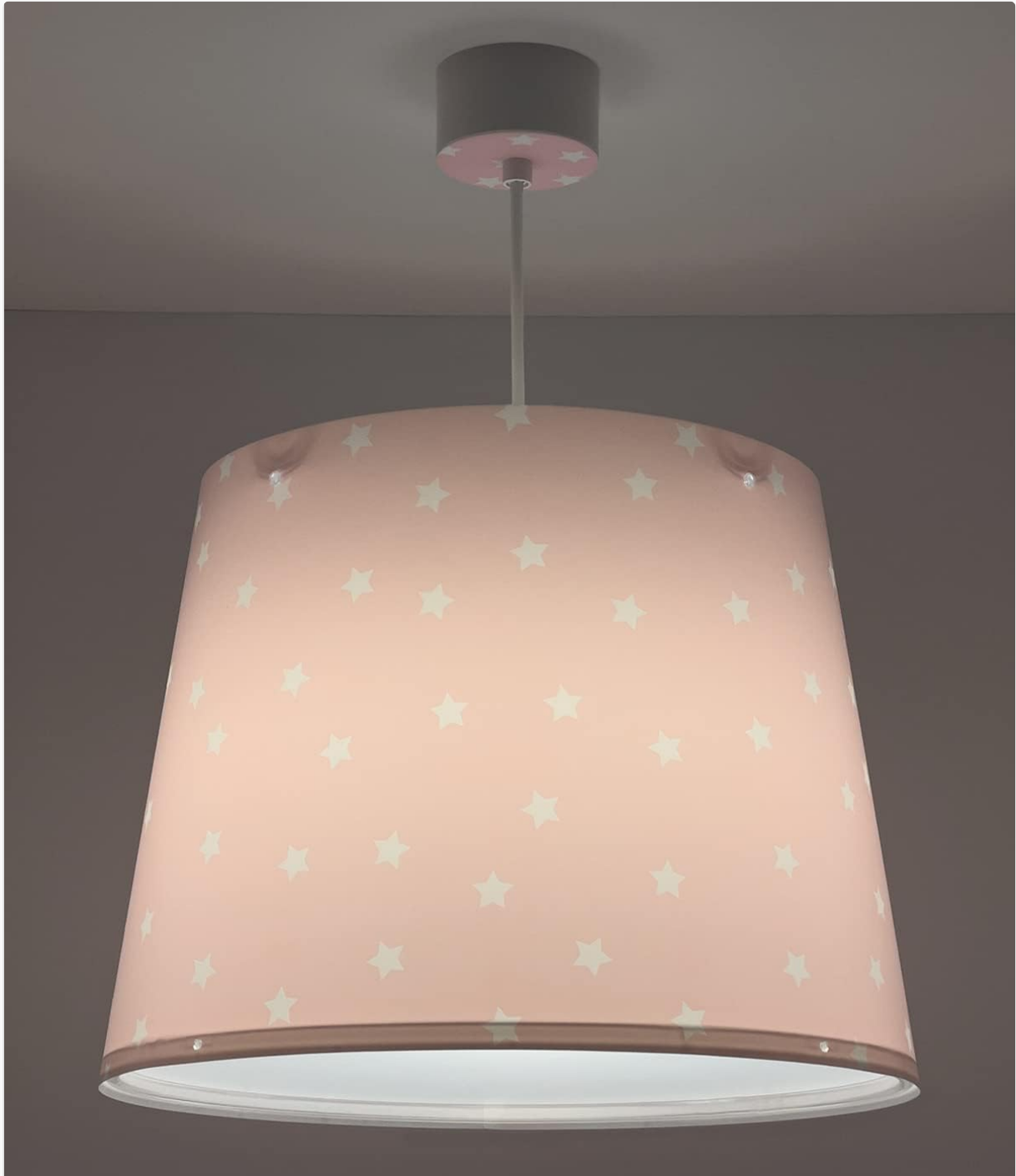
Figure 3: The Dalber lamp illuminated, showing the light distribution and the star pattern.

The lamp is operated via a standard wall switch connected to the lighting circuit. Flip the switch to the 'ON' position to illuminate the lamp and to the 'OFF' position to turn it off.