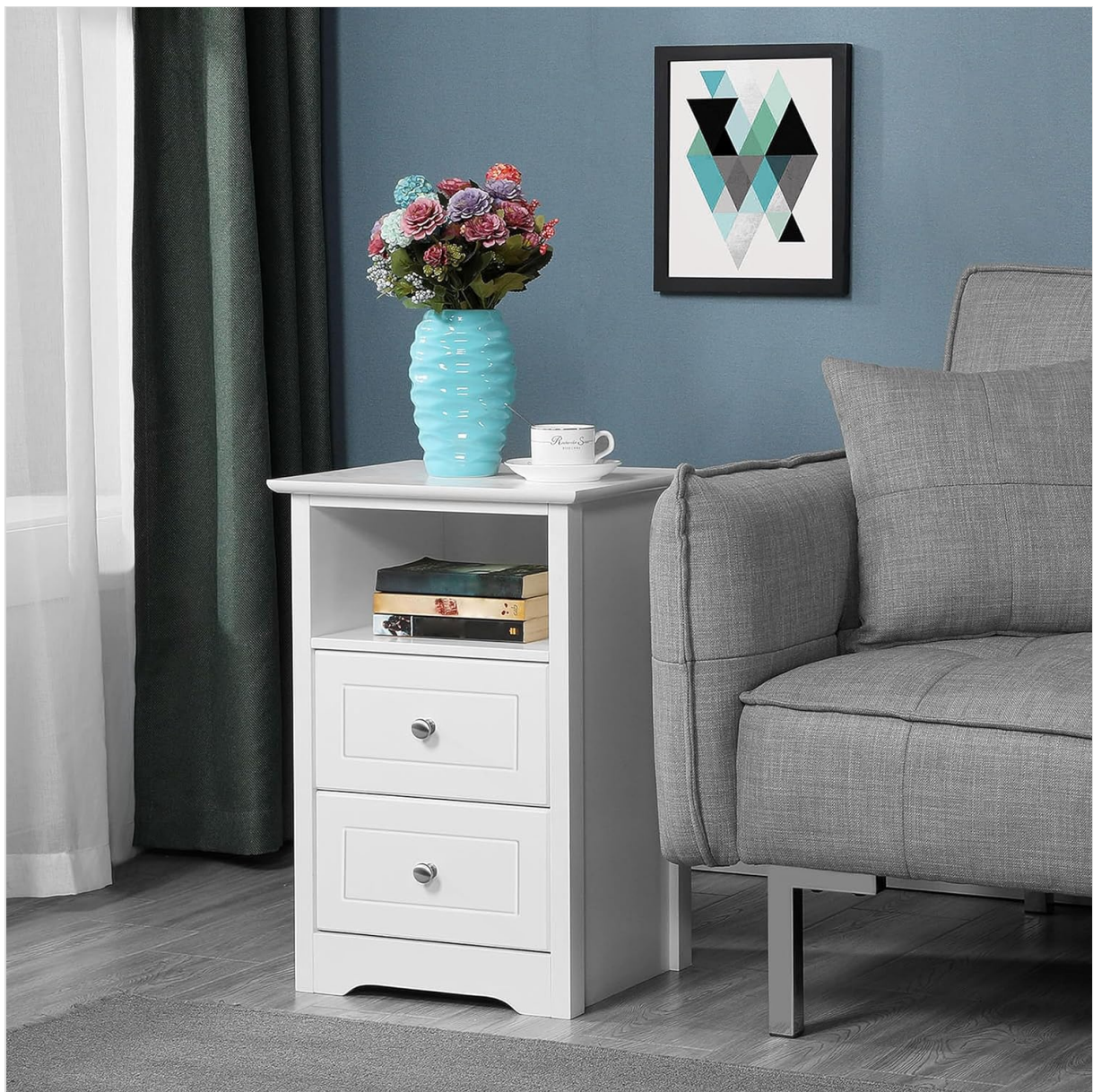
Figure 5: Bedside Cabinet in Living Room. This image illustrates the versatility of the cabinet, showing it used as a side table next to a sofa in a living room, holding a vase and books.