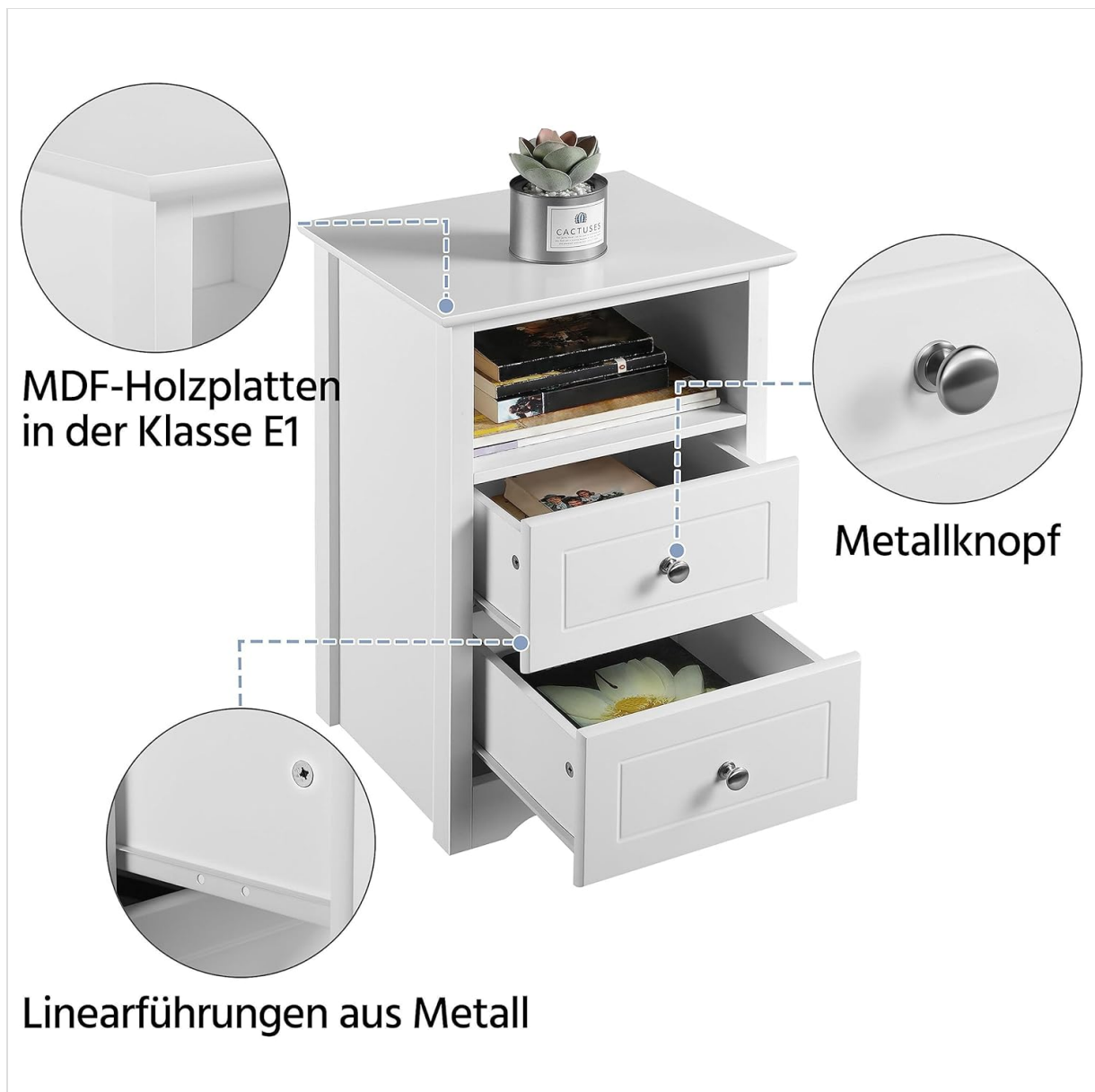
Figure 6: Material Properties. This image highlights the key characteristics of the materials used, including E1 emission class, water-repellent surface, ease of cleaning, and overall durability.