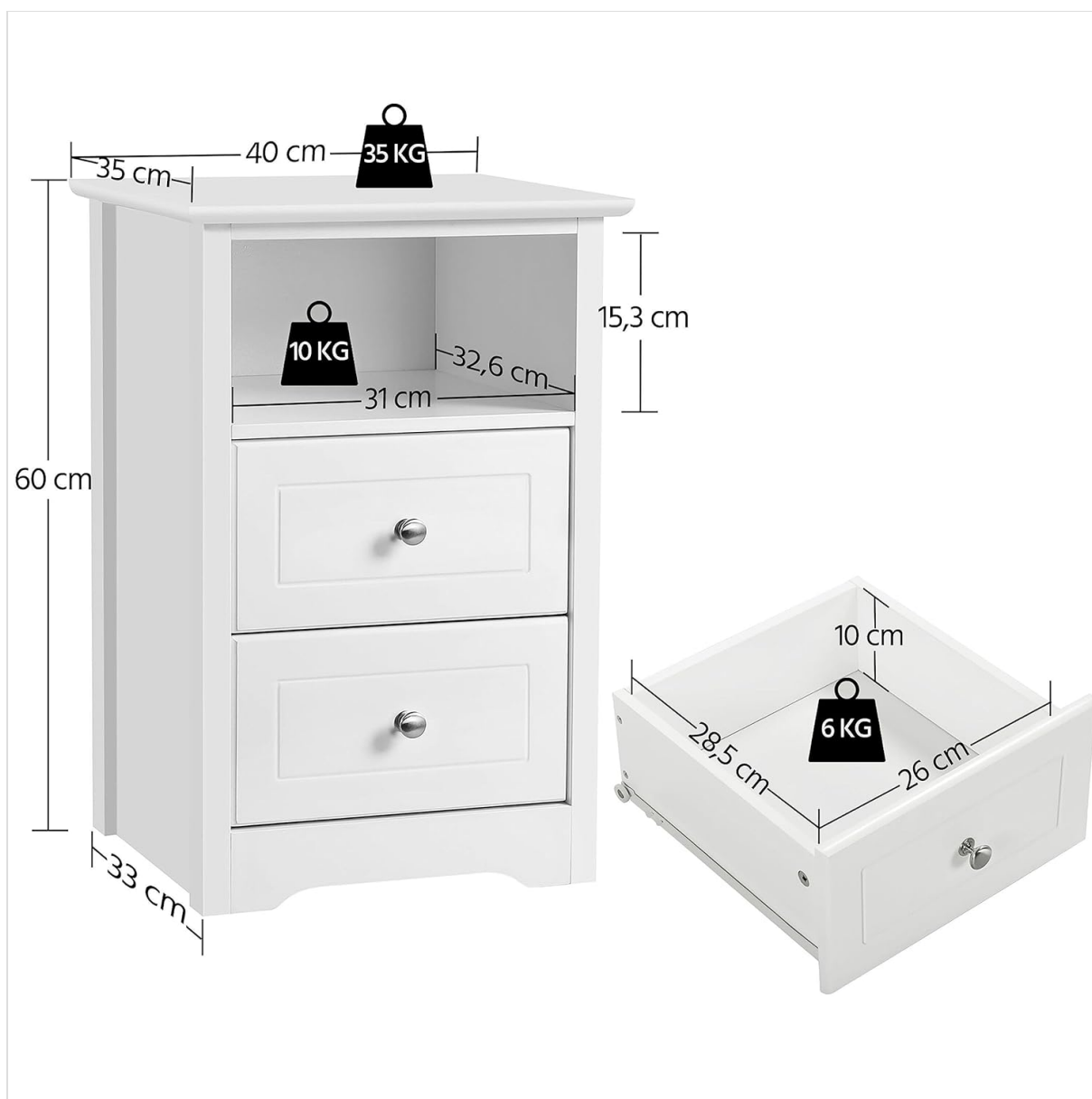
Figure 1: Dimensions and Load Capacities. This image illustrates the overall dimensions of the bedside cabinet (40 cm

Refer to the specific assembly manual for detailed diagrams and step-by-step instructions.