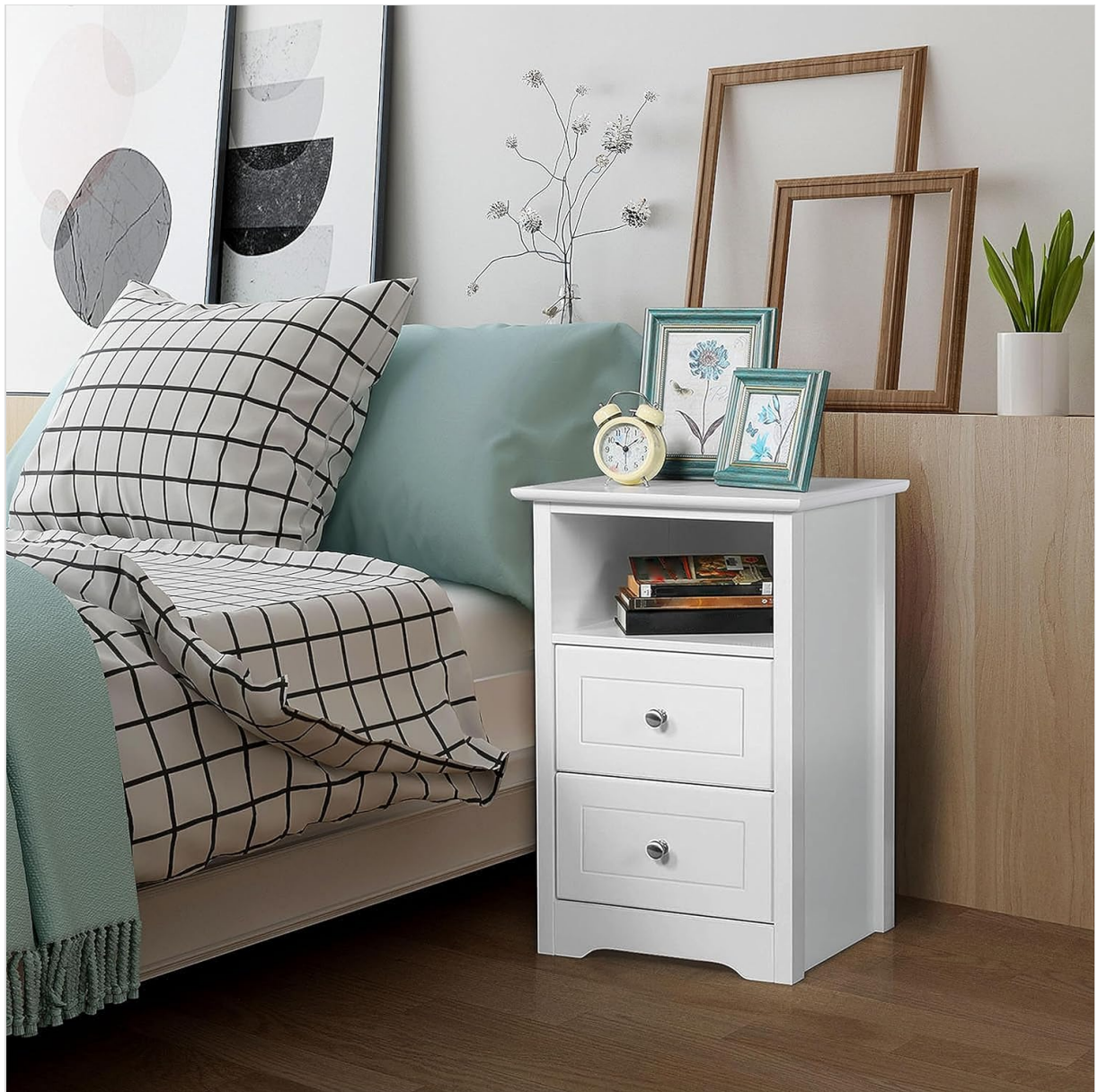
Figure 4: Bedside Cabinet in Bedroom. This image shows the bedside cabinet in a typical bedroom setting, demonstrating its use next to a bed with items placed on the open shelf and tabletop.