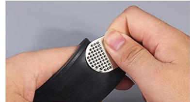
3. use metal rasp to grind the leak. Notice: Please note the rough area must be larger than the patch to ensure the bonding.