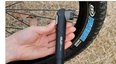
9. after then inflatable test and finish.

Image: Step-by-step visual guide for using the DAWAY A35 glueless tire patches, demonstrating how to locate a puncture, prepare the surface, apply the patch, and reinstall the inner tube.