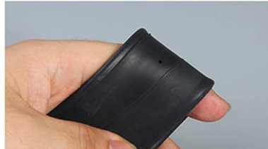
2. inflate the tube, find out where to leak