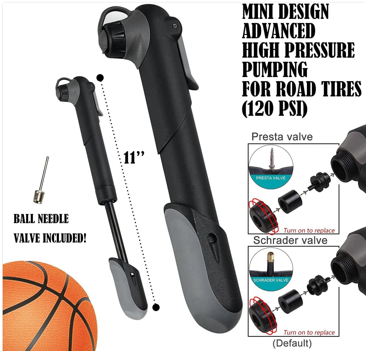
Image: The DAWAY A35 mini bike pump, illustrating its compact size and instructions for switching between Presta and Schrader valve compatibility.

Note: A ball needle valve is included for inflating sports balls.