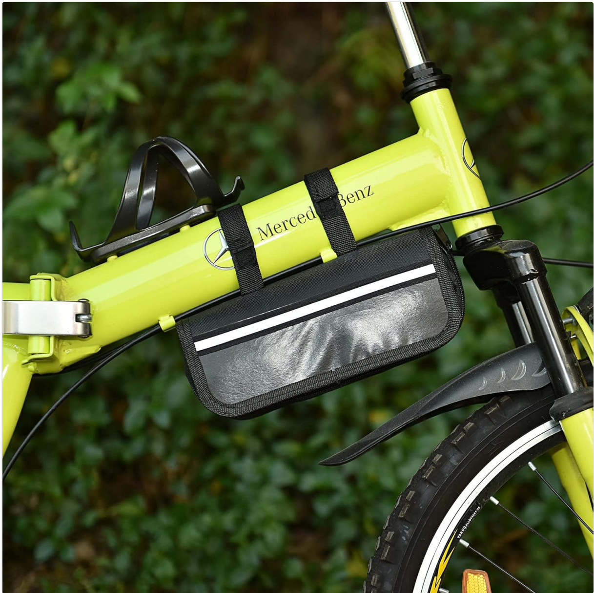
Image: The DAWAY A35 bike frame bag securely attached to a bicycle frame, demonstrating its compact and accessible design.