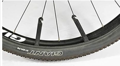
1. use tire levers, take out bike inner tube