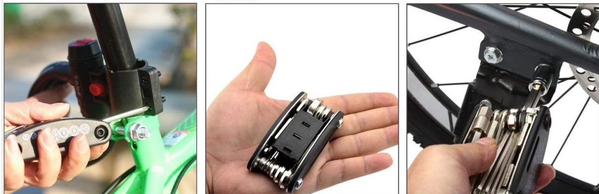
Image: The DAWAY A35 16-in-1 multifunction bike tool, displaying its various components including wrenches, screwdrivers, and hex keys.