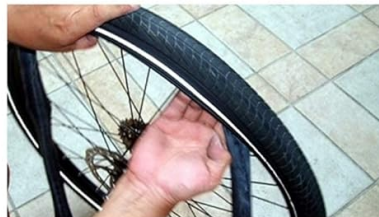
8. First install the inner tube please