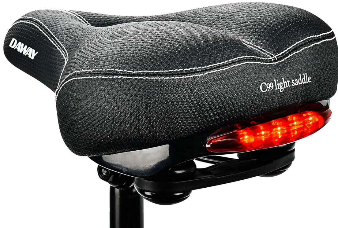
Image: Overview of the DAWAY C99 bike seat and included accessories like mounting tools, saddle adapter, and cover.