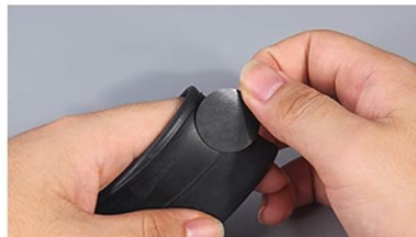
5. tear off tire tube patch, affixed to the leaky place