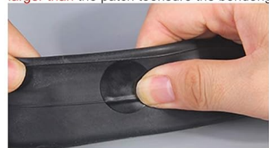
6. Press patch firmly on tube, about 1 minute