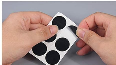
4. take out glueless tire tube patch