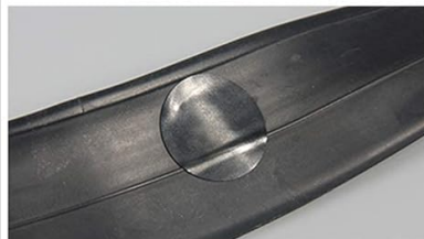
7. Wait 30 seconds to confirm that the patch is firmly attached to the tube. If not, please re-operate 3-6 steps