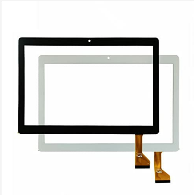
Image: Front view of the SRJTEK Touch Screen Replacement for HOOZO HZ0010, showing both black and white versions of the digitizer panel glass with their flex cables.

Warning: Attempting installation without proper knowledge and tools can lead to irreversible damage to your tablet or the new screen.