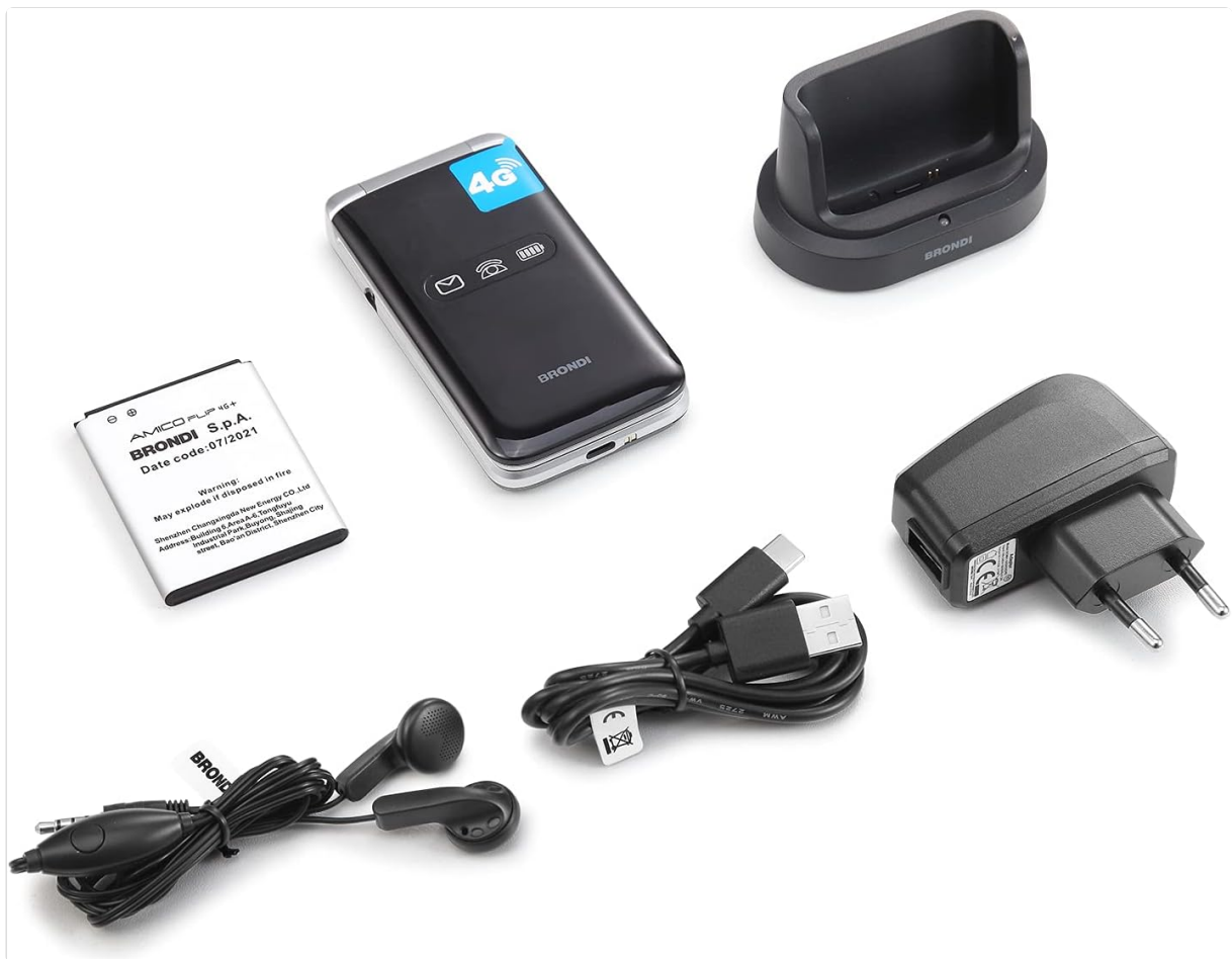
Image: All components included in the BRONDI Amico Flip 4G+ package.