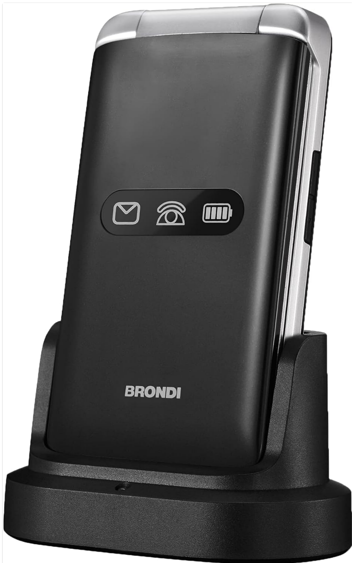
Image: The BRONDI Amico Flip 4G+ phone charging in its dedicated dock.