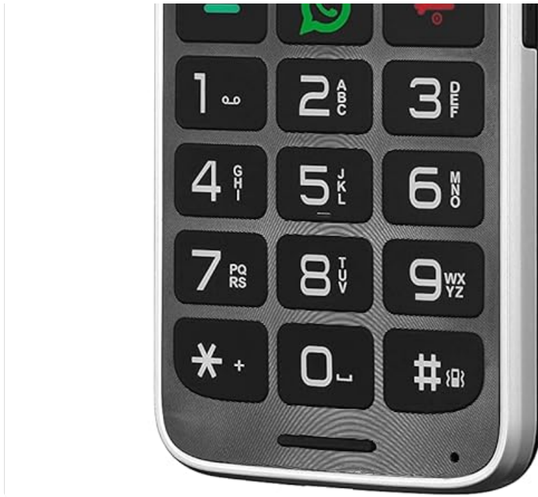
Image: The BRONDI Amico Flip 4G+ in open position, displaying the screen and keypad.