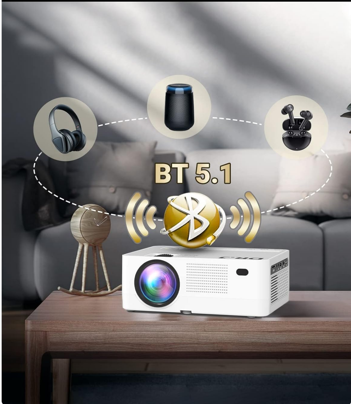
Figure 4: Steps for connecting Bluetooth audio devices to the projector.