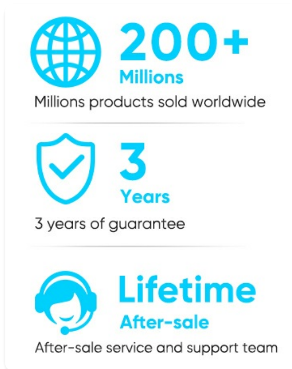
Figure 7: Warranty and support information.

Contact Information: Refer to your warranty card or visit the official PURSHE website for the most up-to-date support contact details.