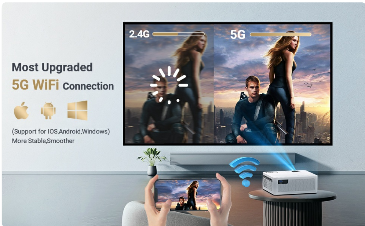
Figure 3: Illustration of 5G WiFi connection for stable and smoother streaming.