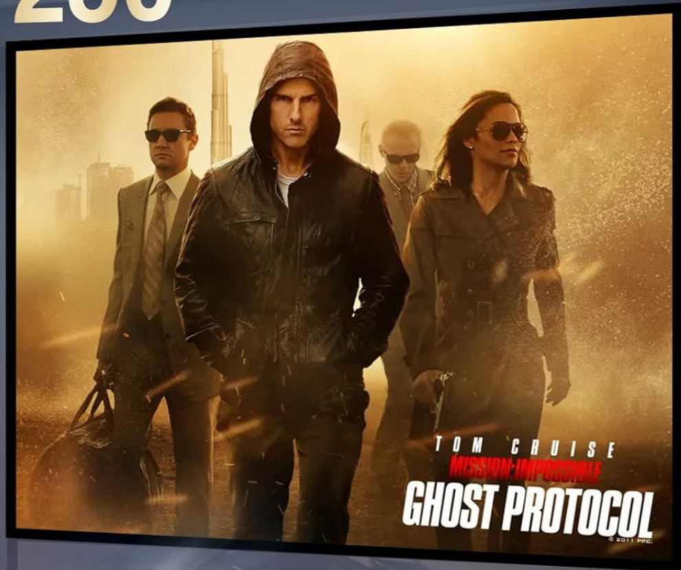
Figure 2: The projector displaying a large 250-inch movie screen, illustrating potential projection size.