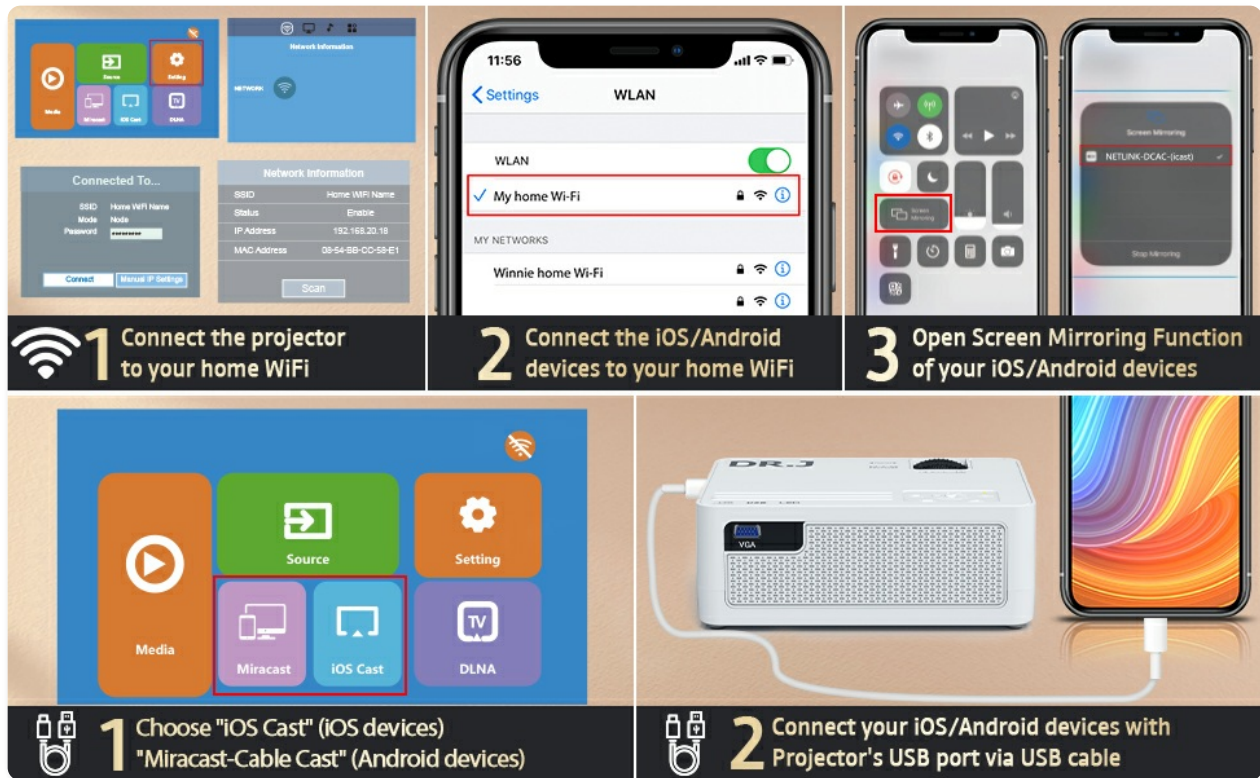
Figure 6: Detailed steps for wireless screen mirroring from mobile devices.