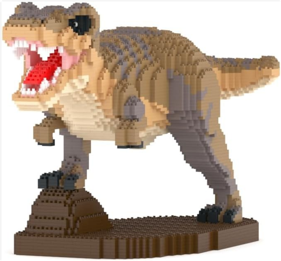
Figure 4.1: Front view of the completed JEKCA T-Rex model.