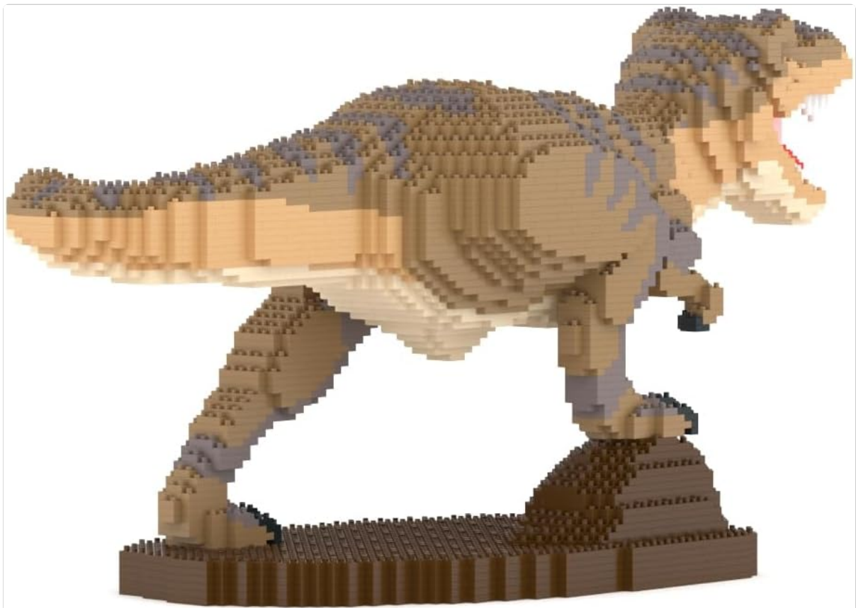
Figure 4.2: Side view of the completed JEKCA T-Rex model.