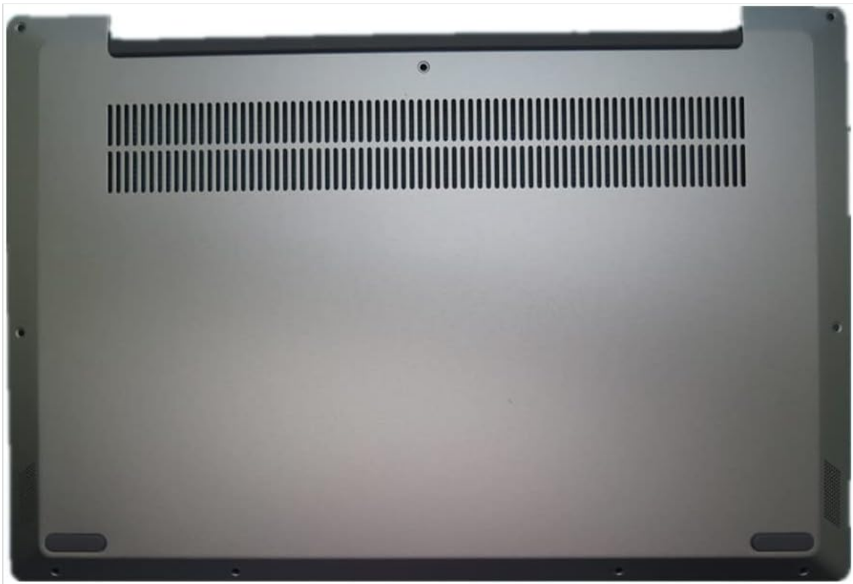
Image 1: Top-down view of the fqparts Replacement Laptop Bottom Case Cover (D Shell). This image displays the silver-colored bottom panel with ventilation slots and various screw mounting points. The design includes rubber feet cutouts and a central ventilation grille, essential for proper laptop cooling.