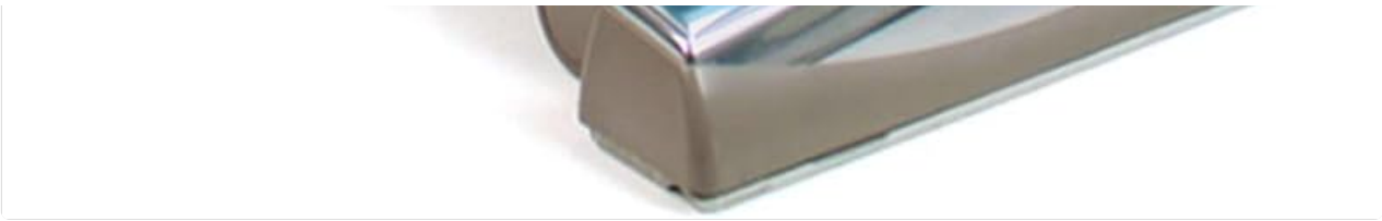
Figure 2: Side view of the Kirby Sentria 2, illustrating the handle and bag assembly.