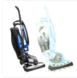
Figure 4: Examples of genuine Kirby filter bags and drive belts, essential for proper maintenance.