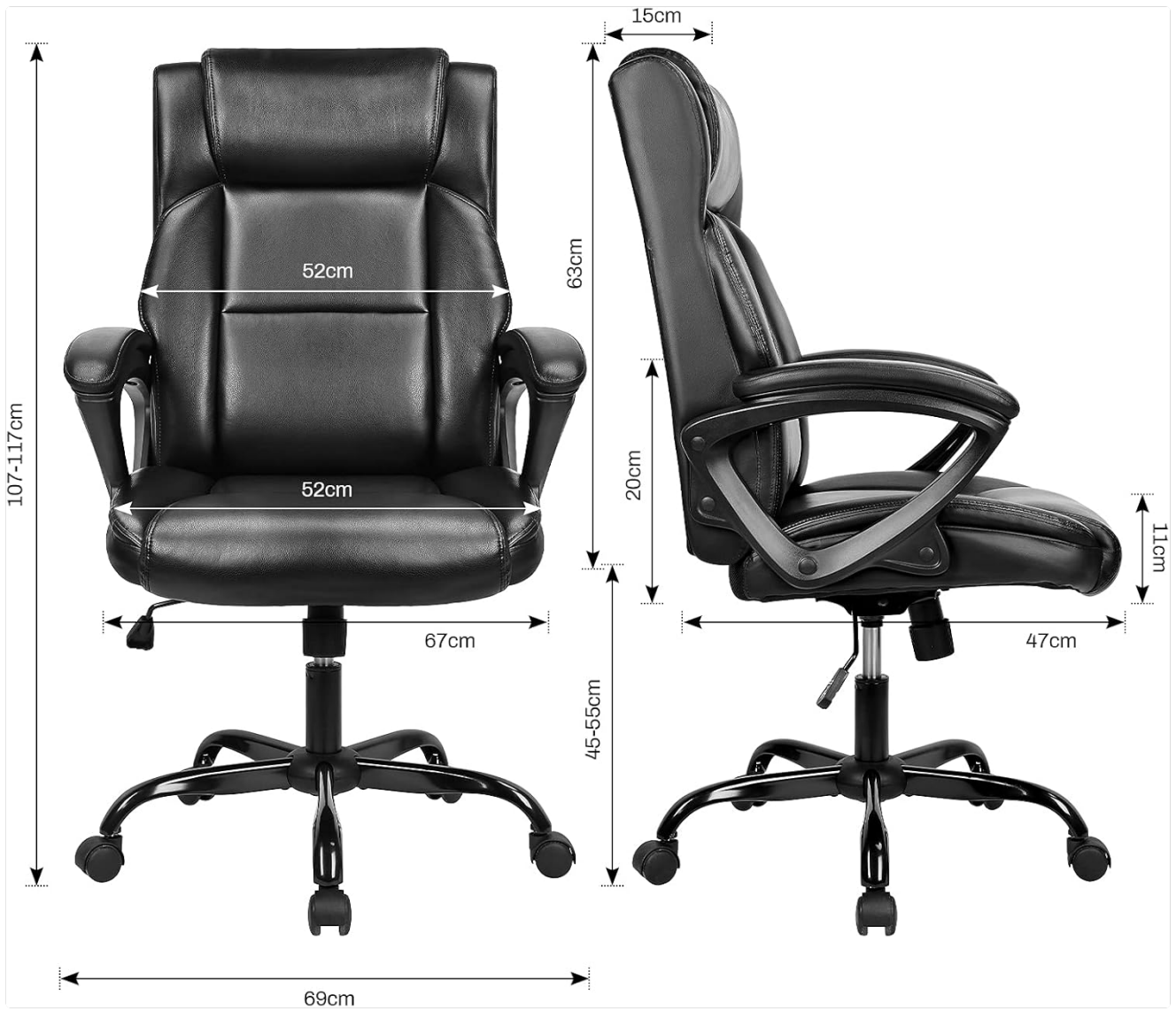
Figure 8.1: Detailed diagram showing the key dimensions of the Basetbl Executive Office Chair, including overall height, seat height range, seat width, and backrest height.