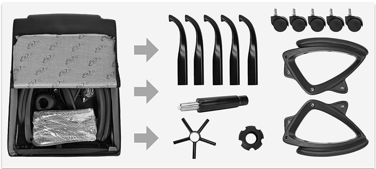
Figure 3.1: Illustration showing how chair accessories, including the gas lift, base, and casters, are stored within the zippered compartment of the chair's backrest for compact packaging.

Please be aware: the rest of the accessories are in the backrest