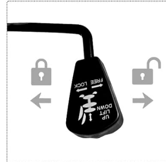
Height Adjustment Lever and Rocking Function Lock