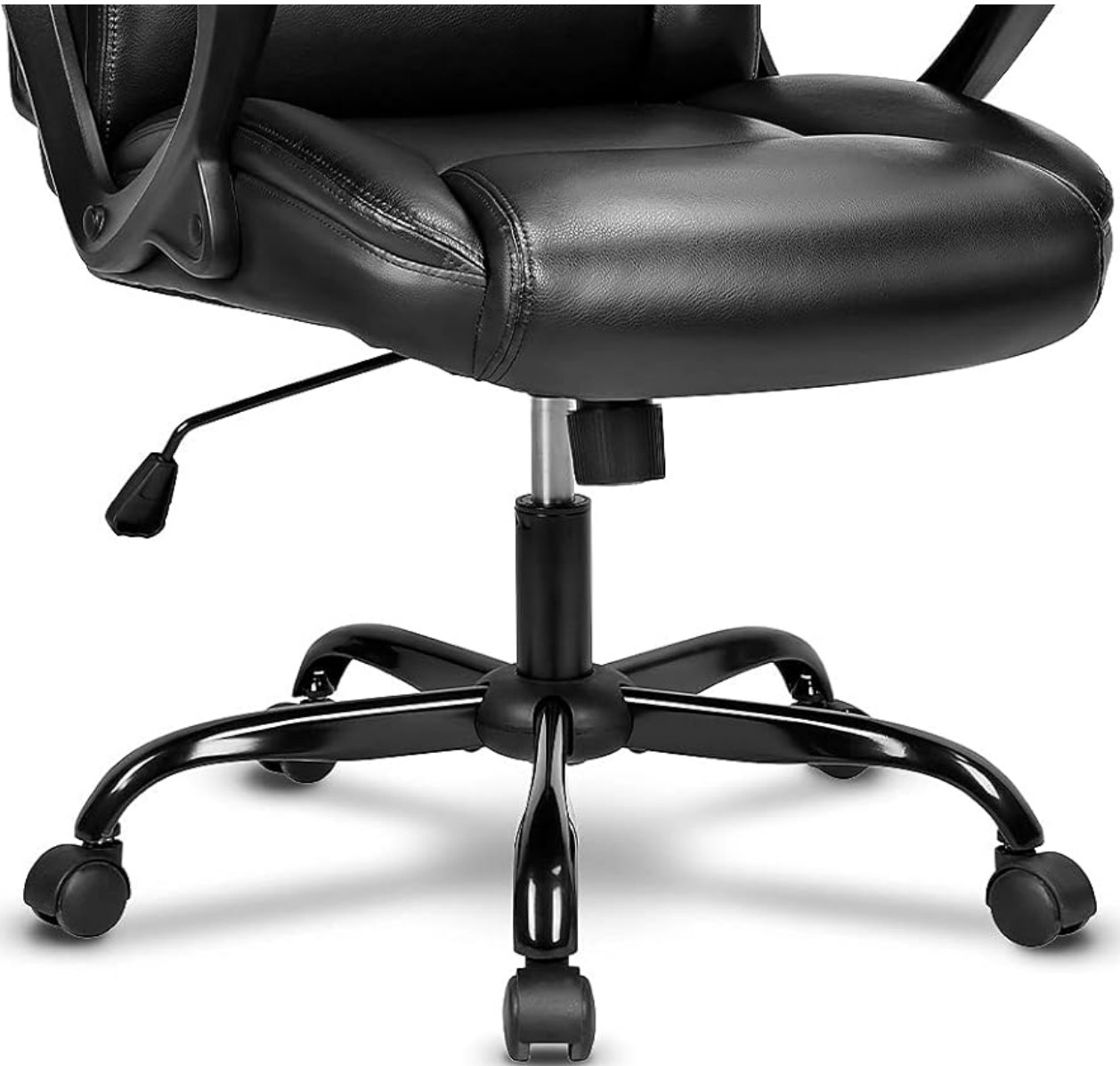
Figure 1.1: The BASETBL Executive Office Chair, featuring a high back, padded armrests, and a sturdy five-star base with casters.