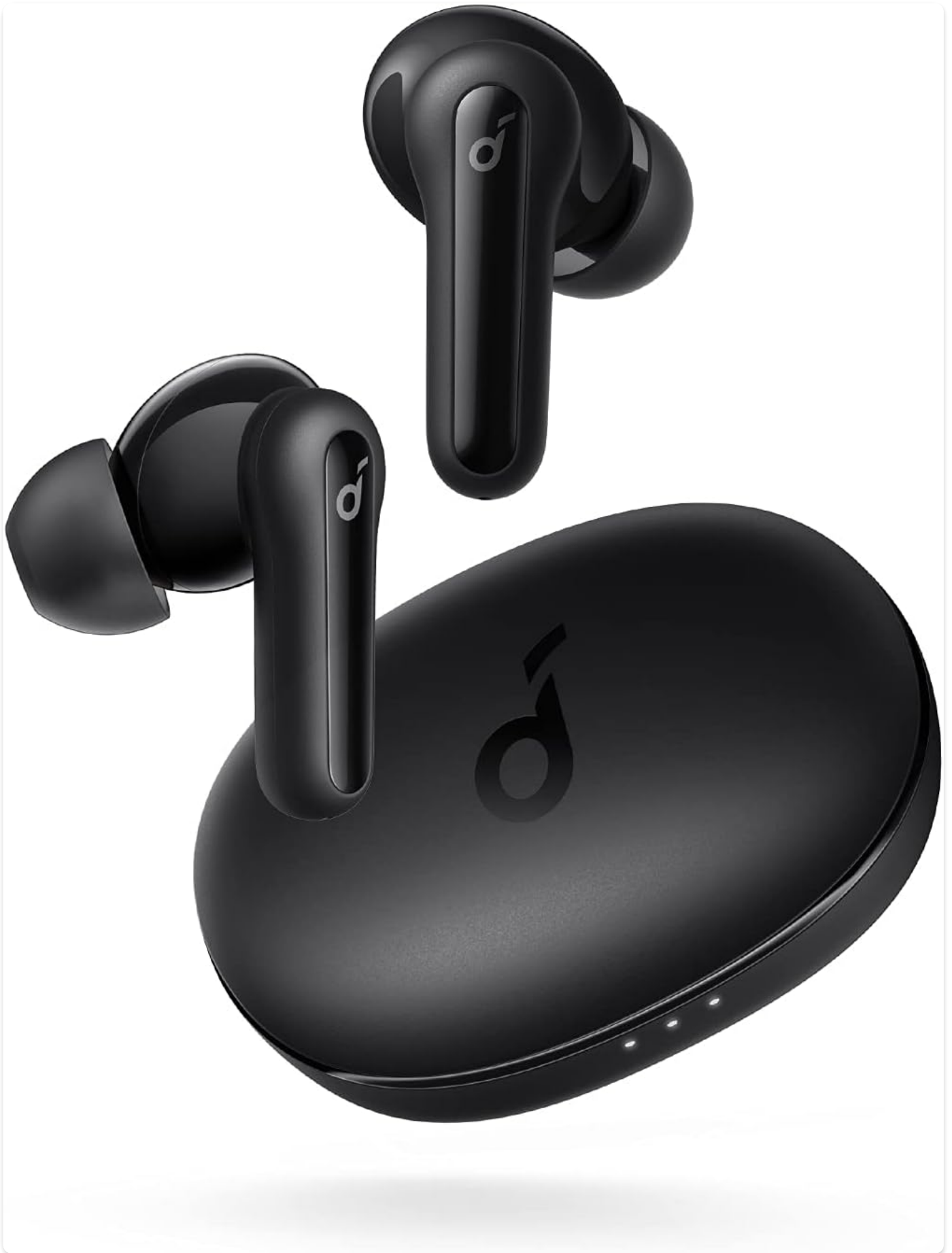
Image: Contents of the Soundcore Life P2 Mini package, including earbuds, charging case, and cable.