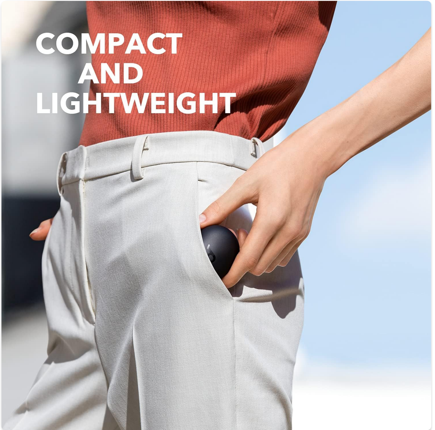
Image: A person wearing the Soundcore Life P2 Mini earbuds, demonstrating their comfortable and discreet fit.