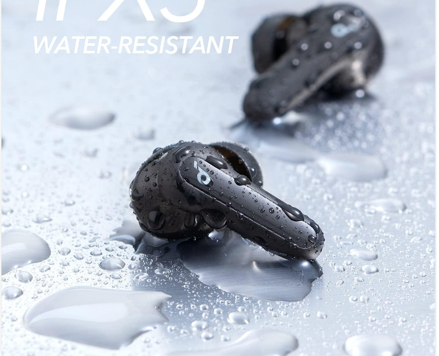
Image: Soundcore Life P2 Mini earbuds covered in water droplets, illustrating their IPX5 water-resistant rating.