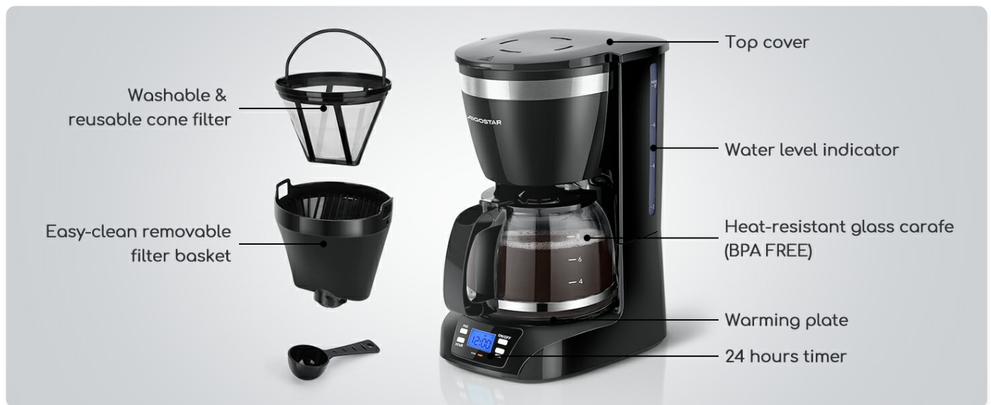
Figure 2: Digital Control Panel Overview