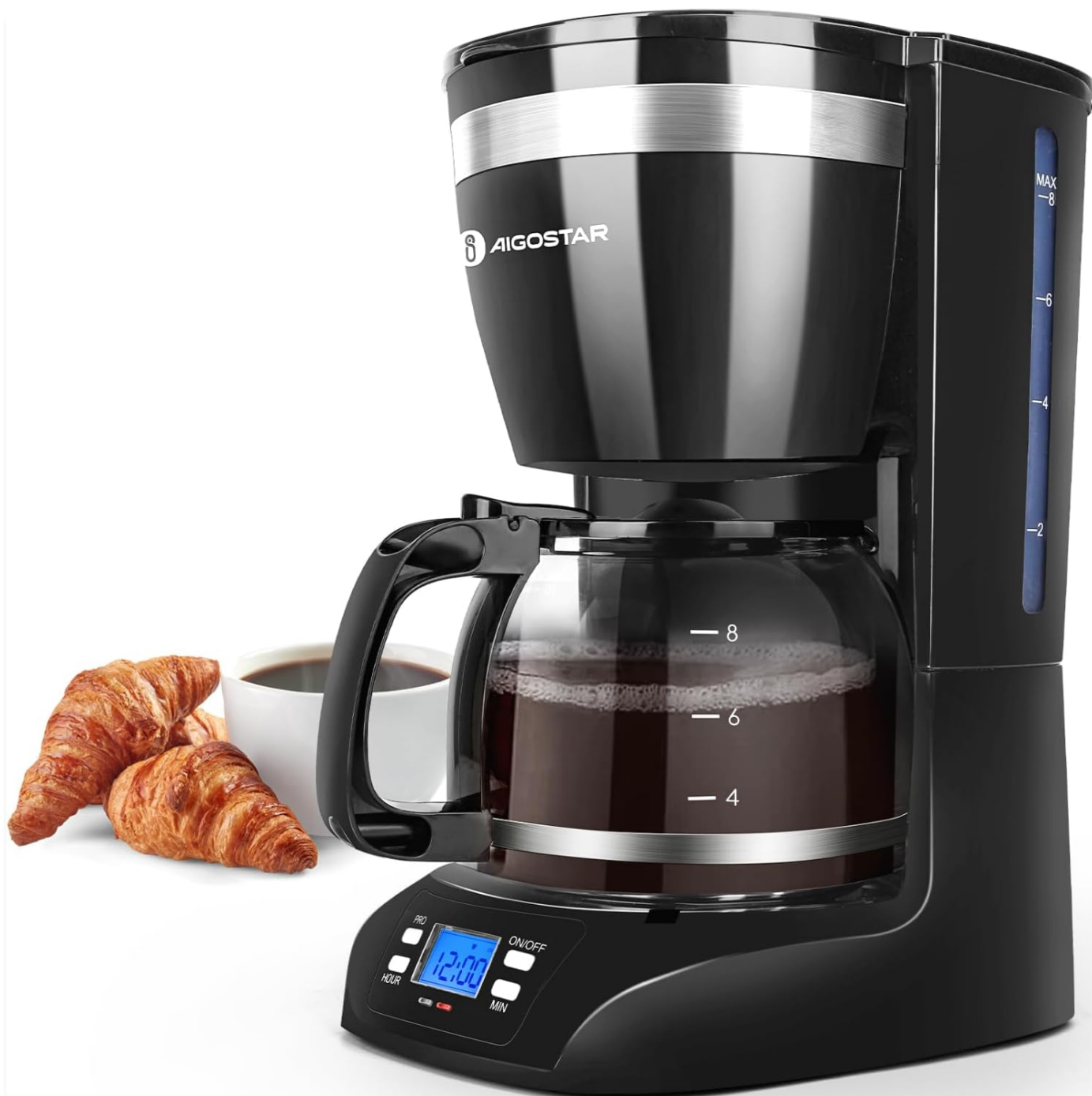
Figure 1: Aigostar Benno 8-Cup Programmable Drip Coffee Maker