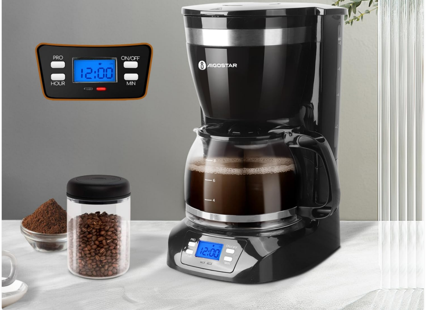
Figure 4: 24-Hour Programmable Timer Feature

Enjoy fresh hot coffee to wake up every morning