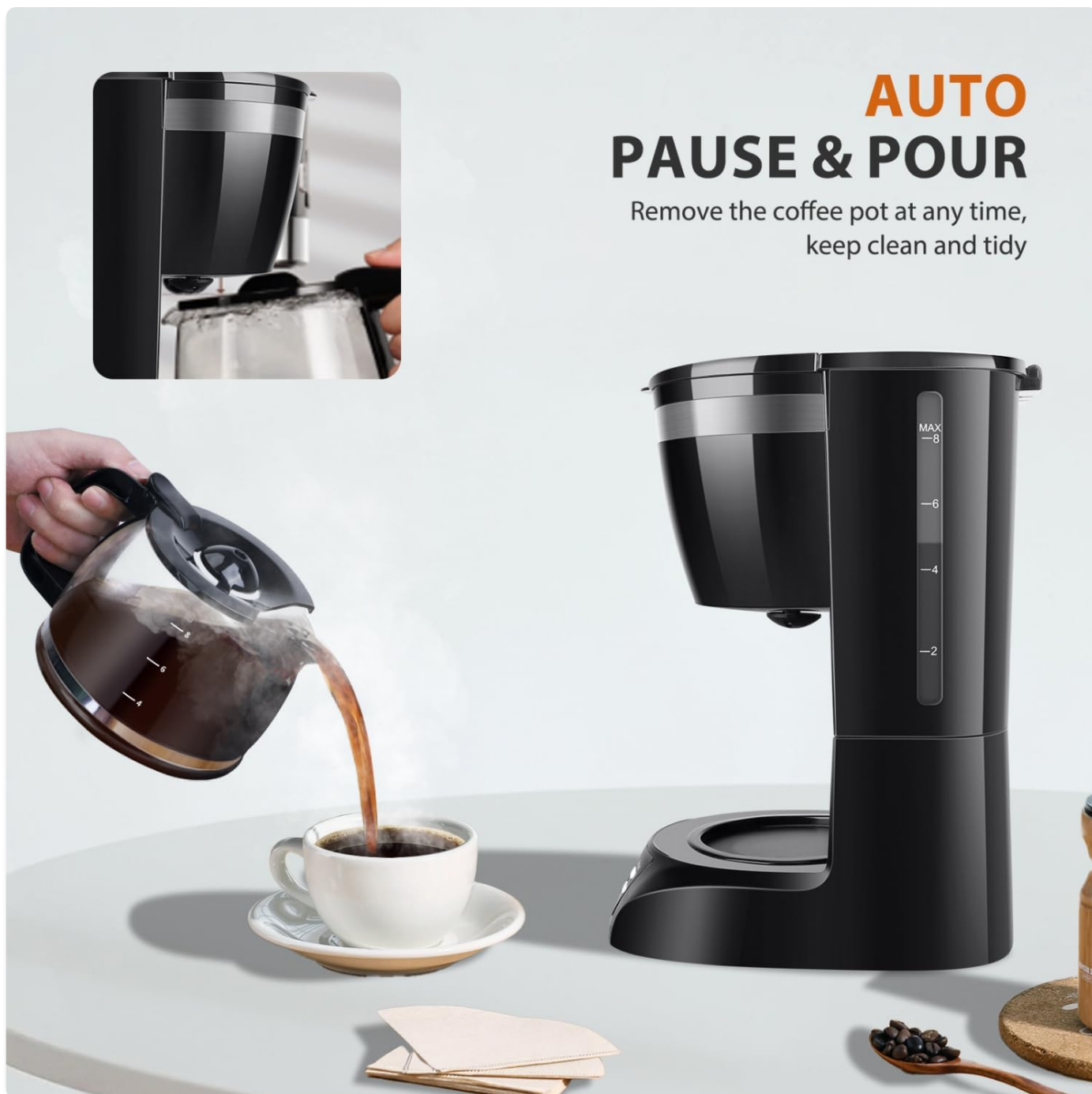
Figure 5: Brew Pause Function in action