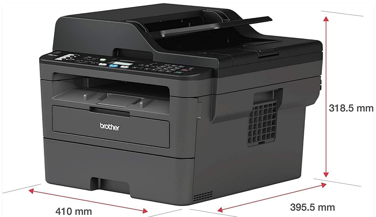
Figure 2: Brother MFC-L2710DW Series Printer with approximate dimensions (15.7"D x 16.1"W x 10.7"H).