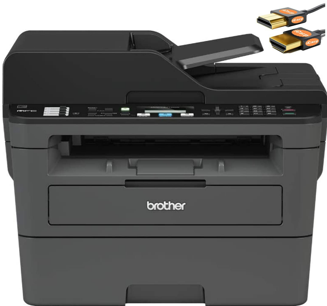
Figure 1: Front view of the Brother MFC-L2710DW Series All-in-One Printer.