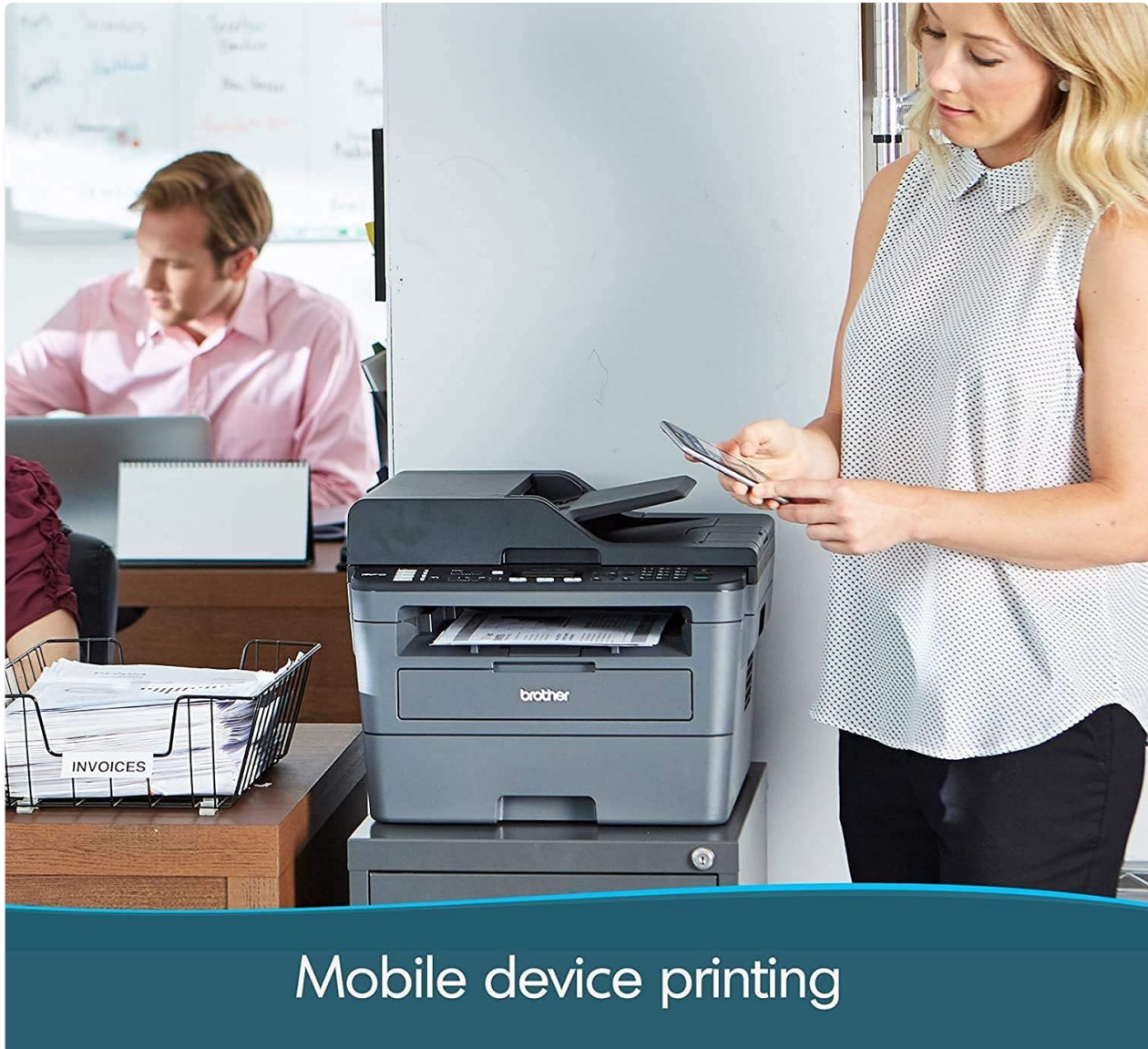
Figure 6: Printing directly from a mobile device to the Brother MFC-L2710DW.

The MFC-L2710DW supports wireless printing from various devices. Ensure your device is connected to the same Wi-Fi network as the printer. For mobile printing, download the Brother iPrint&Scan app or use compatible services like Apple AirPrint or Google Cloud Print.