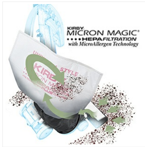
Image: Diagram illustrating the Kirby Micron Magic HEPA filtration system with MicroAllergen Technology, showing airflow and particle capture.