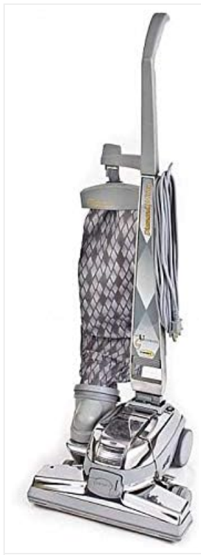
Image: The Kirby Ultimate Diamond Edition vacuum cleaner in its upright position, ready for use.