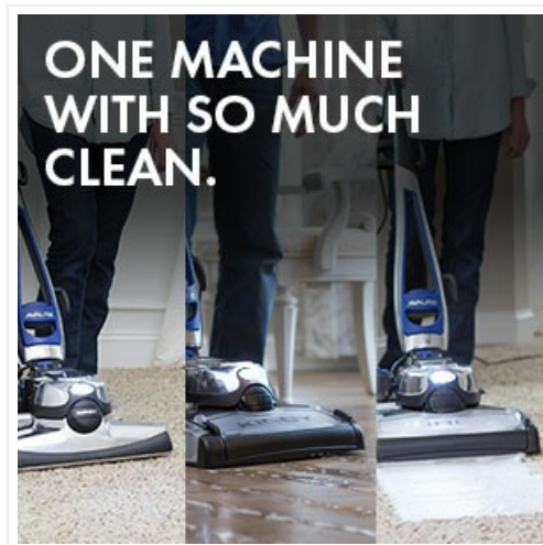
Image: Illustration showing the Kirby vacuum cleaner adapting to various cleaning tasks, from upright vacuuming to using attachments for specialized cleaning.