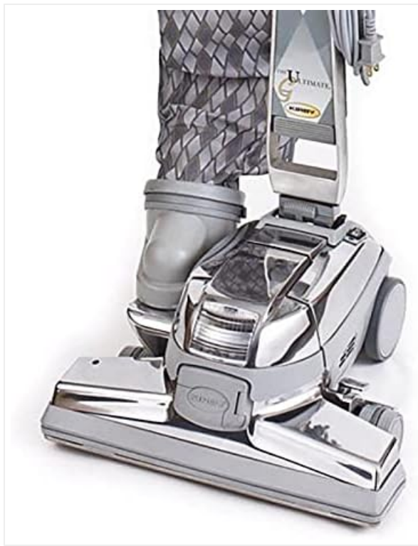
Image: A detailed view of the main power nozzle of the Kirby Ultimate Diamond Edition vacuum cleaner.