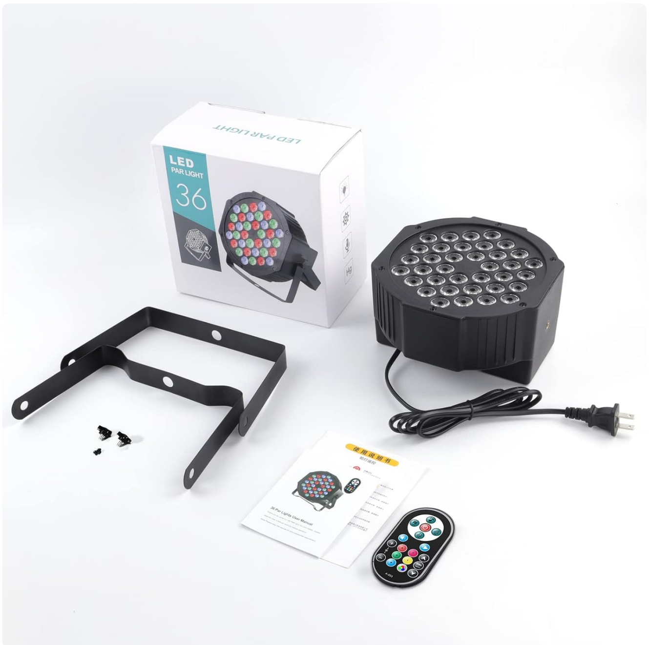
Figure 4: Detailed view of the remote control functions for the LED Par Light.