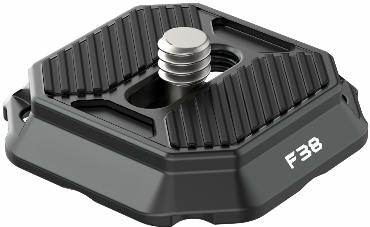
Image: ULANZI FALCAM F38 Camera Quick Release Plate, a versatile mounting accessory.