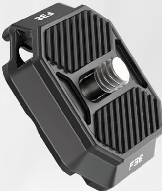
(For PD )