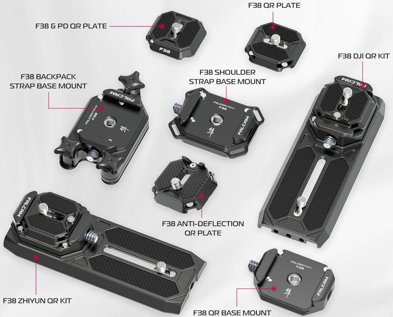
Image: Overview of the FALCAM F38 Quick Release Ecosystem, illustrating various compatible components like QR plates, backpack strap mounts, shoulder strap base mounts, and anti-deflection QR plates.

We take all camera video shooting using scenes in to consideration