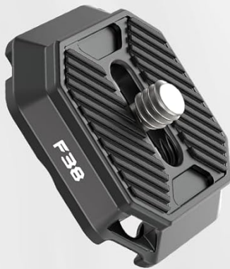
(For F38 series )