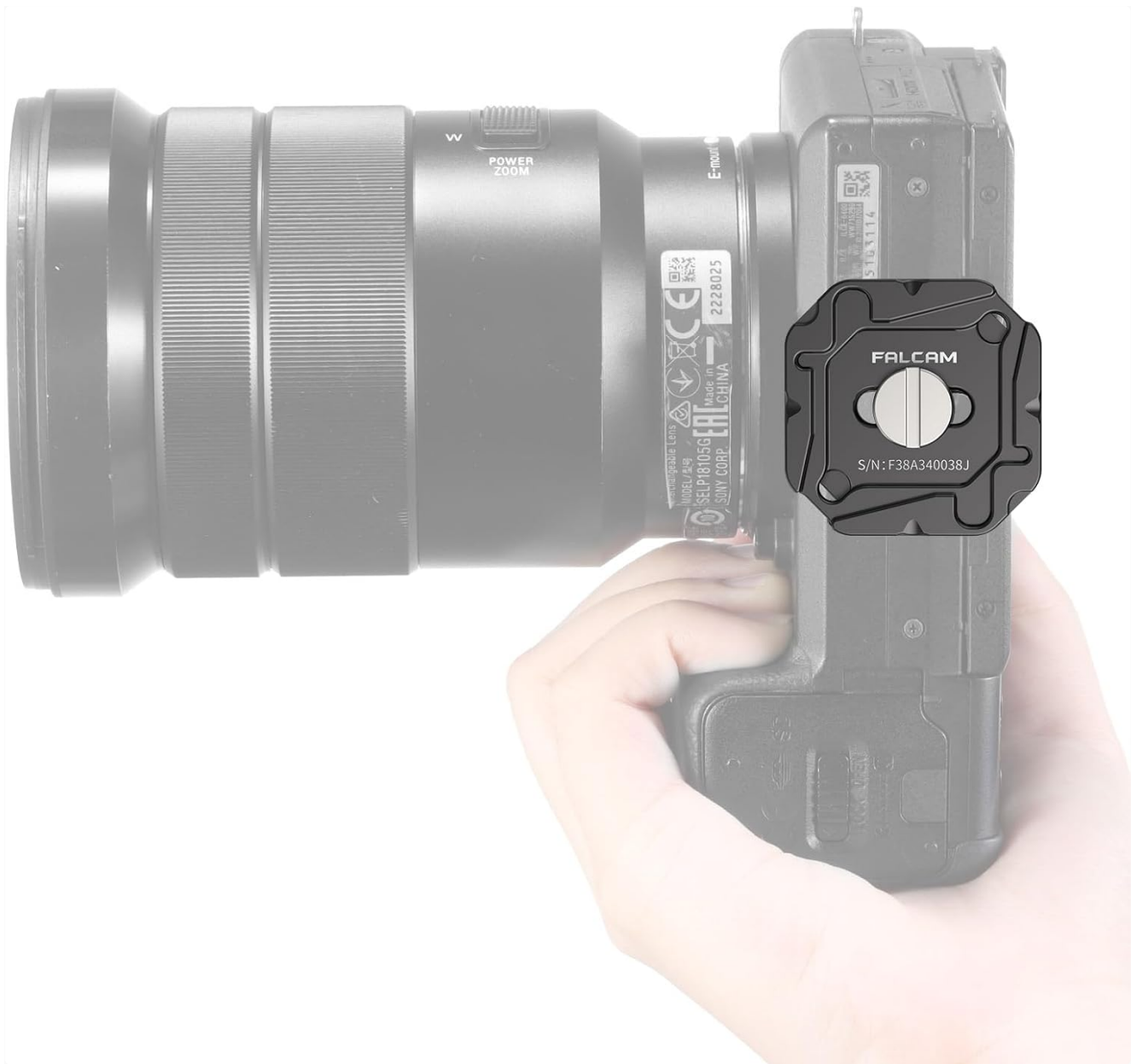
Image: A camera with the ULANZI FALCAM F38 Quick Release Plate attached, demonstrating its compact and secure fit.