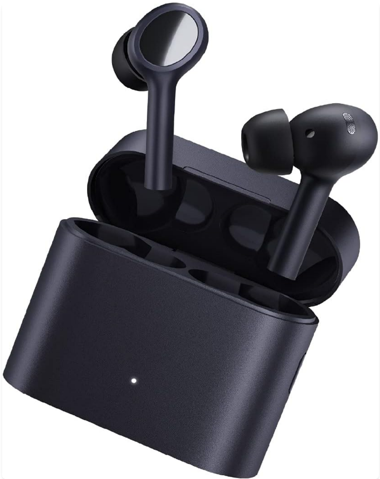
Image: Xiaomi True Wireless Earphones 2 Pro, showcasing both earbuds and the open charging case. The earbuds are black with a sleek, in-ear design, and the charging case is also black with a matte finish, featuring a small LED indicator light on the front.