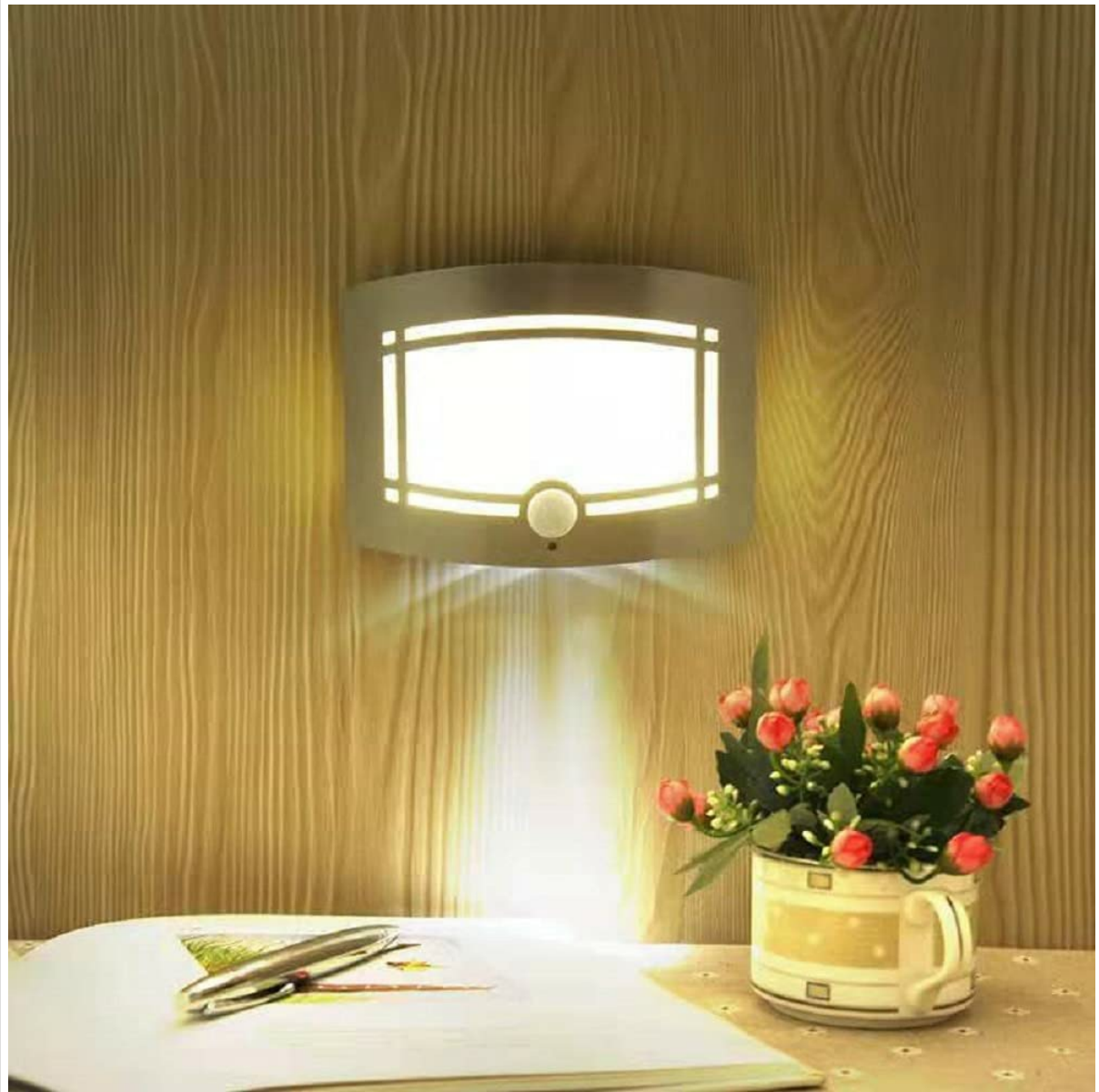
The DEXIN 10 LED Motion Sensor Wall Lamp illuminated, showing its light output and integrated motion sensor.

When set to High Light or Low Light mode, the motion sensor will activate the light for approximately 30 seconds after detecting movement. The light will turn off automatically if no further motion is detected within that period.