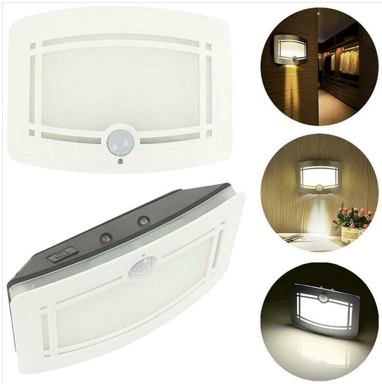
The DEXIN 10 LED Motion Sensor Wall Lamp providing ambient light in a room, showcasing its functional design.