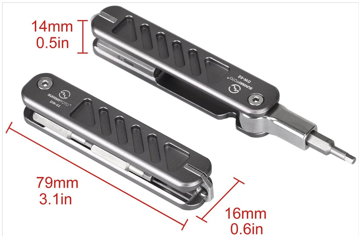
Dimensions of the SUNWAYFOTO DW-02 tool.