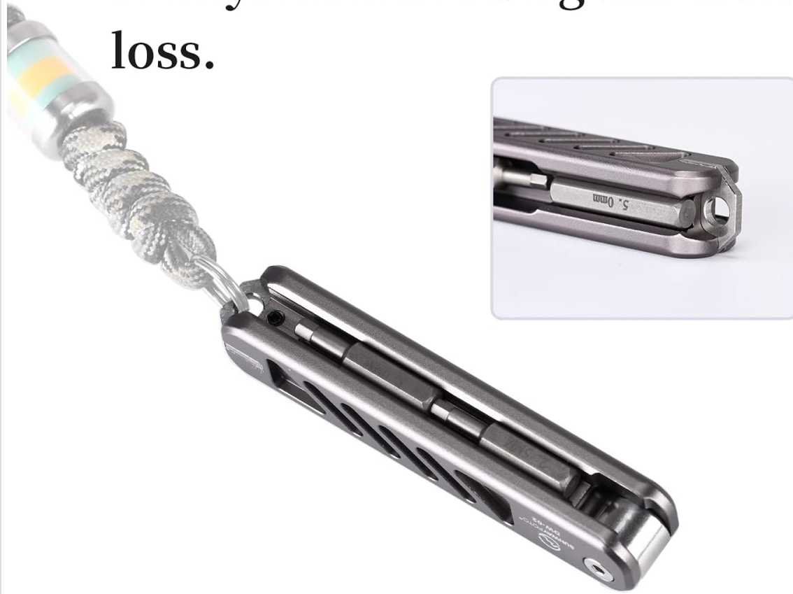
Image: Illustration of how to insert and remove the magnetically attached bits from the tool's casing.