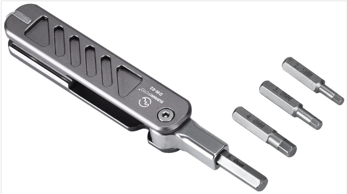
Image: The SUNWAYFOTO DW-02 folding tool set, showcasing the main unit and its individual hex key and flat screwdriver bits.