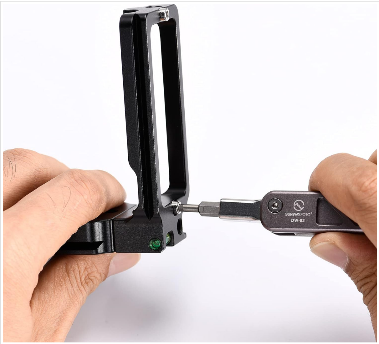
Image: The keychain hole feature on the DW-02 tool, designed to prevent accidental loss.