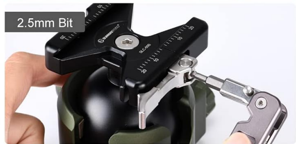
Image: Examples of the DW-02 tool in use, demonstrating its application on different photography accessories.