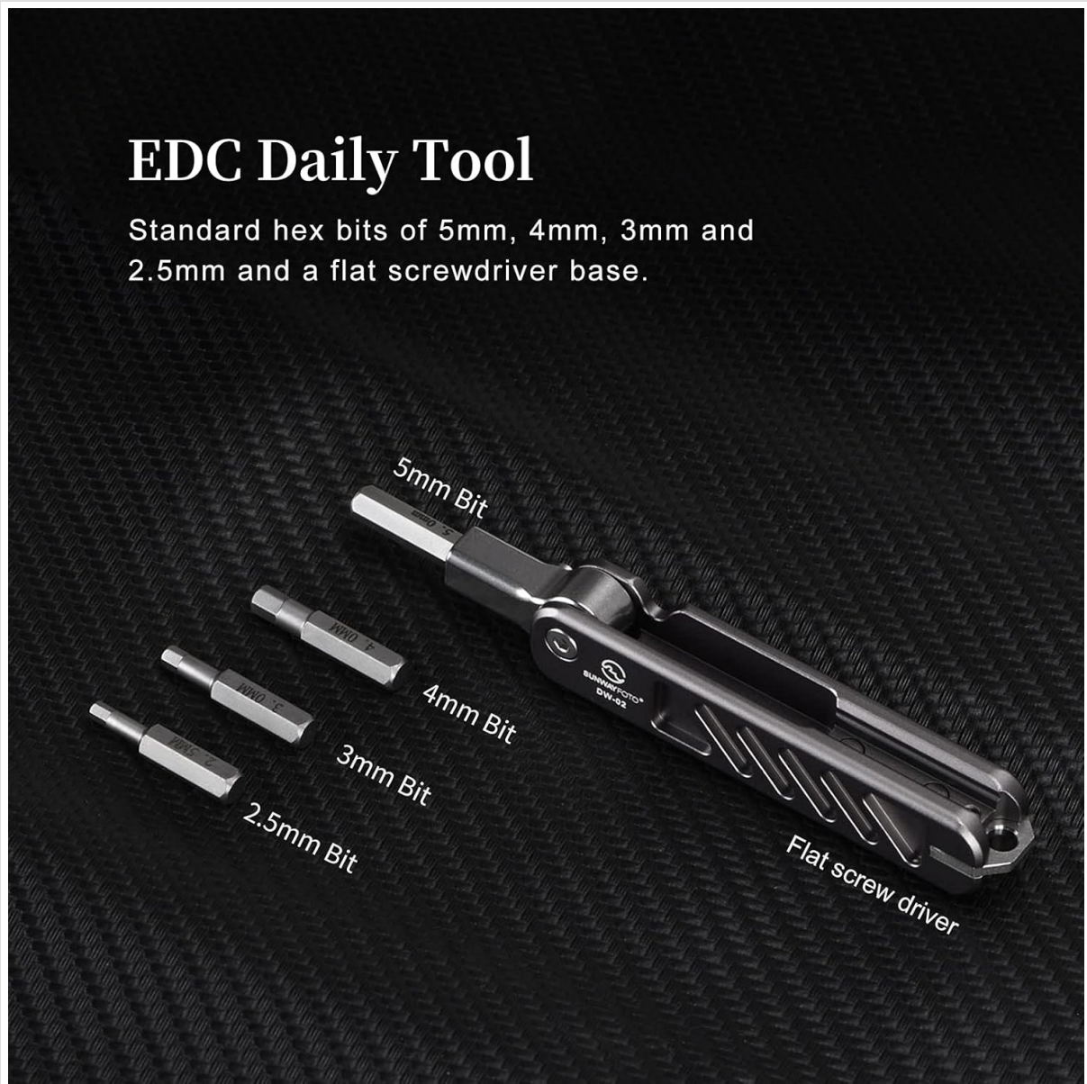
Image: Detailed view of the DW-02 tool, highlighting the various hex key sizes (5mm, 4mm, 3mm, 2.5mm) and the flat screwdriver bit.

Standard hex bits of 5mm, 4mm, 3mm and 2.5mm and a flat screwdriver base.