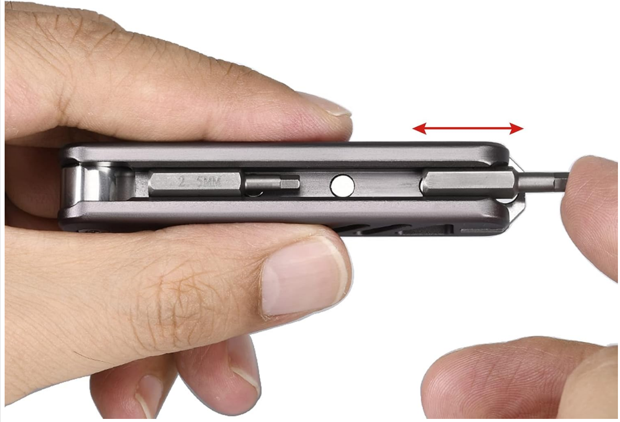
Image: The DW-02 tool being used to adjust a screw on a camera accessory.