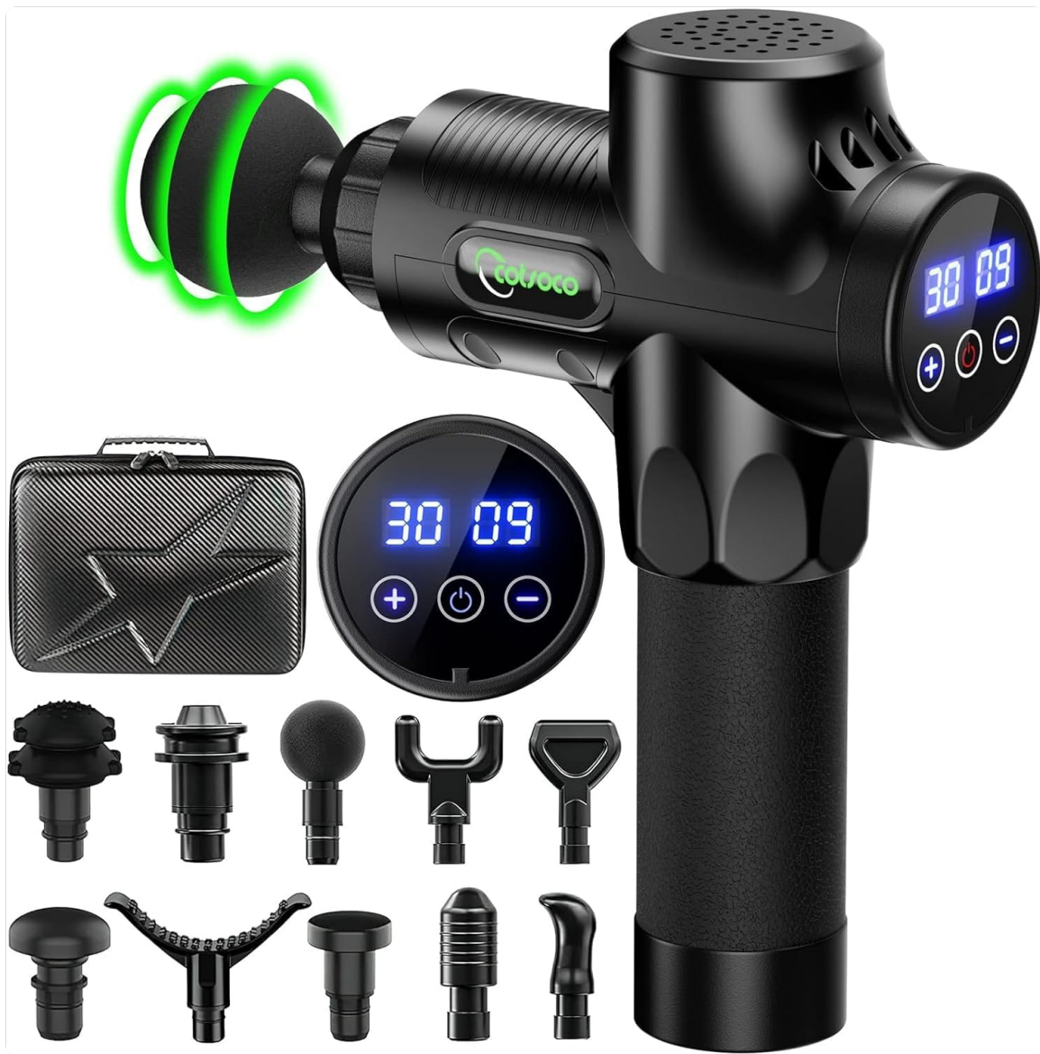
Figure 1: The cotsooco Hand Massager with its full set of accessories, including various massage heads and a protective carrying case.