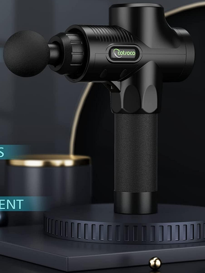
Figure 4: The massager features a large capacity 2200mAh battery, providing extended use on a single charge.