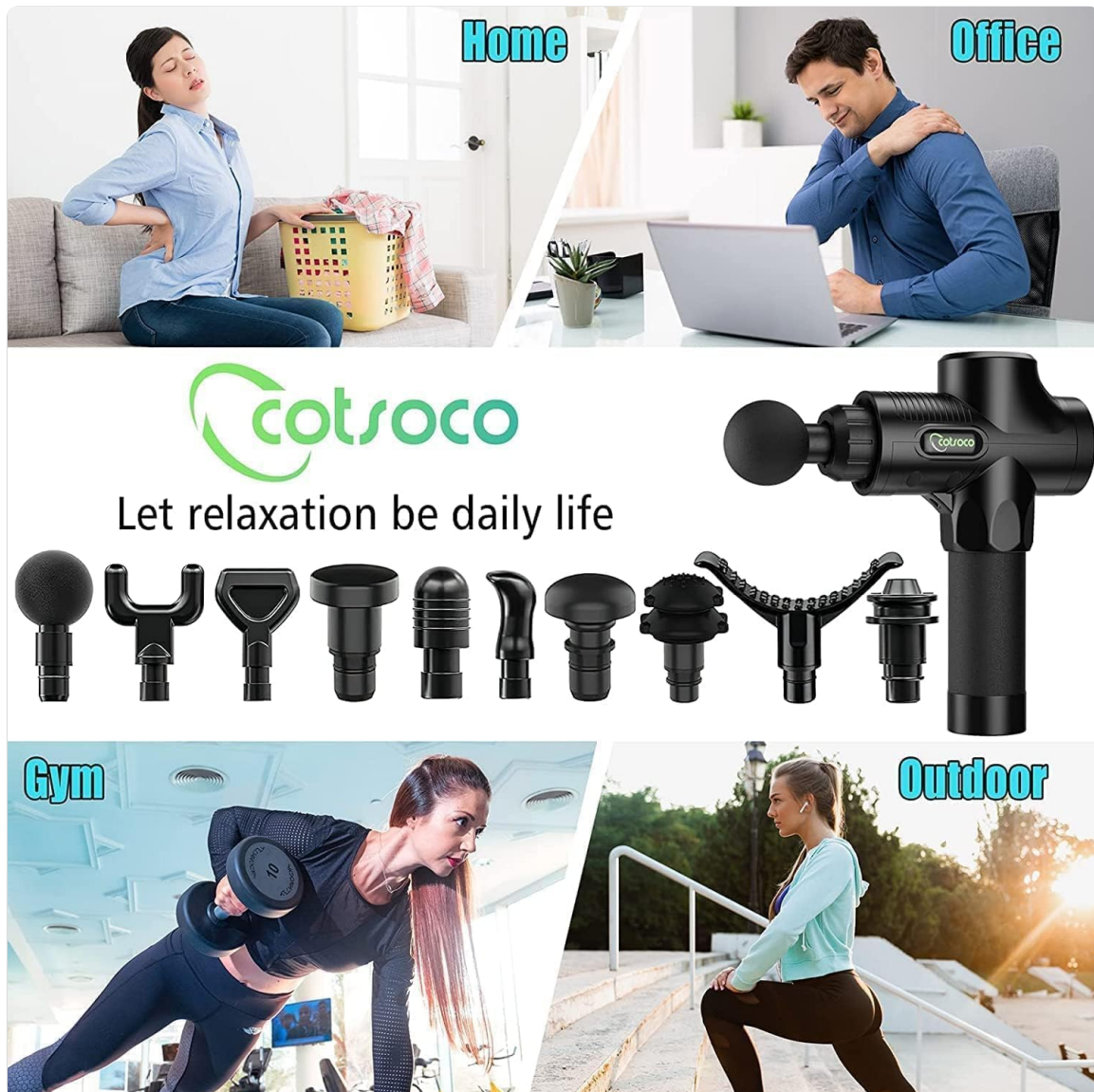
Figure 5: The massager provides quick muscle soreness relief with its deep amplitude percussion.

Gently apply the massager to the desired muscle area. Move the device slowly over the muscle, applying light to moderate pressure. Refer to the 'Massage Head Guide' section for recommendations on which head to use for specific areas and purposes.