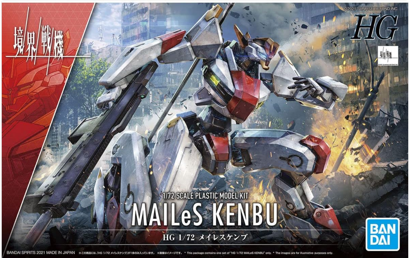
Figure 1: The product box for the MAILeS KENBU model kit, showing the assembled model and accessories.