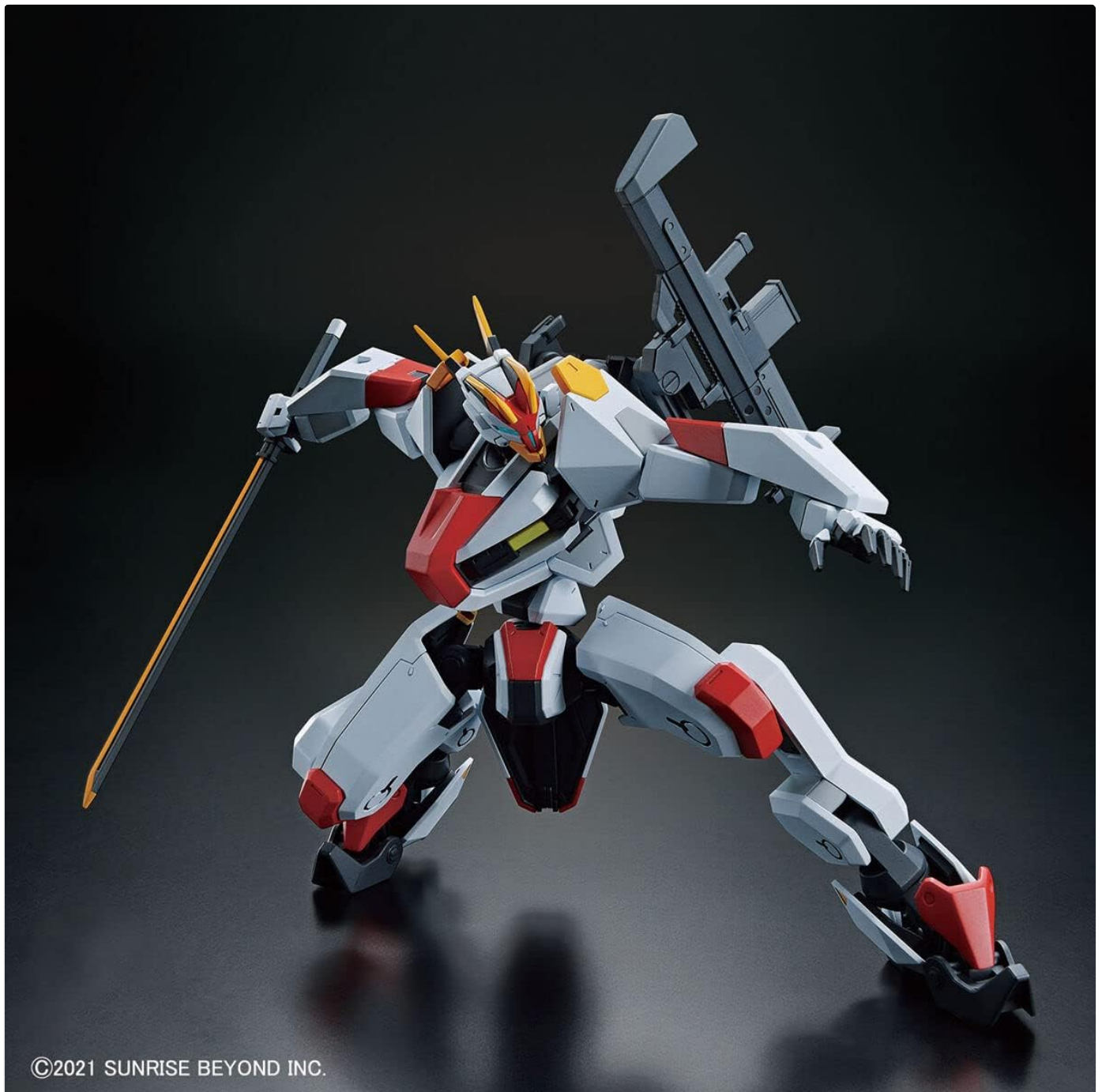
Figure 4: MAiLeS KENBU in a dynamic pose with its sword.