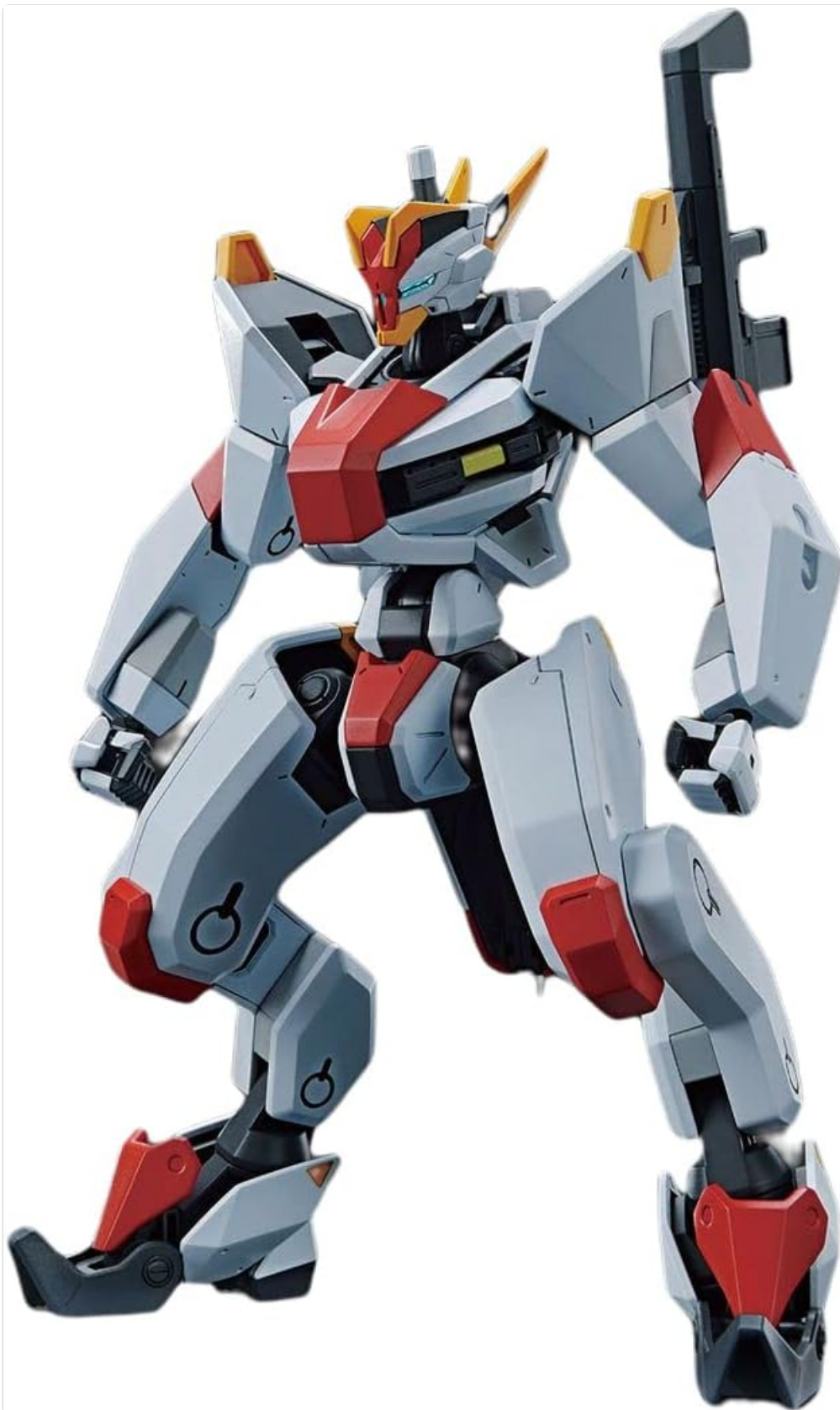
Figure 2: The MAiLeS KENBU model kit fully assembled, showcasing its detailed design.