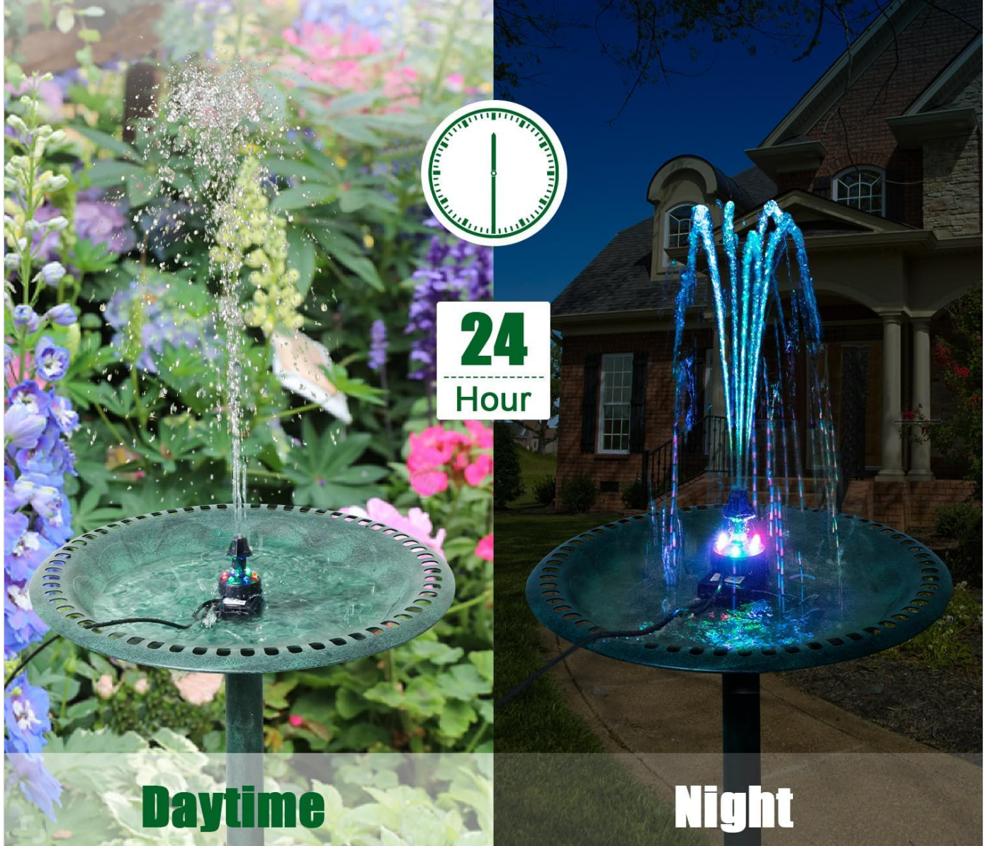
Figure 2: 24-Hour Operation of the SZMP Fountain Pump.

This image illustrates the continuous operation of the SZMP Bird Bath Fountain Pump, showing it active during both daytime and nighttime. The daytime view displays a clear water spray, while the nighttime view highlights the vibrant colorful LED lights illuminating the fountain, emphasizing its 24-hour functionality.