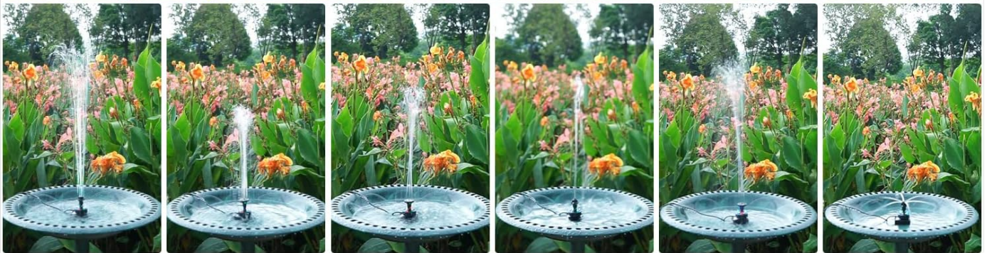
Figure 1: SZMP Bird Bath Fountain Pump in operation with colorful LED lights.

This image shows the SZMP Bird Bath Fountain Pump installed in a bird bath, producing a water spray. The pump features colorful LED lights that illuminate the water, creating an attractive display. The bird bath is surrounded by vibrant flowers, highlighting its use in a garden setting.