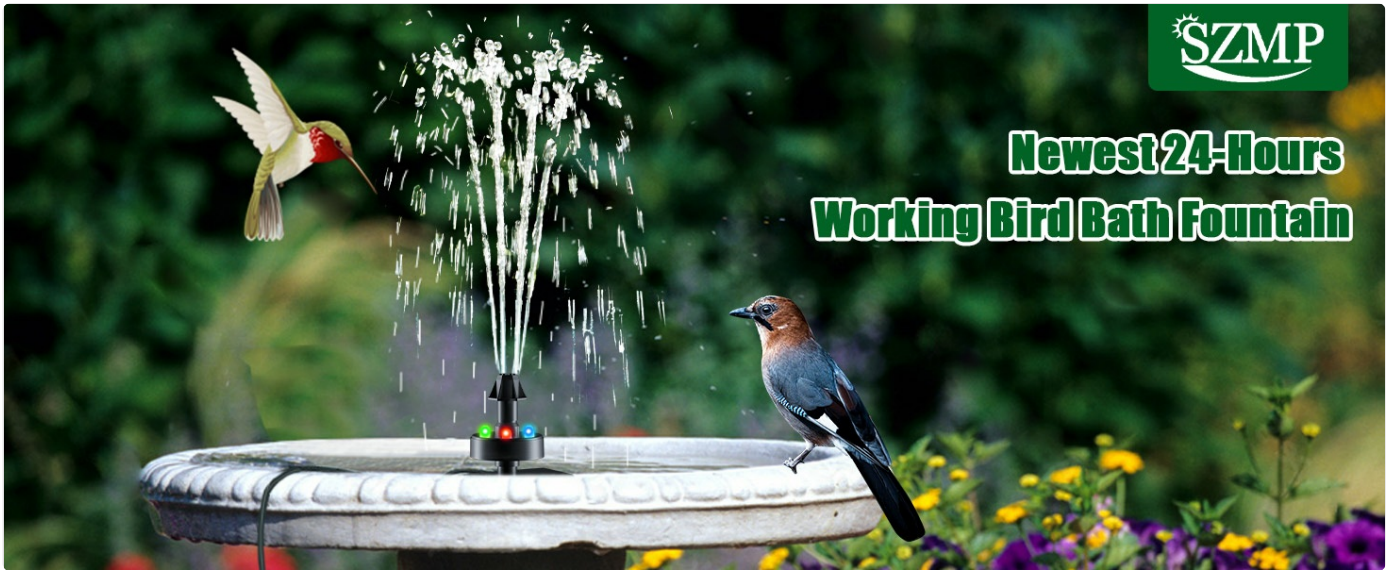
Figure 3: Components of the SZMP Fountain Pump.

This diagram illustrates the main components of the SZMP Bird Bath Fountain Pump, including the pump body, the attachment point for nozzles, and the power cord connection. This visual aid assists in understanding how to assemble and prepare the pump for use.